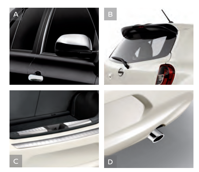
See your Nissan dealer for details, or go to accessories.nissan.ca