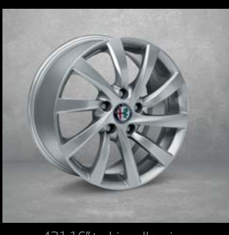
431 16" turbine alloy rims with 205/55 tyres