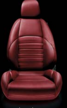
Leather 401 Red (opt)