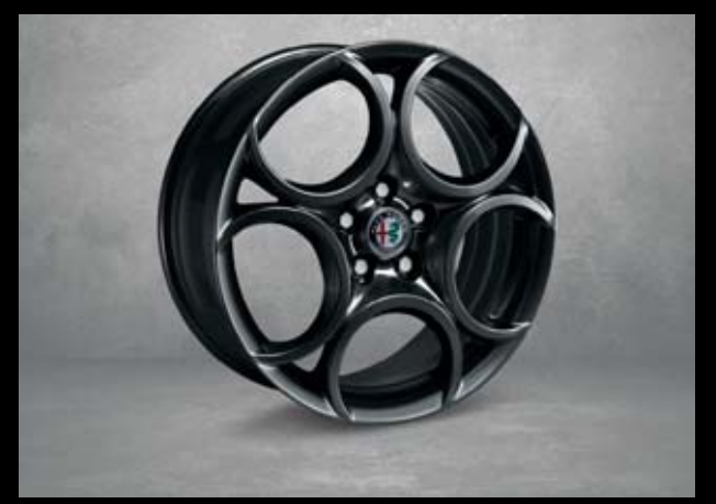
5FB 18" black five-hole alloy rims with 225/40 tyres