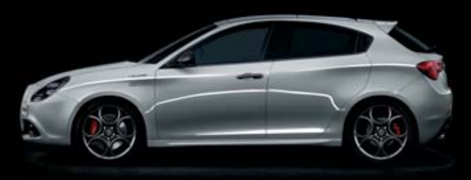
620 Silverstone Grey