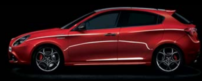
361 Competizione Red