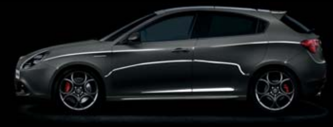
409 Lipari Grey