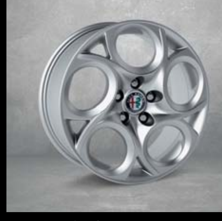
5YN 17" five-hole alloy rims with 225/45 tyres