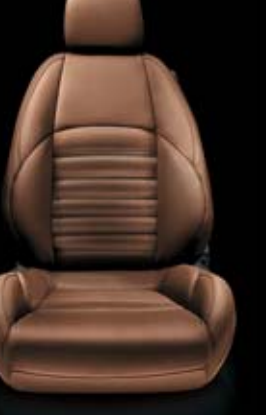
Leather 465 Tobacco (opt)