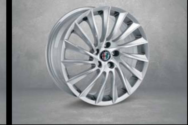
435 18" turbine alloy rims with 225/40 tyres