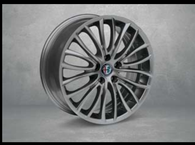
73Z 18" burnished alloy rims spoke with 225/45* tyres

439 18" five-hole alloy rims with 225/40 tyres