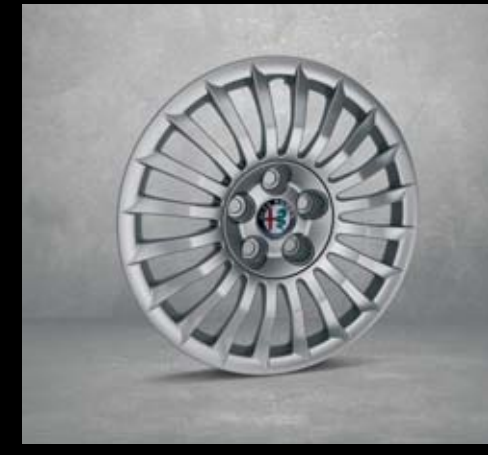
404 16" steel rims with 205/55 tyres