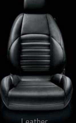
Leather 408 Black (opt)