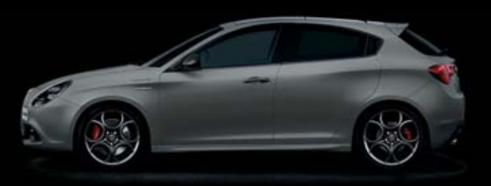
529 Magnesio Grey