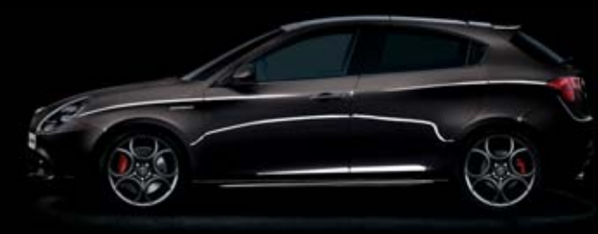
805 Etna Black