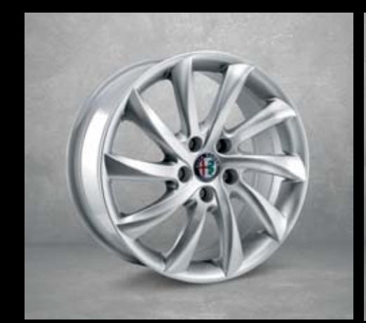
420 17" turbine alloy rims with 225/45 tyres