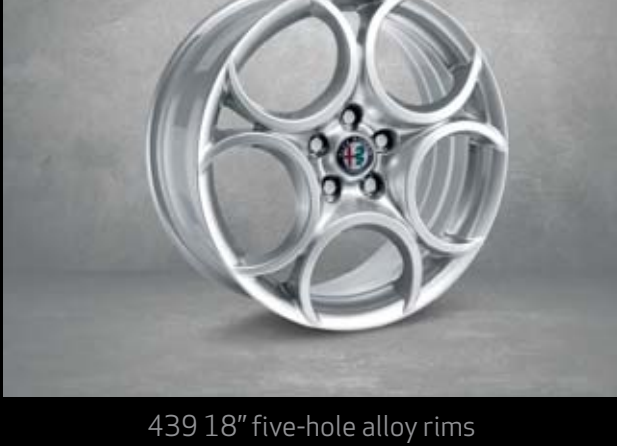
439 18" five-hole alloy rims with 225/40 tyres