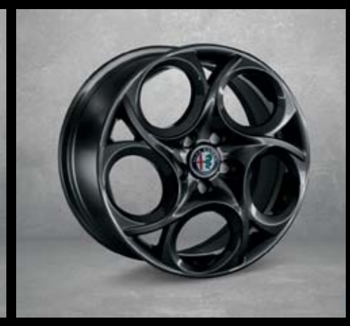
6Y8 17" black alloy rims 5-holes with 225/45* tyres