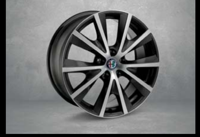
7HP 18" spoke chrome/burnished alloy rims with 225/40 tyres