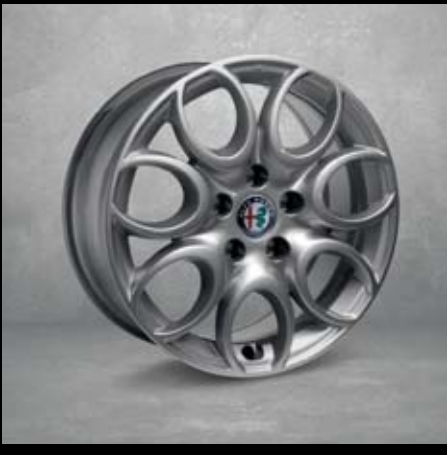
74A 16" seven-hole alloy rims with 205/55 tyres