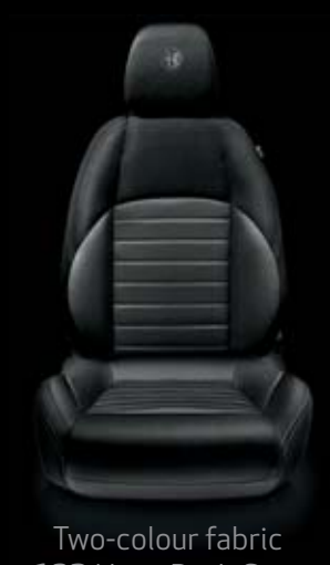
Two-colour fabric 123 Nero-Dark Grey (standard)