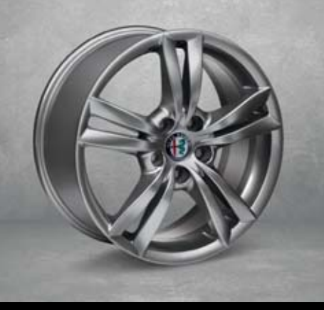
421 17" dual-spoke burnished alloy rims with 225/45 tyres