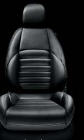
Leather 402 Black (opt)