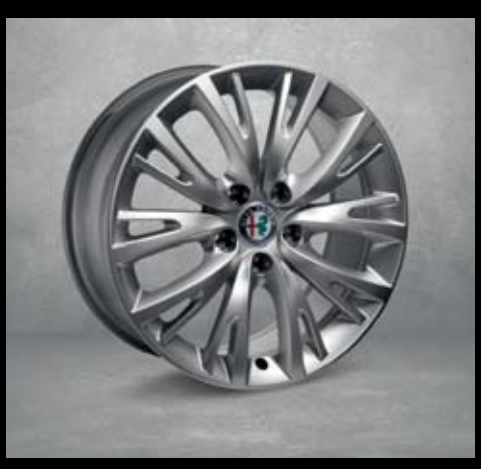
74B 17" spoke alloy rims with 225/45 tyres