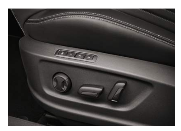
ELECTRICALLY ADJUSTABLE FRONT SEATS WITH MEMORY FUNCTION