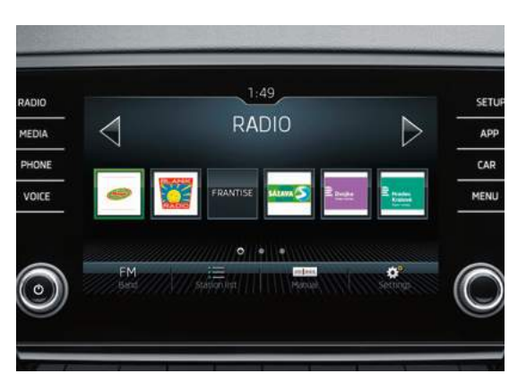
BOLERO RADIO WITH 8" TOUCHSCREEN DISPLAY