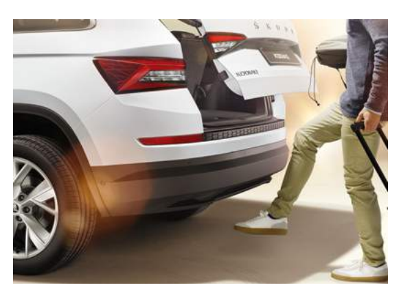
ELECTRICALLY OPERATED BOOT AS STANDARD, WITH OPTIONAL KICK ACTIVATION (VIRTUAL PEDAL)