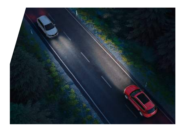
LIGHT ASSIST WITH HIGH BEAM CONTROL

To showcase the best features the KODIAQ has to offer, the Edition features an extensive range of connected and assist systems fit for any adventure.