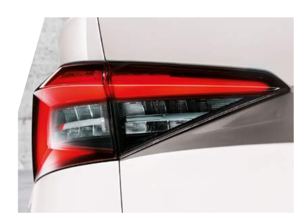
REAR LED LIGHTS (HIGH FUNCTIONALITY)

With an impressive amount of standard equipment, the KODIAQ SE L is the perfect blend of practicality and specification.