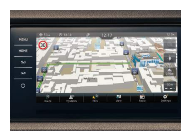
COLUMBUS SATELLITE NAVIGATION WITH 9.2" TOUCHSCREEN DISPLAY AND INTEGRATED WI-FI