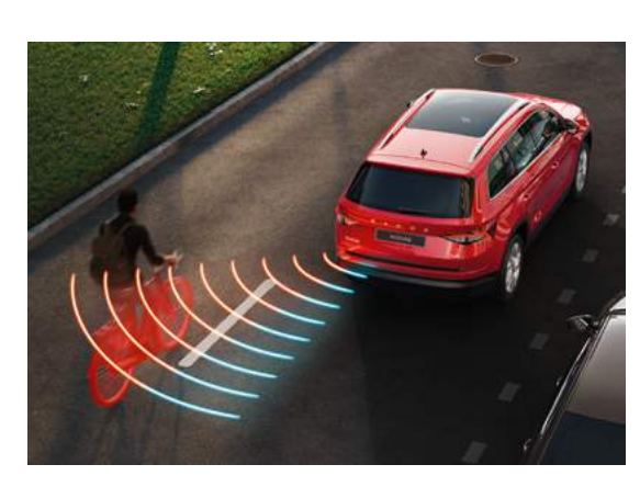
BLIND SPOT DETECTION