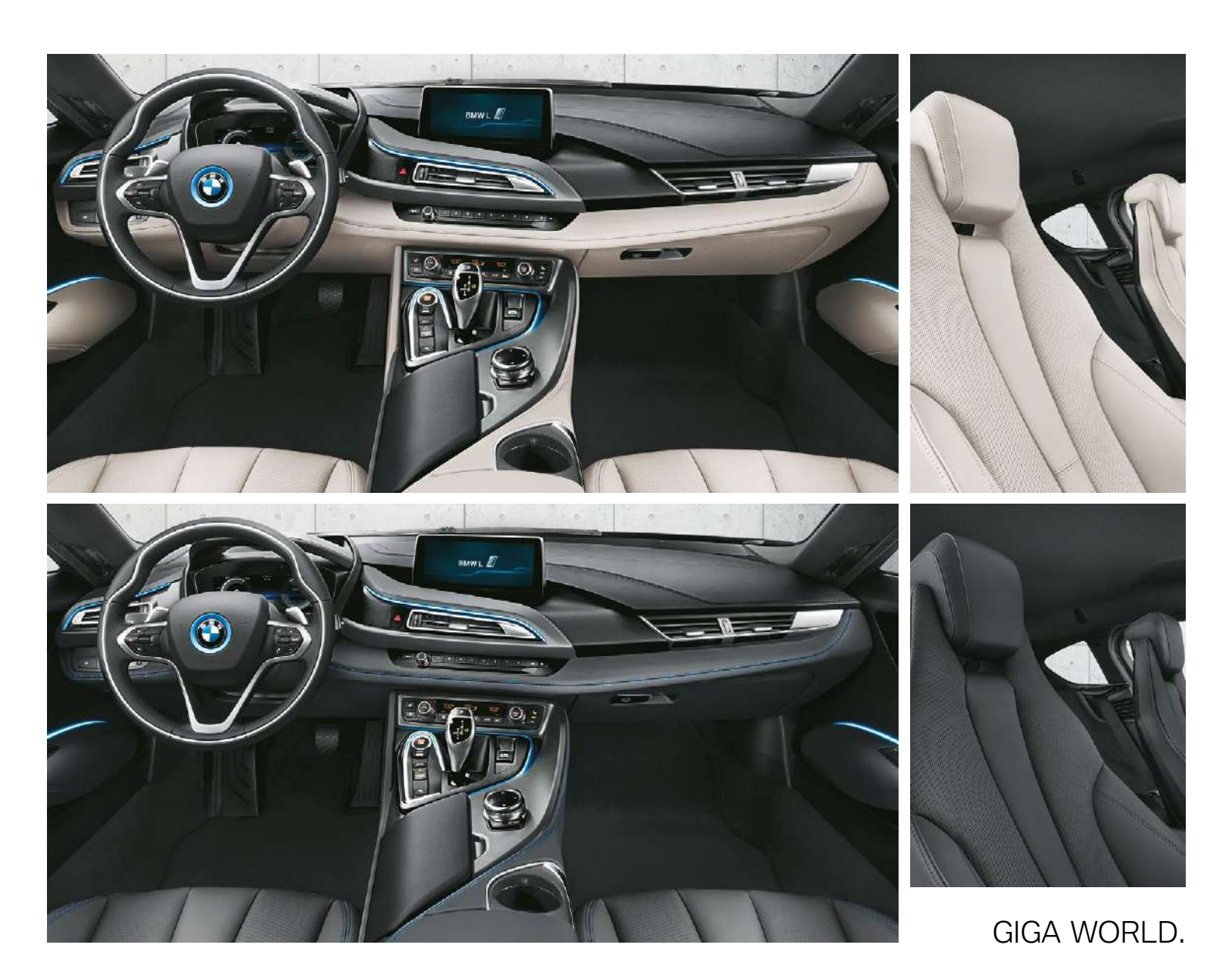
The interior is filled with Giga Ivory White or Giga Amido Black Full Perforated Leather, and velour floormats.