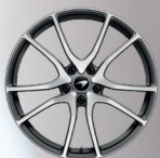
Diamond cut finish