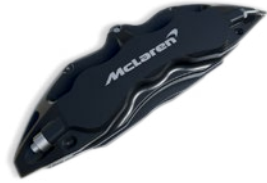
Black with silver McLaren logo