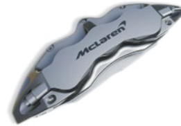
Silver with black McLaren logo