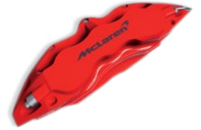
Red with black McLaren logo