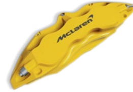
Yellow with black McLaren logo