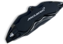
Liquid Black with silver McLaren logo