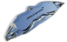
Polished with black McLaren logo