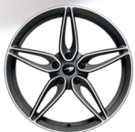
Diamond cut finish

Lightweight 10-Spoke forged alloy wheels