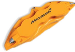
McLaren Orange with black McLaren logo