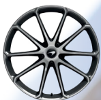
Diamond cut finish

Super-Lightweight 10-Spoke forged alloy wheels