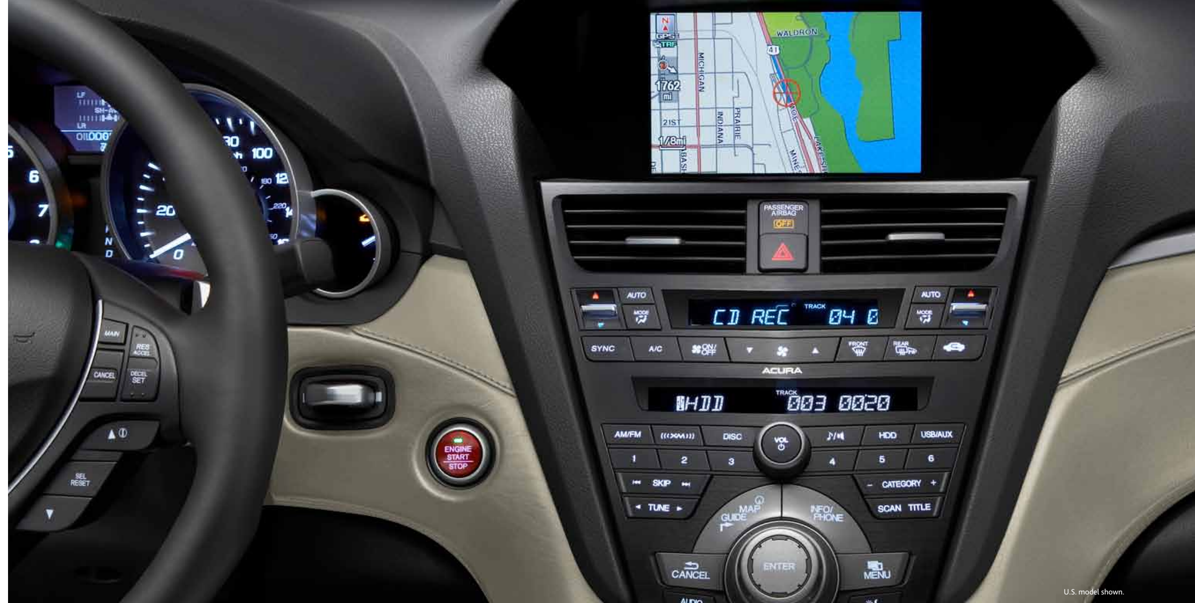
U.S. model shown.