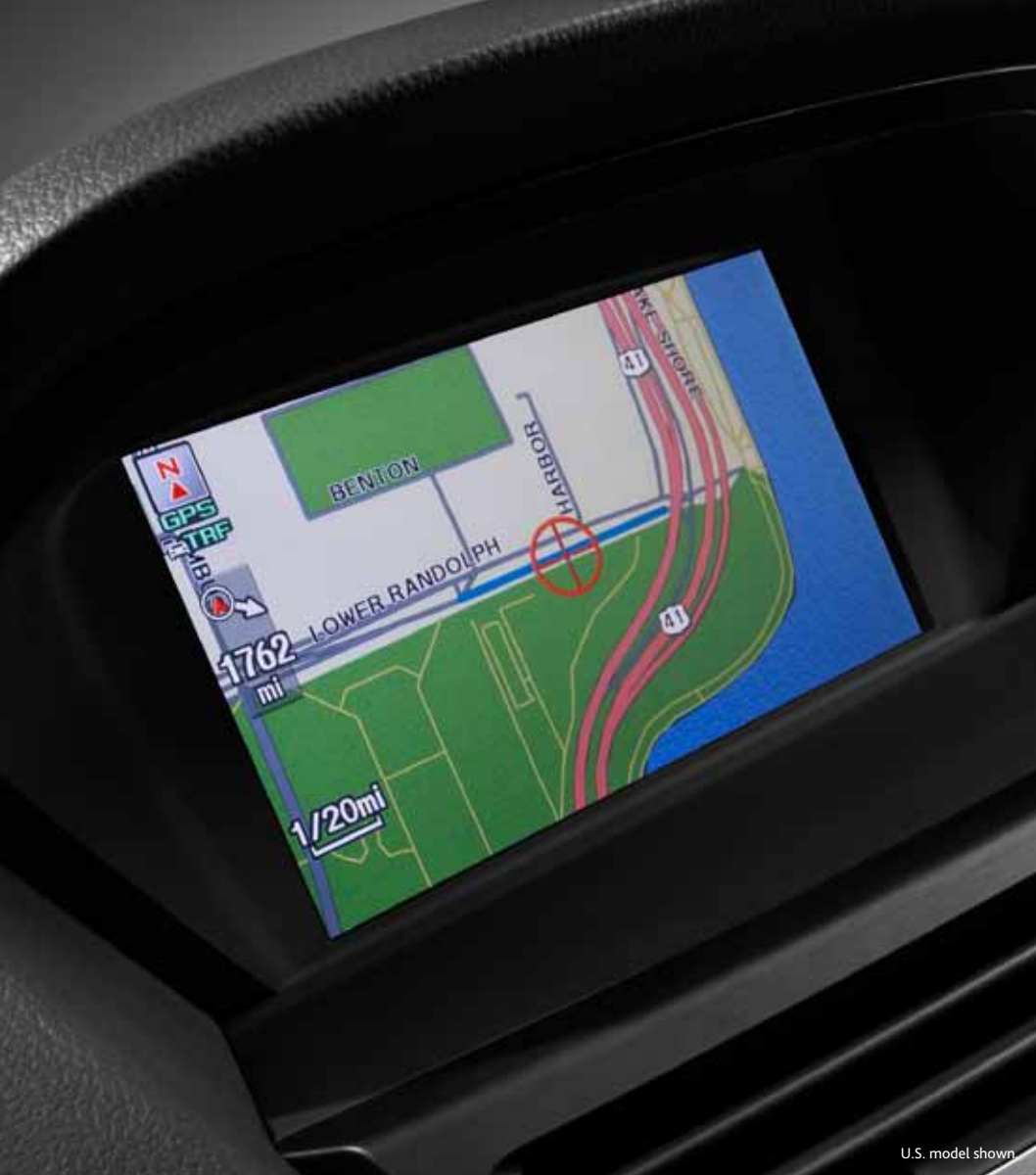
U.S. model shown.