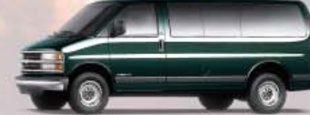
FOREST GREEN METALLIC