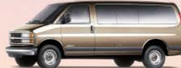
LIGHT AUTUMNWOOD METALLIC