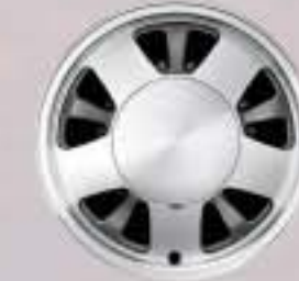
< CAST-ALUMINUM WHEEL Optional for G1500 Chevy Express Models. Size: 15" x 6"