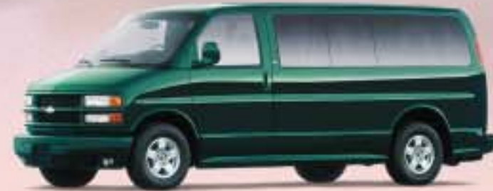
FOREST GREEN METALLIC

THE GM CARD® — What Are You Charging Toward?™ The GM Card rewards you 5% on every credit card purchase, making it the fastest way to save toward the GM car or truck of your dreams. For information or to apply for the GM Card, call 1-800-8GM-CARD or visit our web site at www.gmcard.com