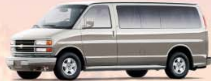
LIGHT PEWTER METALLIC