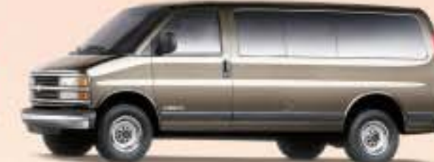
MEDIUM BRONZEMIST METALLIC