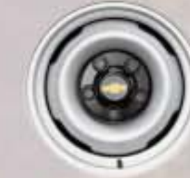
< ARGENT-PAINTED STEEL WHEEL Includes black center cap. Standard. Sizes: 15" x 6" (G1500, shown) and 16" x 6.5" (G2500 and G3500).