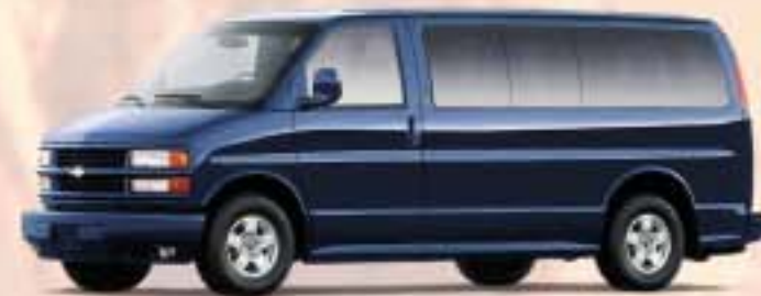
INDIGO BLUE METALLIC