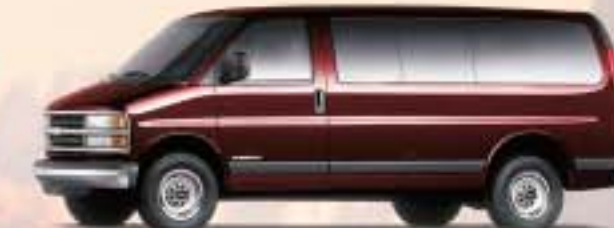
DARK CARMINE METALLIC