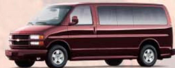
DARK CARMINE RED METALLIC