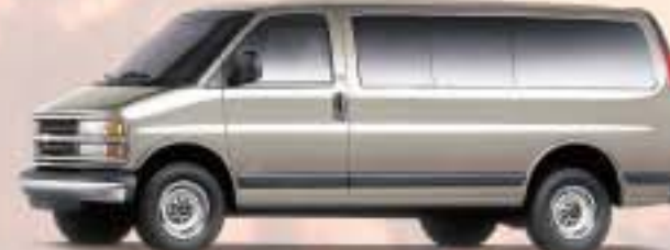
LIGHT PEWTER METALLIC