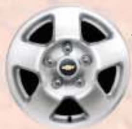
< BRUSHED-ALUMINUM WHEEL