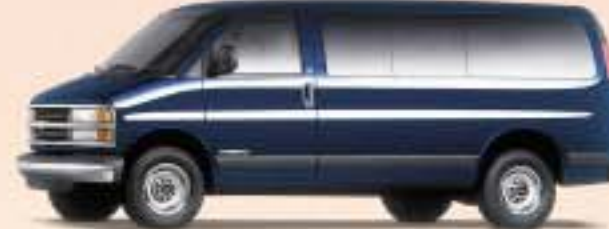
INDIGO BLUE METALLIC