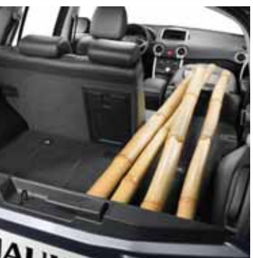
Features and images may vary and be optional depending on model, and are subject to change without notice.