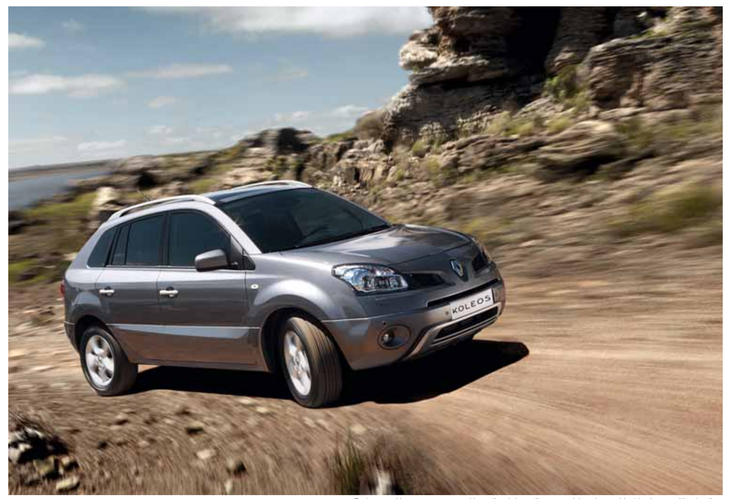
Features and images may vary and be optional depending on model, and are subject to change without notice.