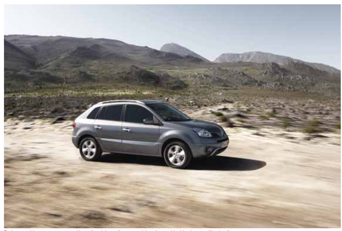
Features and images may vary and be optional depending on model, and are subject to change without notice.

Steep slopes don't stop Koleos. The automatic Hill-Start Assist function (HSA) ensures smooth pullaways every time, with no slipping back and with no need to use the parking brake. Similarly, Koleos' Hill Descent Control function (HDC) allows you to stay fully focused on the job in hand when driving down steep or slippery inclines.