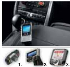
BLUETOOTH CAR KITS Hands-free wireless kit. Compatible with most Bluetooth telephones on the market. 1.CK3000 Evolution 2.CK3100 LCD 3.CK3200 LS