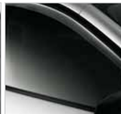
SMASH & GRAB WINDOW FILM The thickness and characteristics of the safety film increase the windows' resistance to impacts: protection against car-jacking.