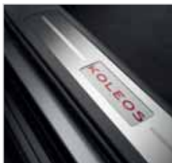
ILLUMINATED KICKING PLATES Aluminium, Koleos branded. Protects the door sill plate.