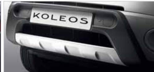
KOLEOS FRONT GUARD The guards really catch the eye, emphasising the attractive 4x4 look of the Koleos. Perfectly integrated, they provide excellent protection against scratches and daily urban bumps.