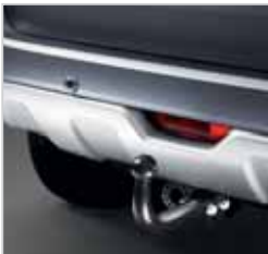
SWAN NECK TOW BAR The ball can be removed using tools to preserve the aesthetics of your Koleos.