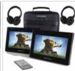
NEXTBASE PORTABLE DVD SYSTEM Rear seat in-car DVD system. Portable dual screen DVD with headphones. Plays DVD, CD, MP3 and games.