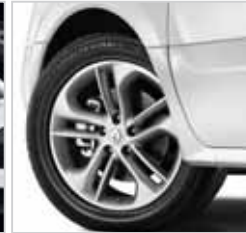
18" KOLEOS ALLOY WHEELS Stylish, Renault branded Magnesium alloy lightweight rims.