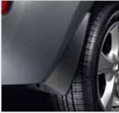
MUD GUARDS Protect the bottom of the car body from mud splashes or chipping. Black PVC.