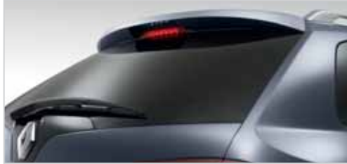
REAR SPOILER With antenna adaptor. Aerodynamic rear spoiler. Compatible with body kits.