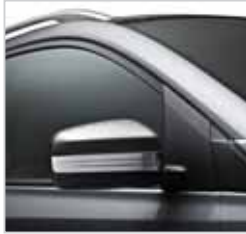
DOOR MIRROR CAPS Top-of-the-range mirror caps to add a touch of class to your Koleos.