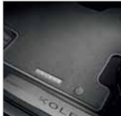
CARPET MATS Colour matches the original colour scheme. Comfortable, waterproof and washable.