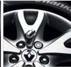
ANTI-THEFT WHEEL NUTS Protect your wheels against theft by fitting the Renault anti-theft nuts. They can only be removed with a special tool supplied.