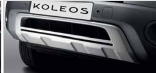
KOLEOS FRONT SKID The skids give the Koleos an extremely sporty, dynamic and elegant appearance. Your crossover becomes a sporting SUV strengthening the vehicle's personality.