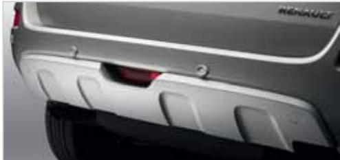
KOLEOS REAR GUARD The guards really catch the eye, emphasising the attractive 4x4 look of the Koleos. Perfectly integrated, they provide excellent protection against scratches and daily urban bumps.