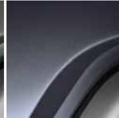
Lava Grey* - WXA