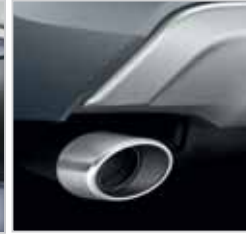
EXHAUST OUTLET Rectangular shaped to enhance the sporty character of the Koleos.