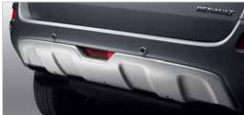
KOLEOS REAR SKID The skids give the Koleos an extremely sporty, dynamic and elegant appearance. Your crossover becomes a sporting SUV strengthening the vehicle's personality.