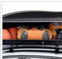
TOURING LINE 480 ROOF BOX 480-litre, metallic black Touring Line roof box can carry a load of up to 75 kg. It is fitted with a quick-install system and can be opened from both sides.