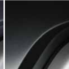
Metallic Black* - GXA