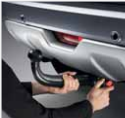
AUTOMATIC QUICK RELEASE TOW BAR Ball removable without tools in only a few seconds. Designed for intensive use. Maintains the aesthetics of the vehicle once the ball is removed.