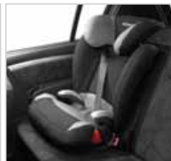
KID PLUS CHILD SEAT For children from 4 to 10 years. Weight 6.8kg