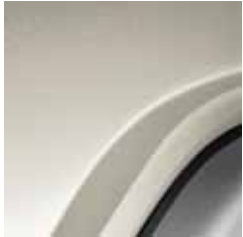
Pearl White* - QXA

Note: Printing limitations do not permit the subtle paint shades to be shown with complete accuracy. * Special effect metallic finish optional.