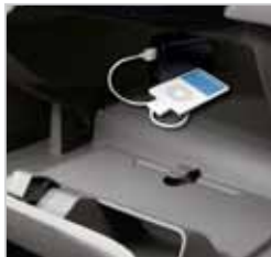
i-POD CONNECTION Connects your i-Pod to the car radio and allows you to navigate through your songs using the steering wheel remote controls. Keeps your i-Pod charged. Not compatible with Cabasse & Carminat.