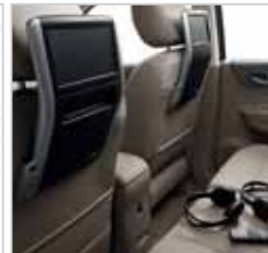
ON-BOARD VIDEO On-board video system, rear passengers enjoy the use of two 8 inch video screens, with two infrared headsets and a remote control. Fitted with an auxiliary input for a camcorder, games joystick, etc.