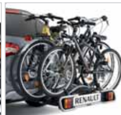
BICYCLE CARRIER ON TOW BAR Can carry up to 3 bikes. Can be tilted to allow access to the boot. Double anti-theft device: on the bike and the bicycle carrier (Euroway).