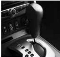
GEAR KNOB COVER Leather finished with carbon inlay gear knob cover for the ultimate luxury finish.