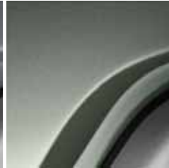
Mineral Beige* - HXA