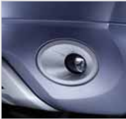
FOG LIGHT GARNISH - FRONT & REAR Improves driving safety & the aesthetics of the front & rear panels of the vehicle.