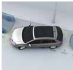
PARK DISTANCE CONTROL SENSORS Detects obstacles which could be impacted by the vehicle whilst reversing.