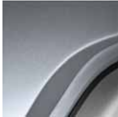
Ultra Silver* - KXC