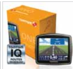
NAVIGATION SYSTEMS State-of-the-art GPS with South African programmed road maps.