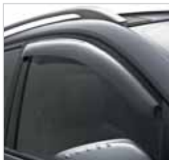
WIND DEFLECTORS Allows air in the passenger compartment to be regenerated. Smoked methacrylate.