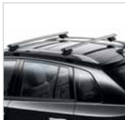
CROSS BARS ON LONGITUDINAL BARS Set of anti-theft bars. Silver grey aluminium finish. Pre-assembled bars.