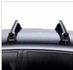
ALUMINIUM ROOF BARS Set of anti-theft bars. Silver grey aluminium finish. Pre-assembled bars.