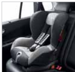
DUO PLUS ISOFIX CHILD SEAT For children between 9 months to 4 years. 5-point harness. "ISOFIX upper mounting" belt. Easy to install due to the Isofix hook locking system. Weight 9kg