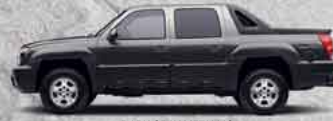
DARK GRAY METALLIC