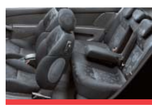
The Coupé VTS is unashamedly aimed at the driving enthusiast, one for whom every drive is far more than just a journey. It is a car that does not hide its style or performance aspirations.

Standard equipment over the Coupé VTR (above) includes two lateral airbags, body painted bumpers and side moulding, 15" alloy wheels, leather steering wheel, automatic front wipers with rain sensor, multifunction on-board trip computer, driver's seat lumbar adjustments, a rear central armrest and a boot floor cargo net.