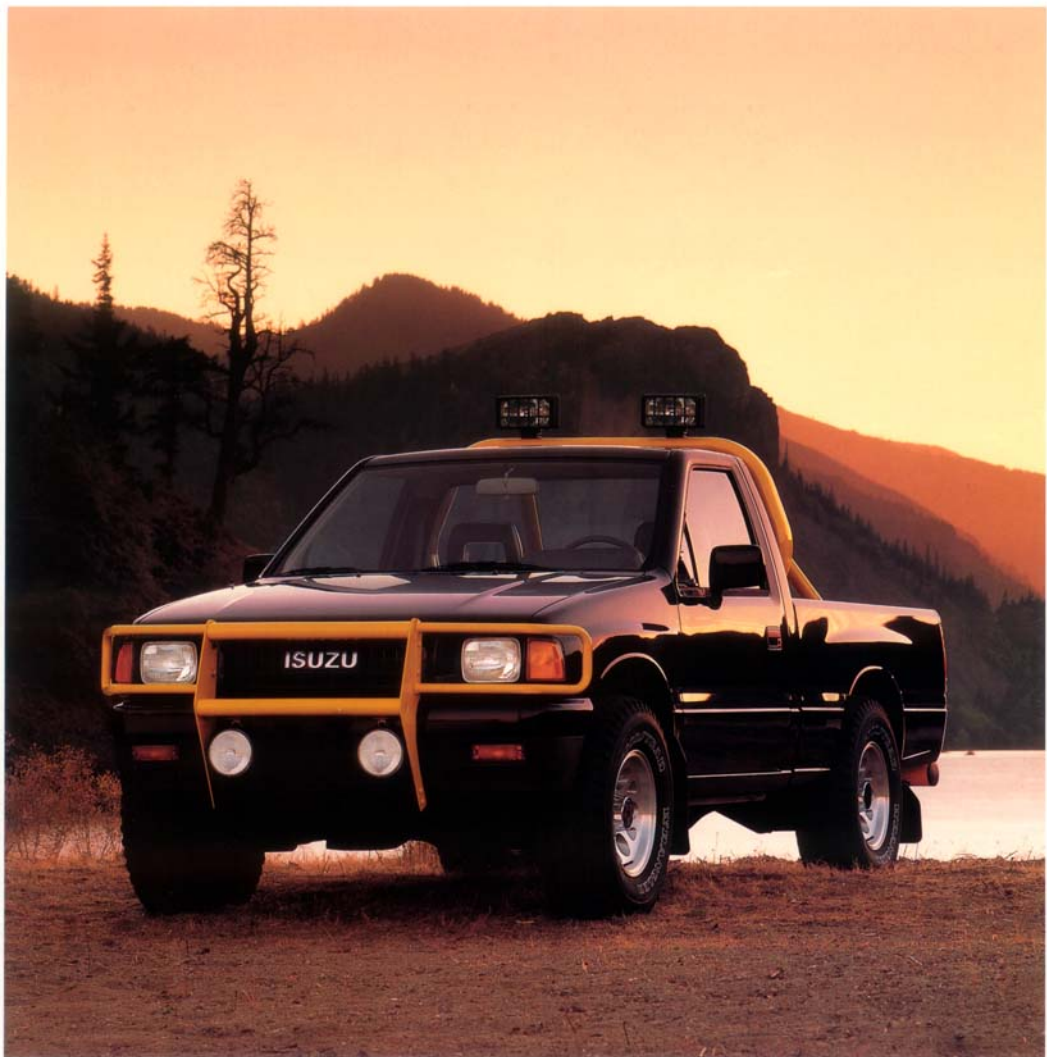
ISUZU 4x4 PICKUP — UNSURPASSED IN SATISFACTION.