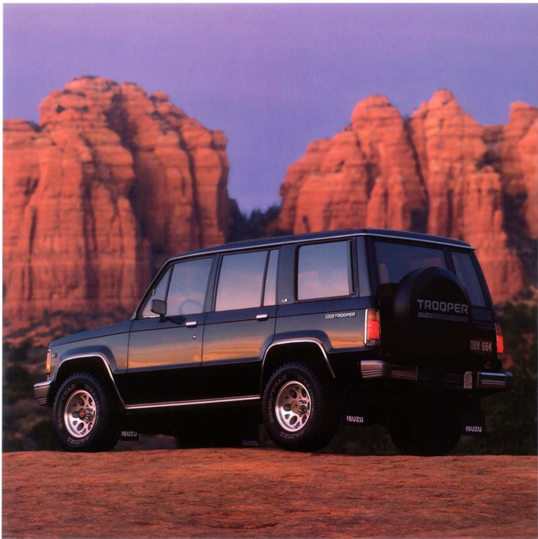
ISUZU TROOPER — "BEST BUY" IN ITS CLASS.