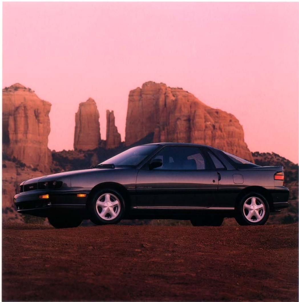
ISUZU IMPULSE XS — A TOTALLY NEW WAY TO FOLLOW YOUR IMPULSE.