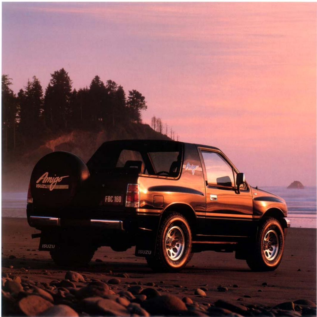
ISUZU AMIGO — THE NEW LOOK IN SPORT UTILITIES.