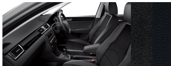
Black Alcantara and Simil Leather XC