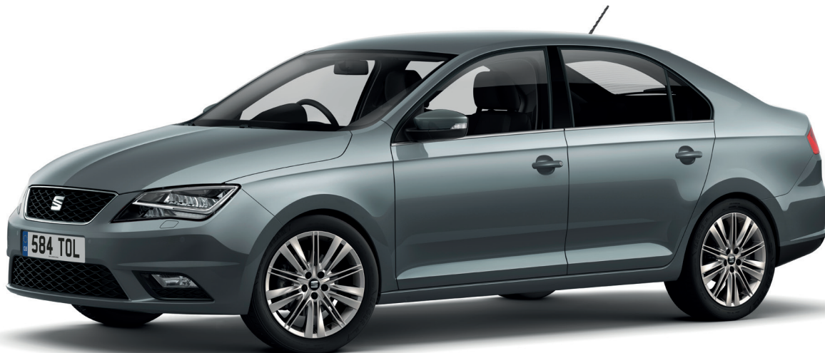
Model shown: Toledo XCELLENCE with optional Rhodium Grey metallic paint.