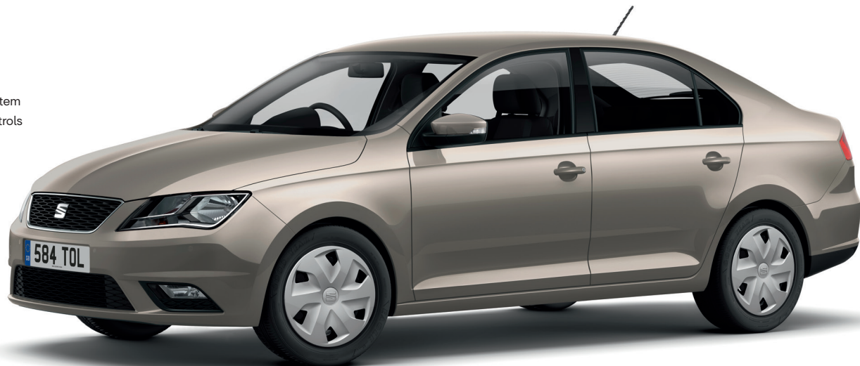
Model shown: Toledo SE with optional Cappuccino Beige metallic paint.