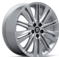
Dynamic 21/2 XC