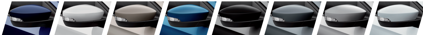
Mediterranean Blue* Bila White* SE XC