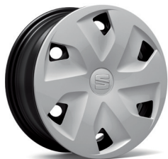
Urban 21/1 SE