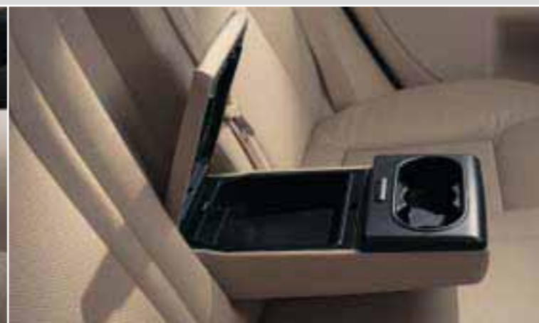
The folding rear seat centre armrest makes journeys more comfortable and incorporates a useful storage compartment.