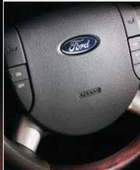
Durashift 5-tronic Optional Durashift 5-tronic transmission now features steering wheel-mounted controls for fingertip gearshift control. In addition, all Ford Mondeos now come equipped with cruise control as standard, to help reduce stress and fatigue, particularly on long motorway journeys.