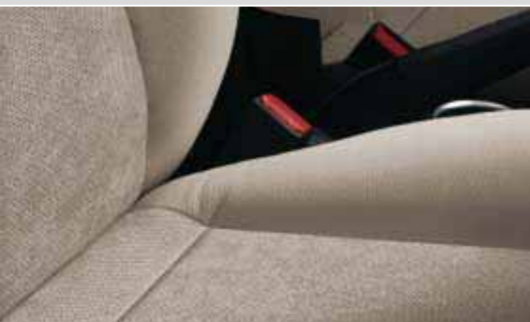
Alcantara seat trim Luxurious new Alcantara seat trim adds to the Ford Mondeo's comfortable interior (available as a no cost option on Ghia X).