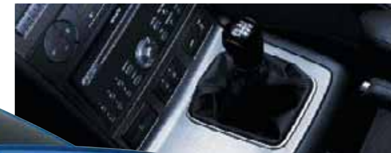
Positive control Leather-wrapped gearshift knob with short-throw gearshift action.