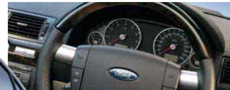
Elegant control The Ghia X's interior is rounded off by an exclusive steering wheel with an ergonomically designed wood and leather rim.

Model shown is finished in Panther Black metallic paint (optional, at extra cost).