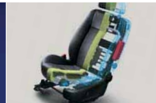
Seat engineering Mondeo's seats have comfort and safety built-in. All seats have anti-submarining bases as standard, while the front seats incorporate side thorax airbags and anti-whiplash head restraints.