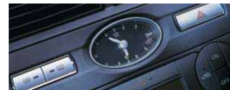
Style and function New bright metal-finished switches look good and feel pleasant to the touch.

Model shown is finished in Deep Rosso Red metallic paint (optional, at extra cost).