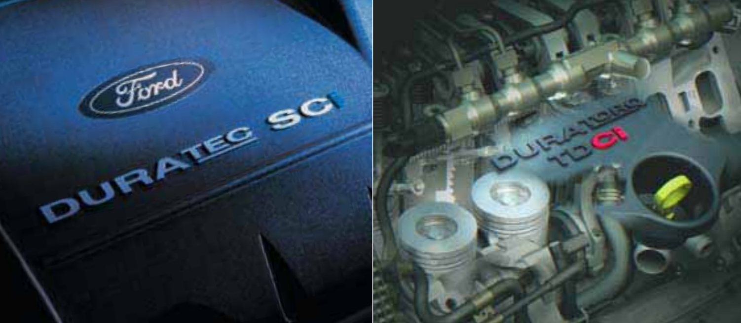
1.8 Duratec SCi (left) Featuring direct petrol injection, the 1.8-litre Duratec SCi petrol engine combines the low fuel consumption of a diesel with the responsive power of a petrol engine. (Not appropriate for occasional and low mileage urban driving.) Duratorq TDCi (right) The 2.0-litre Duratorq TDCi premium diesel engines use cutting-edge, common-rail technology for a more powerful and refined driving experience. Complying with European Stage IV emission standards, this has a financial benefit for the company-car driver as the 3% CO 2 diesel surcharge is not applicable. Stage III diesel and petrol engines (excluding SCi) do not have engine covers.