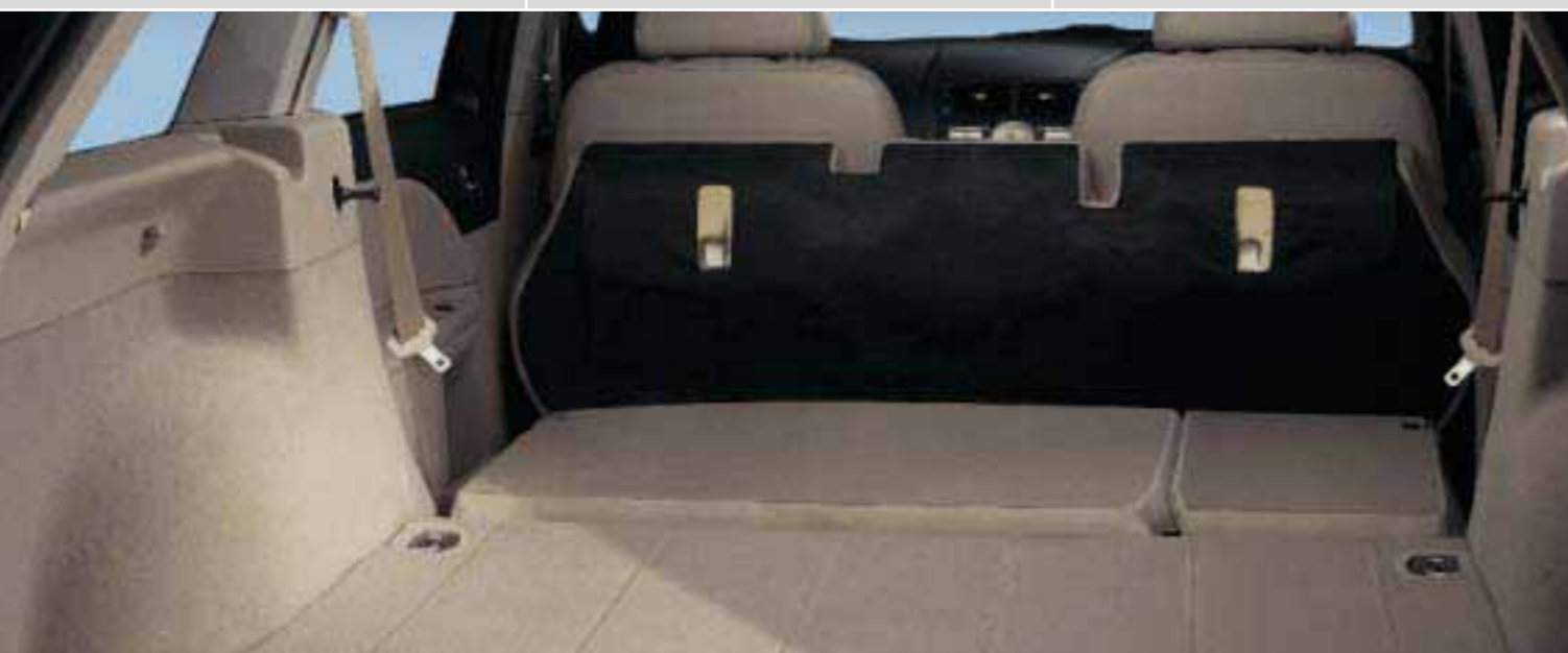
Flat load compartment New, fold-flat rear seats help to enhance the Ford Mondeo estate's flexible load-carrying ability.