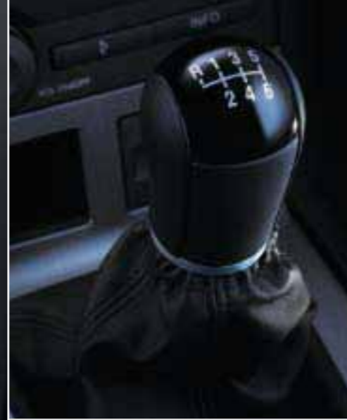
Durashift 6-speed manual transmission The new Durashift 6-speed transmission combines greater in-gear flexibility and top speed potential with enhanced fuel economy and refinement.