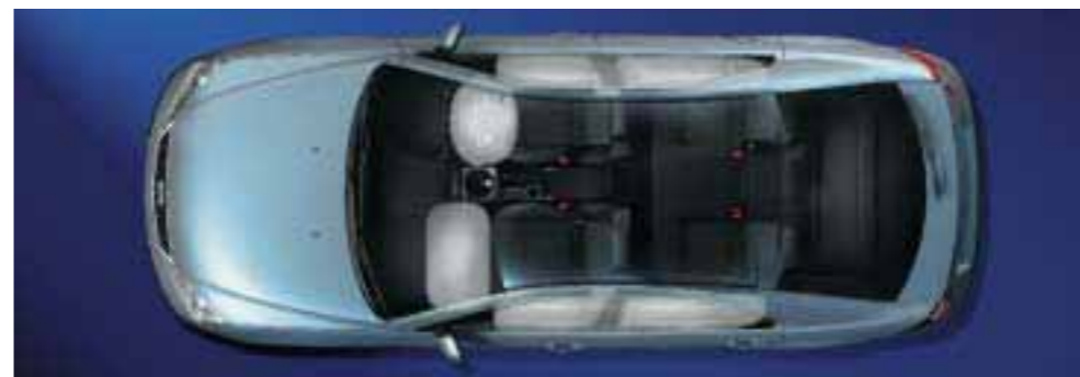
Advanced safety Offering a total of six airbags, you can rest assured that the Ford Mondeo's advanced Intelligent Protection System is comprehensively equipped to care for your welfare.

Dual-stage driver's and front passenger's airbags* are fitted as standard. So too are front seat side airbags, and side curtain airbags that descend from the headlining above the doors in a side impact, helping to protect those in the front and rear of the car.