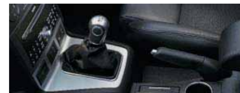
Comfort and control Partial leather seats and short-throw gearshift with purposeful chrome gear knob.

Model shown is finished in Machine Silver metallic paint.