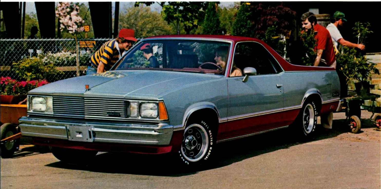
GMC Caballero Amarillo

Tires are supplied by various tire manufacturers.