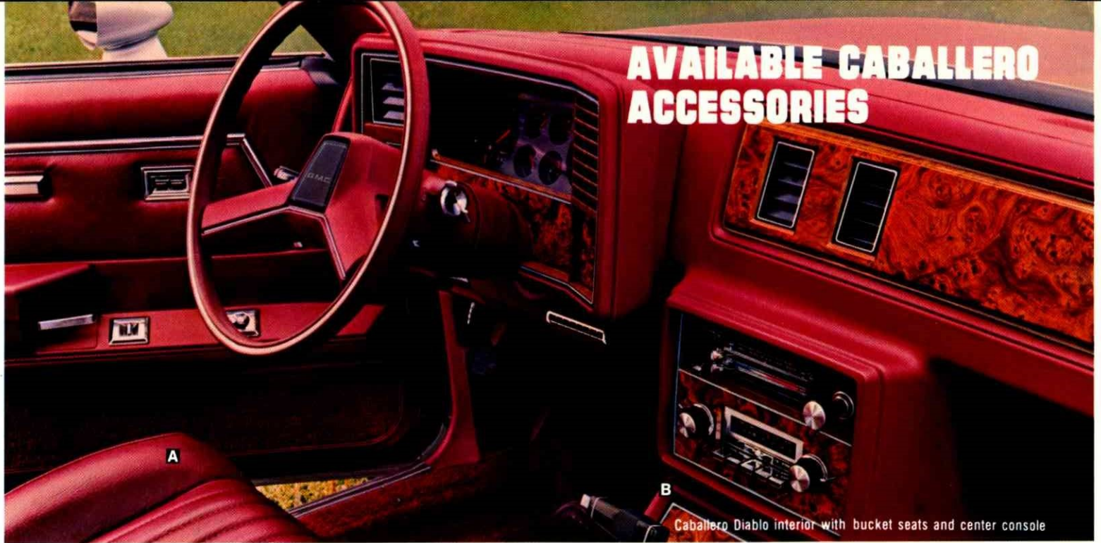
Caballero Diablo interior with bucket seats and center console

Pictured accessories: A Strato bucket seats available in cloth or vinyl. B Center console with gear shift lever. C Air conditioning. D Delco radios: AM, AM/FM, AM/FM stereo, AM/FM stereo with 8-track tape or cassette, AM/FM stereo with CB. Power antenna also available. E Comfortilt steering wheel. F Cruise control with new "resume" feature. G Power windows. H Power door locks. I Dual body-color sport mirrors; remote control available for both or driver's side only. J Body-color Rally wheels; also wire wheel covers (locks available) and styled sport wheel covers.