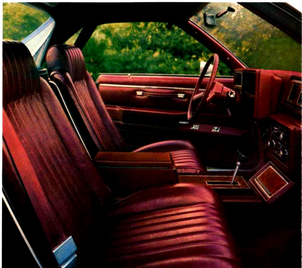
Available bucket seats with console option

New available 55/45 split bench seat , in the same color cloth or vinyl material as standard bench seat, includes an upholstered fold-down armrest at the split.