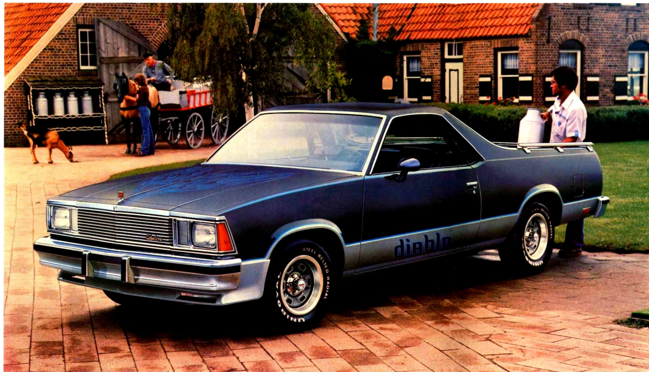
GMC Caballero Diablo for '81

Cover: Shown is GMC Caballero. Caballero and Caballero Amarillo are shown on Page 5 and Caballero Diablo on Pages 3 and 4.