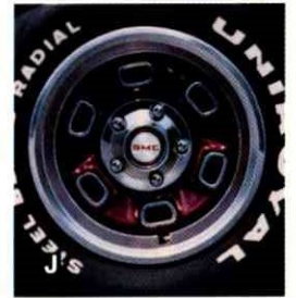
Tires are supplied by various manufacturers.