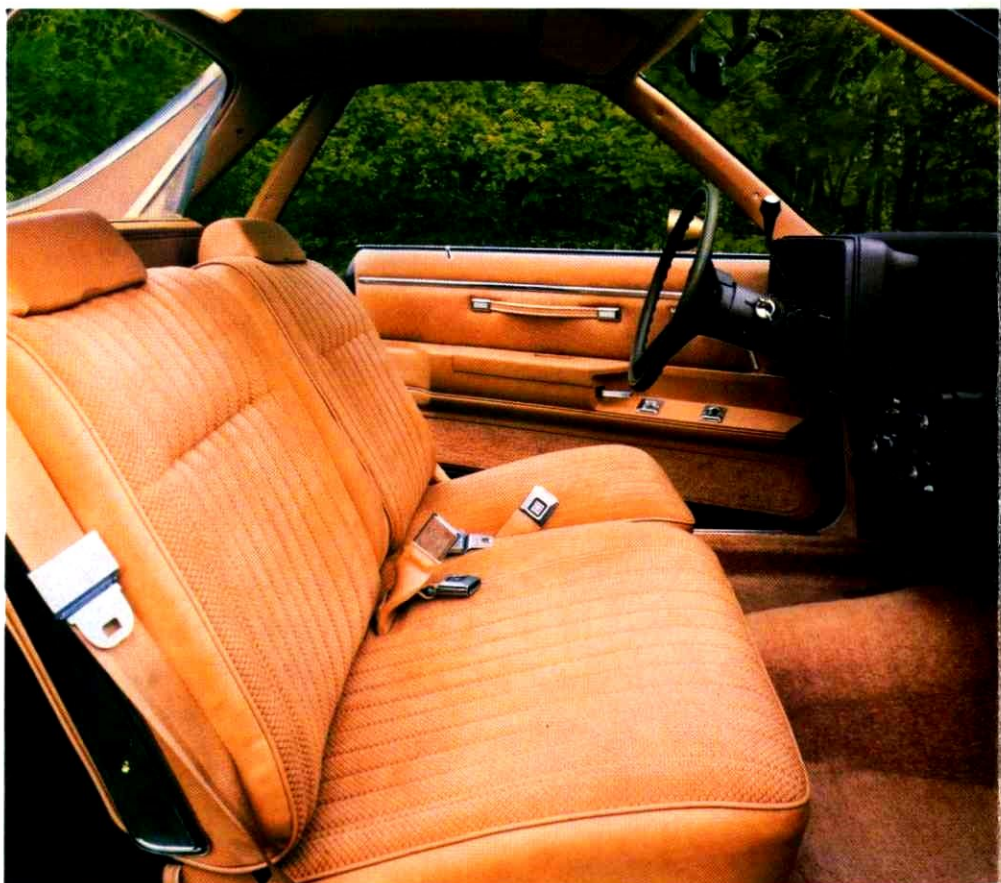
New available 55/45 split bench seat with folding armrest

The right is reserved to make changes at any time, without notice, in prices, colors, materials, equipment, specifications and models. Check with your GMC dealer for complete information.