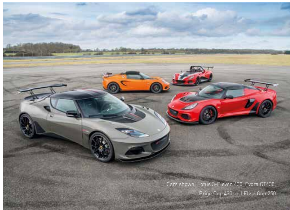
Cars shown: Lotus 3-Eleven 430, Evora GT430, Exige Cup 430 and Elise Cup 250

Today, the Lotus Lightweight Laboratory maintains Colin Chapman's legacy and ensures that his ethos is applied to every new model. After a complete strip down, every component is assessed and optimized through redesign, change of material, change of supplier or integration. If one part can be made to do the job of several, this is where it happens. Improvement is continuous. The quest to add lightness never ends. The result is the fastest, most exciting, most capable range of road cars Lotus has ever built.