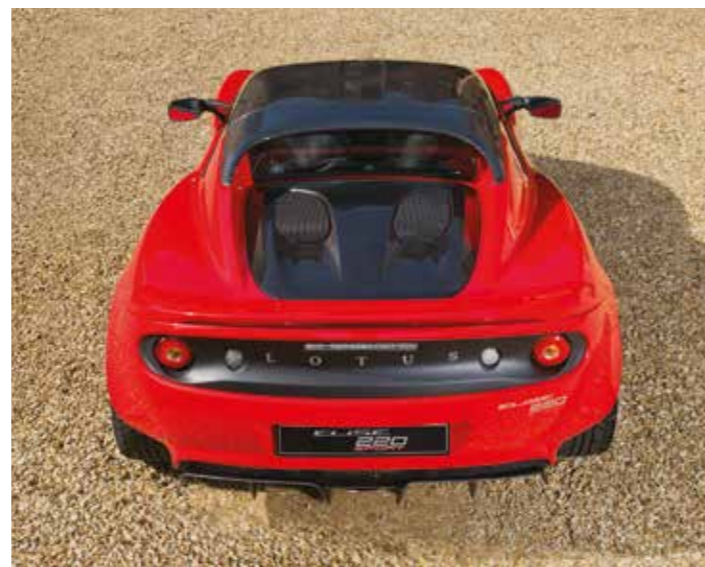
*Model shown features cost option black pack