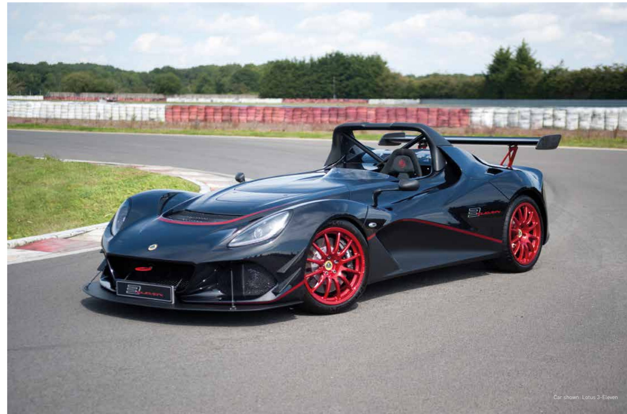
Car shown: Lotus 3-Eleven