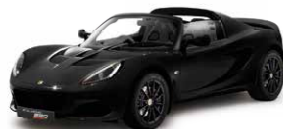
METALLIC BLACK C186