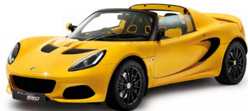
SOLID YELLOW C206