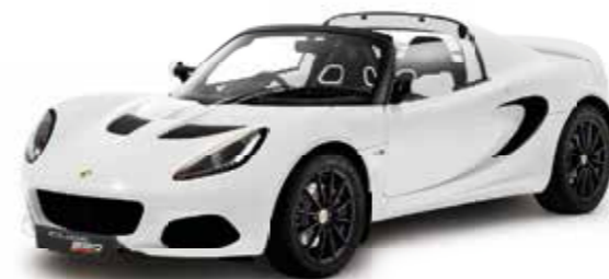
METALLIC WHITE C201