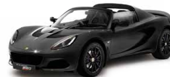
METALLIC DARK GREY C213