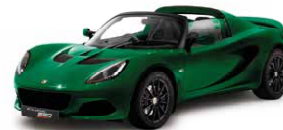
RACING GREEN C203