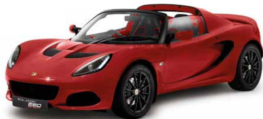
SOLID RED C183