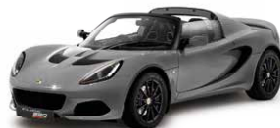
METALLIC GREY C185