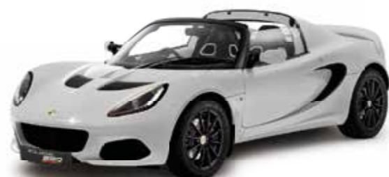
METALLIC SILVER C190