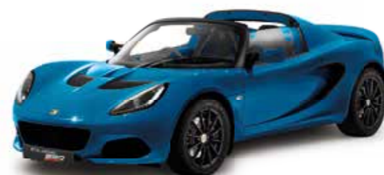
ELISE BLUE C214

Images are for comparison use only, please speak to your local dealer for physical print samples.