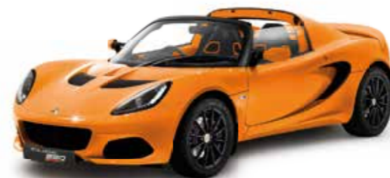
METALLIC ORANGE C205