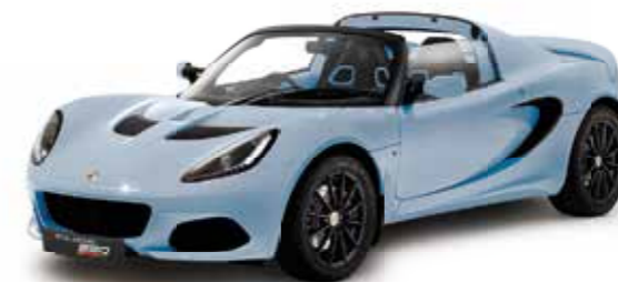
METALLIC LIGHT BLUE C208