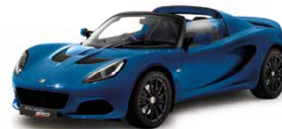
METALLIC BLUE C202