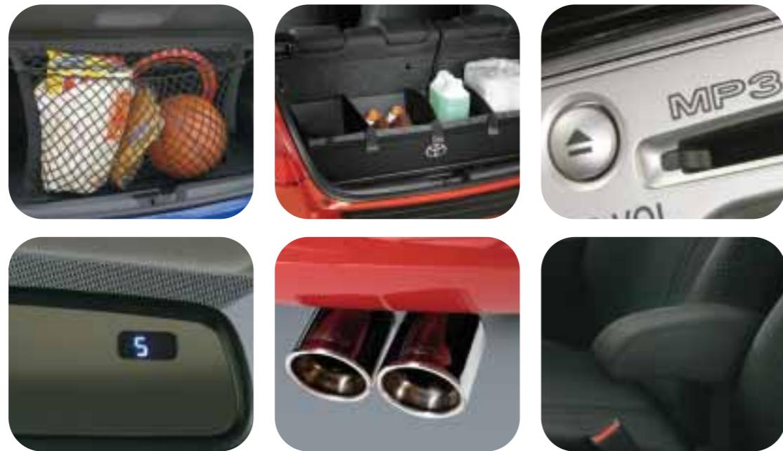
Yaris Hatchback accessories clockwise from top left: Cargo net, Cargo box, Audio systems, Electrochromic rear view mirror with digital compass, Performance exhaust and Front centre armrest. Facing page: Yaris is shown all dressed up with a performance exhaust, aluminum alloy wheels, side skirts, a rear spoiler, hood deflector, roof rack with accessories and side window visors.

Express yourself. Take your new Yaris Hatchback to a whole new level of self-expression by adding any of the Toyota Accessories custom-designed for your model. It's a great way to personalize your new vehicle and optimize its appearance at the same time. Ask your Toyota Dealer. To find the Toyota Dealer nearest you, go to toyota.ca or call 1-888-TOYOTA-8.