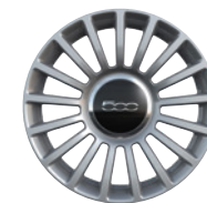
16-INCH ALUMINUM PAINTED TECH SILVER Standard* on Lounge and Lounge Cabrio