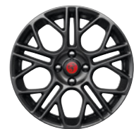
16-INCH HYPER BLACK PAINTED FORGED ALUMINUM Standard on 500 Abarth and 500c Abarth

* = Included. ○ = Optional. P = Available within Package noted. — = Not available.