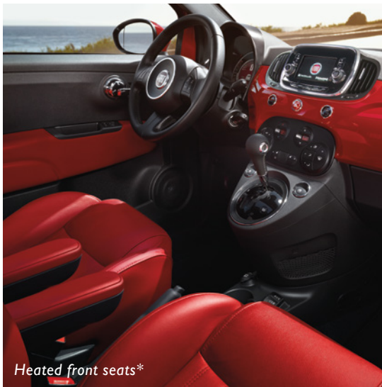
Heated front seats*