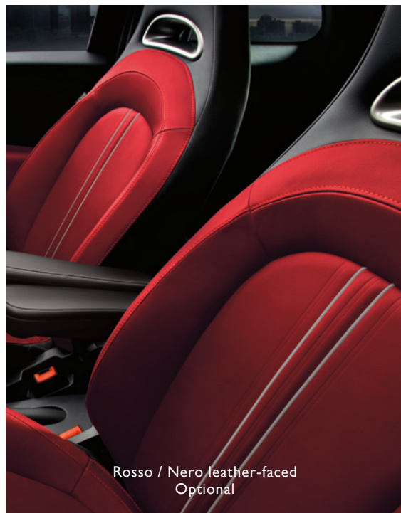
Rosso / Nero leather-faced Optional