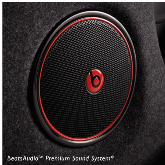
BeatsAudio™ Premium Sound System*