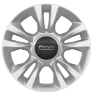
16-INCH BRIGHT FULLY PAINTED ALUMINUM Available on Lounge and Lounge Cabrio