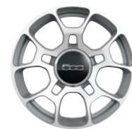
16-INCH POLISHED ALUMINUM WITH MINERAL GREY POCKETS Standard on Pop