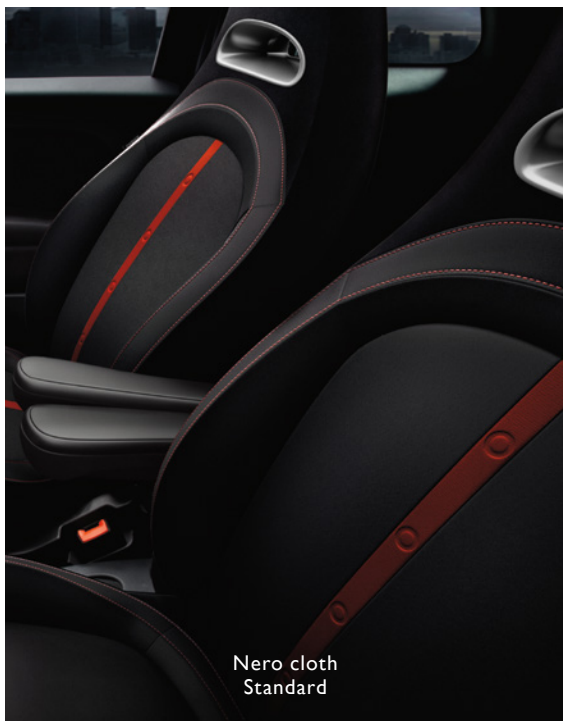
Nero cloth Standard