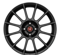
17-INCH HYPER BLACK FORGED ALUMINUM Available on 500 Abarth and 500c Abarth