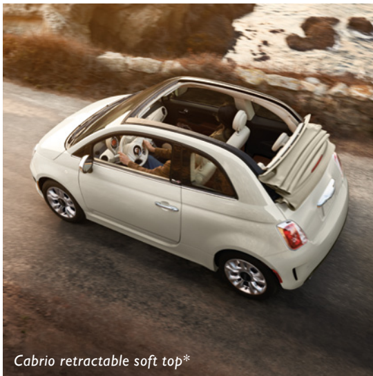
Cabrio retractable soft top*