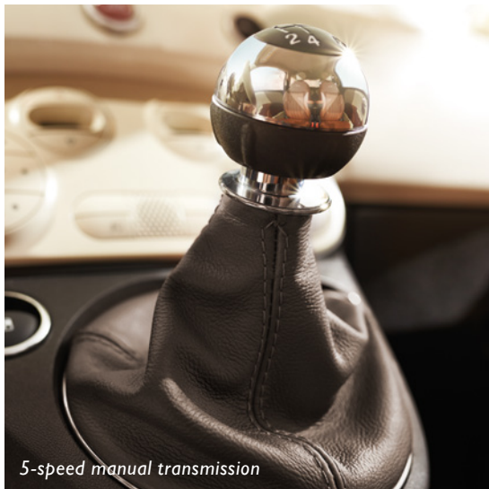
5-speed manual transmission