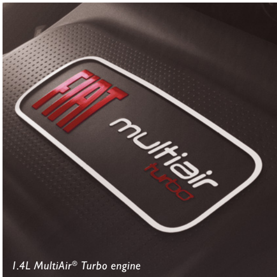
1.4L MultiAir® Turbo engine