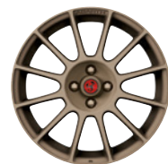
17-INCH BRONZE FORGED ALUMINUM Available on 500 Abarth and 500c Abarth