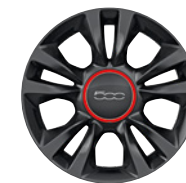
16-INCH HYPER BLACK ALUMINUM Available on Pop with Urbana Appearance Package, and Pop Cabrio Sport Package