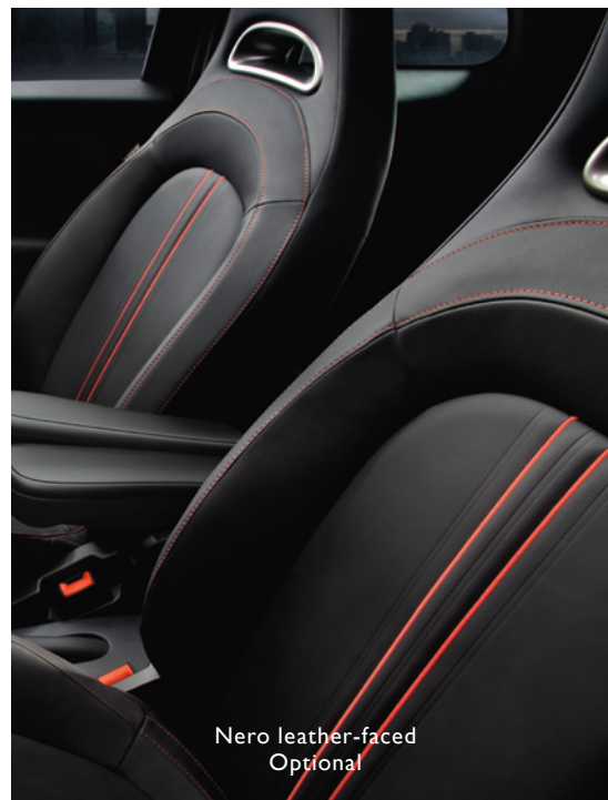
Nero leather-faced Optional