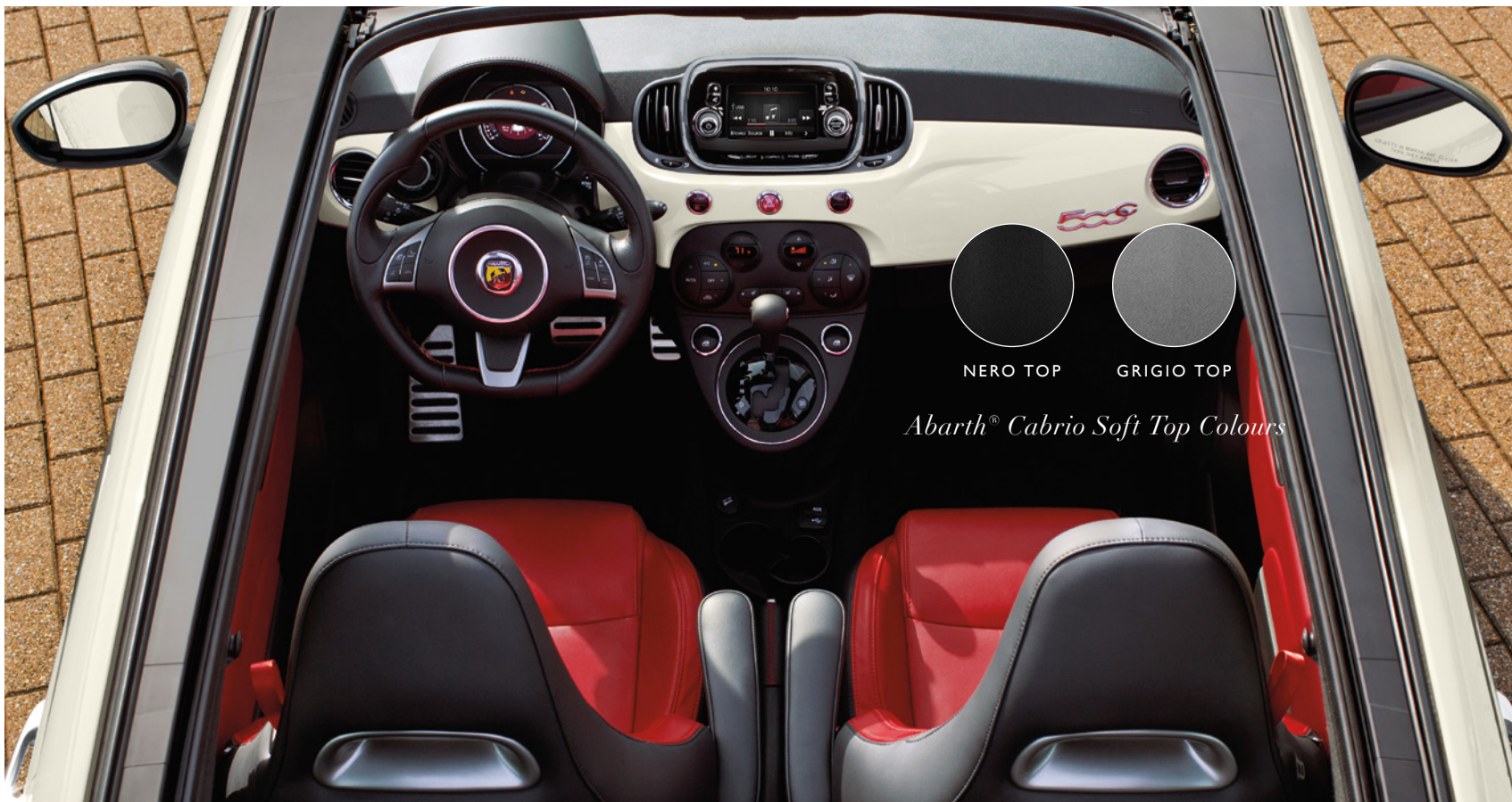
Abarth® Cabrio Soft Top Colours