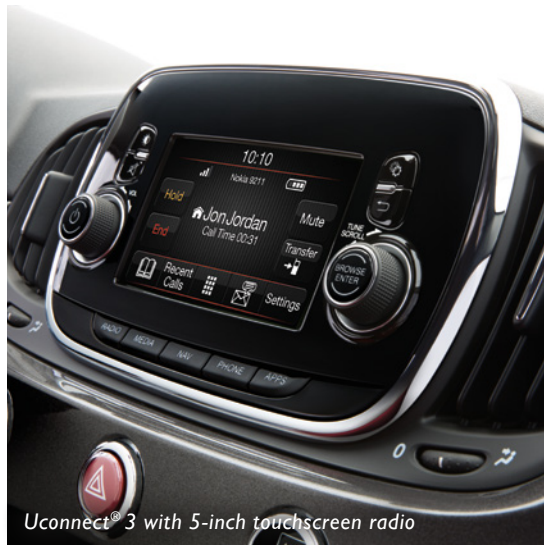
Uconnect® 3 with 5-inch touchscreen radio