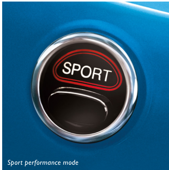
Sport performance mode