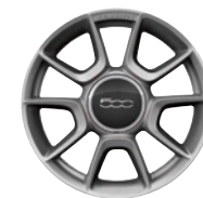
16-INCH ALUMINUM TECHNICAL GREY Available* on Pop and Pop Cabrio