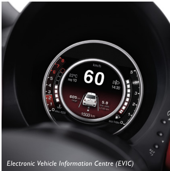
Electronic Vehicle Information Centre (EVIC)