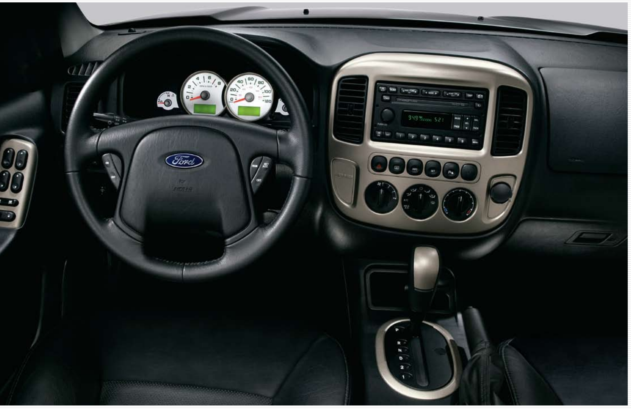
Escape Limited _ Ebony Black Interior available Limited Luxury Comfort Package

NEW Message Center — Escape Limited drivers can find out everything from average fuel economy to the fact that they've got a lamp out somewhere, just by glancing at this LCD display tucked into the bottom of the tachometer.