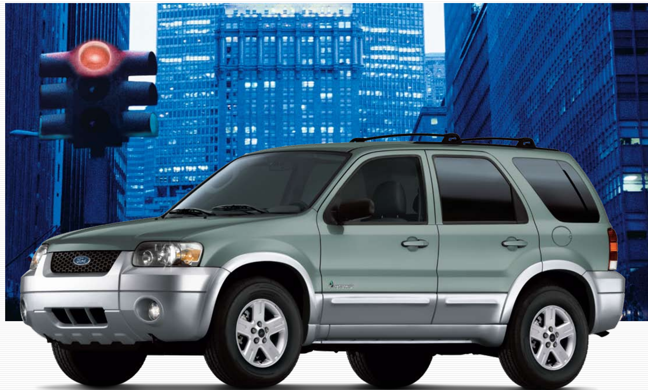
Escape Hybrid _ Titanium Green Metallic available Appearance Package See your local Ford Dealer or visit fordvehicles.com/escapehybrid for more information.