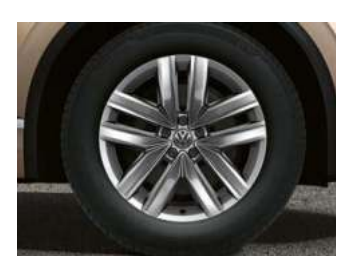
Esperance 19" alloy wheels (Standard on Luxury)