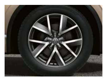
Braga 20" alloy wheels (Standard on Executive)