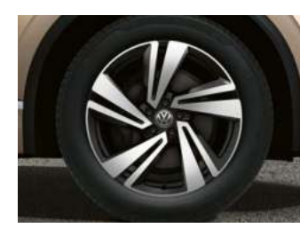
Nevada 20" alloy wheels (Optional on the Luxury model when the R-Line Package is seleceted)