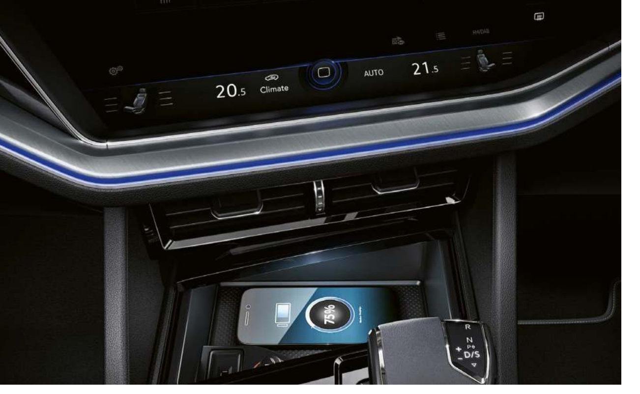
Ambient Lighting & Climate Control