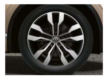
Suzuka 21" alloy wheels (Optional on Executive)