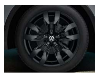
Black Suzuka 21" alloy wheels (Only with Black Style Package -Optional on Executive)