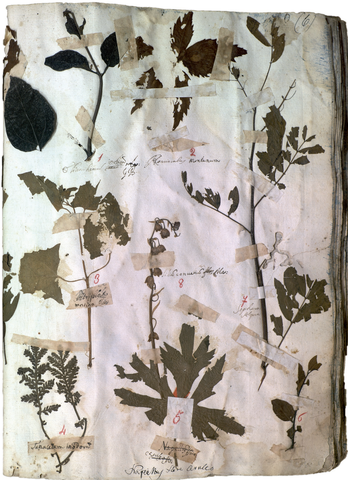
Fig. 3. – Sheet number 6 of the Cupani Herbarium.