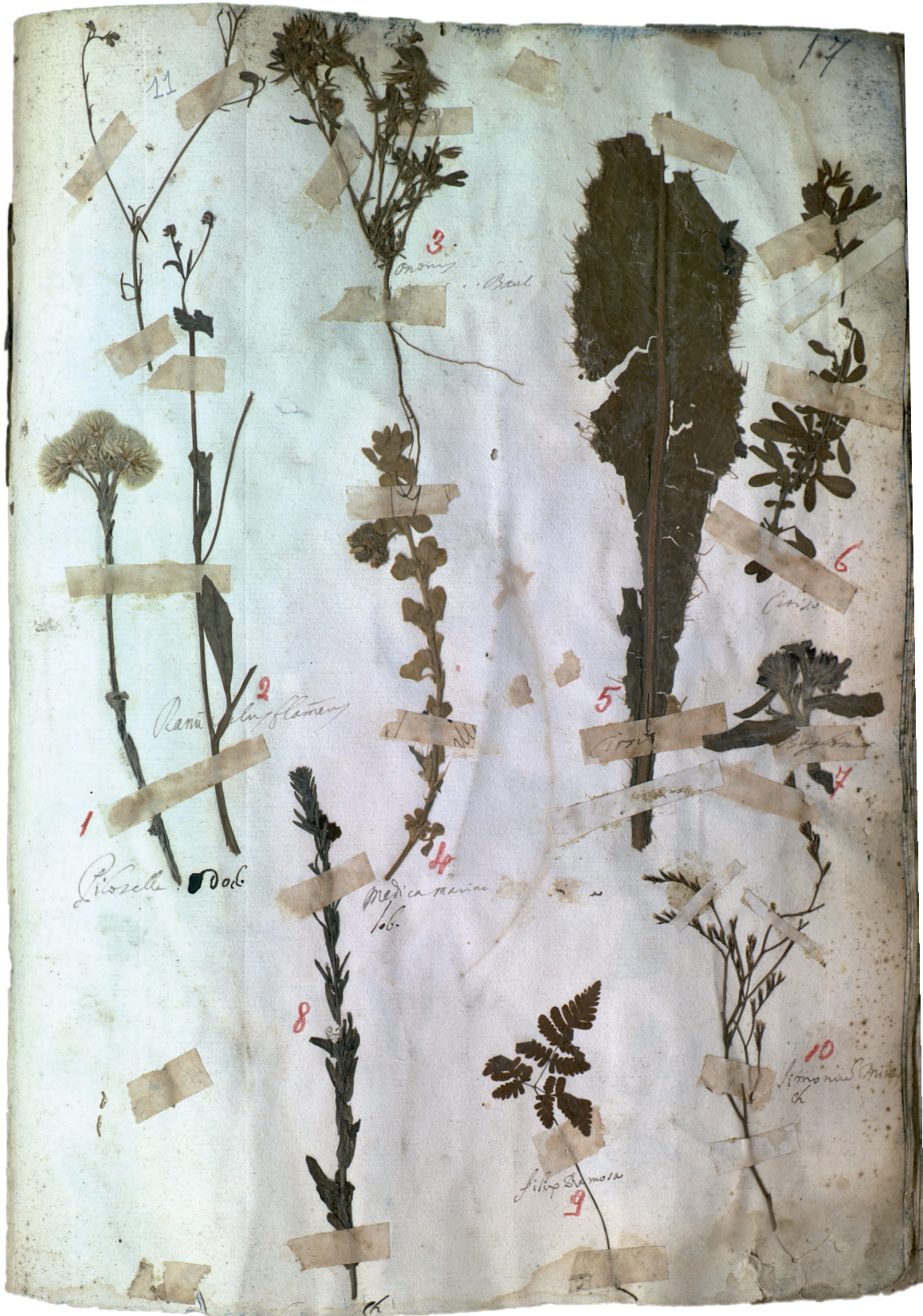
Fig. 6. – Sheet number 17 of the Cupani Herbarium.