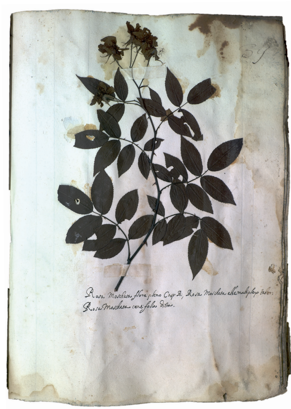
Fig. 5. – Sheet number 39 of the Cupani Herbarium containing one specimen of Rosa L. (Rosaceae).