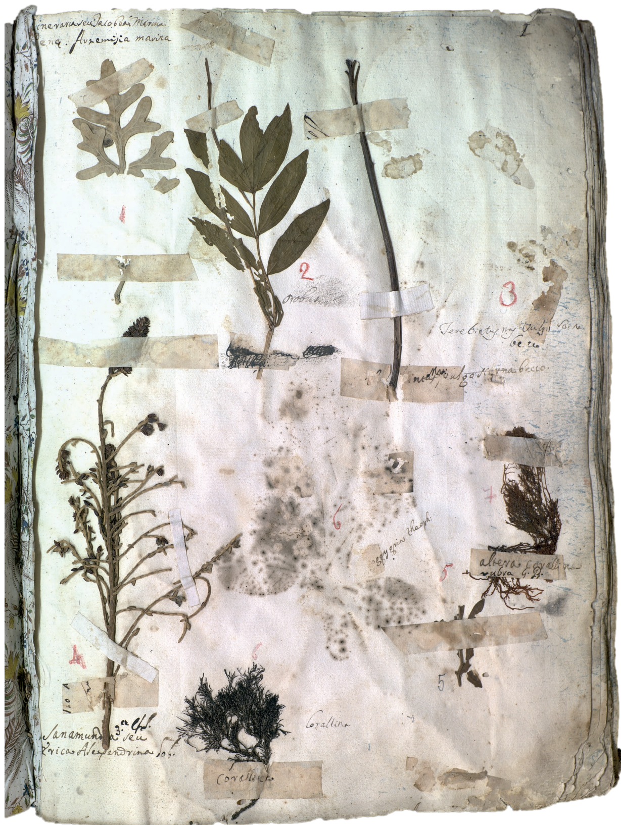
Fig. 7. – Sheet number 1 of the Cupani Herbarium.