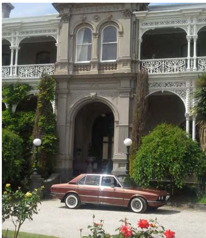
Top Marque 14