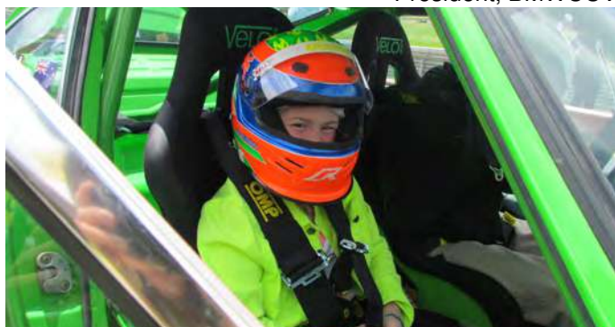
Top Marque 18