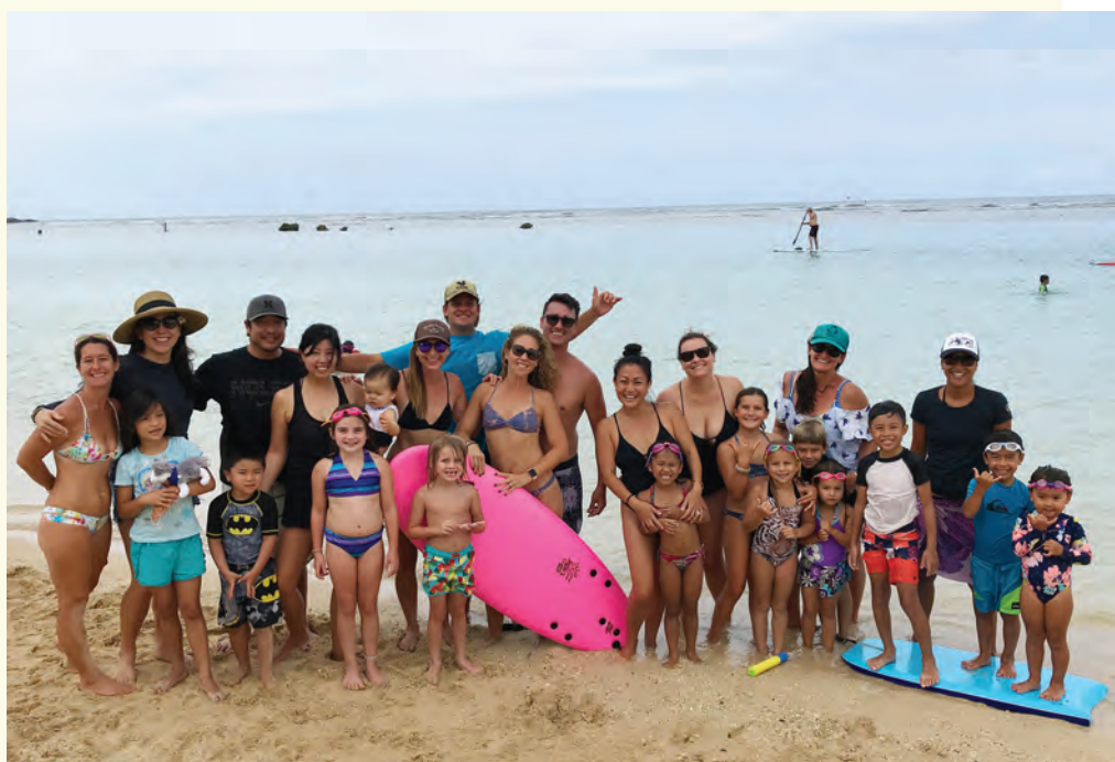
'97 classmates and their families enjoyed a day together at Ala Moana Beach Park.