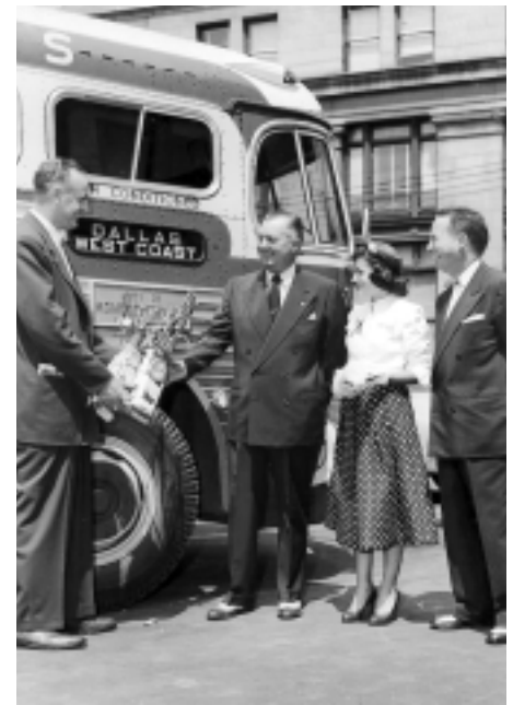
A special ceremony on May 7, 1952 highlighted through service on the Dixieland Route to Dallas and the West Coast. The coach appears to be a PD4103.

By 1960, some of the Trailways operators started to embrace the 40-foot Eagle as the coach of choice. Capital Trailways decided to do the same and eventually had 01, 05 and 10 model Eagles in its fleet. Eagles soon became the most popular model for the Trailways thru services.