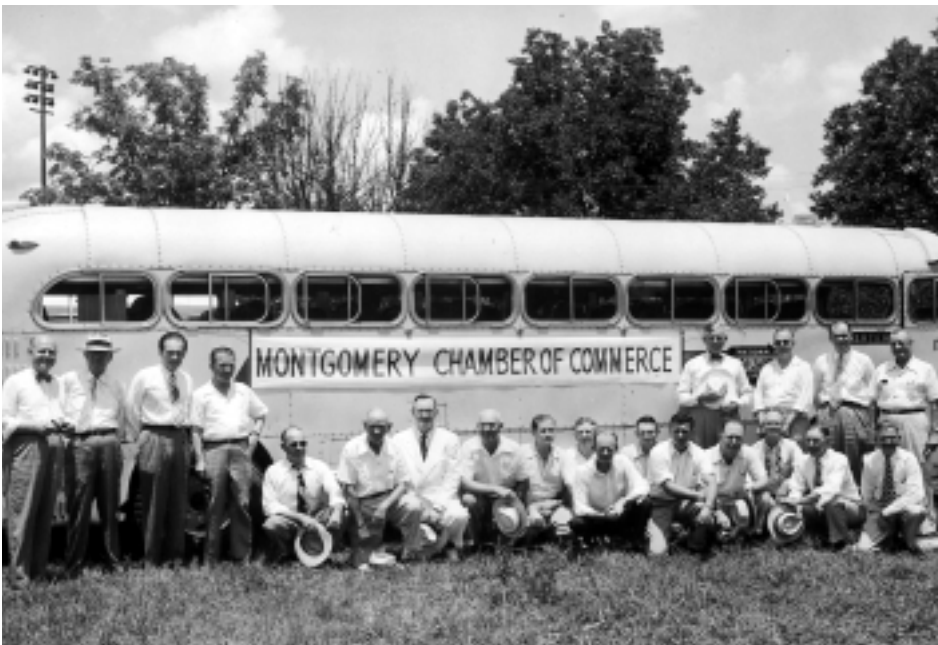
This Aerocoach was chartered to go to the Chilton County Peach Festival in Clanton, Alabama. The sign on the side of the coach makes sure we know that the group was the Montgomery Chamber of Commerce. The date was August of 1950 and the opened windows on the coach suggest it must have been a hot day.

ways route was established between New York, Washington, Atlanta, and either Mobile or Houston. Colonial Trailways operated the segment from Montgomery through Mobile to New Orleans. Trailways thru service was also established on a Gulf Coast route from Miami or Jacksonville via Tallahassee, Pensacola, Mobile and New Orleans to Houston. Colonial Trailways operated the segment from Pensacola to New Orleans.