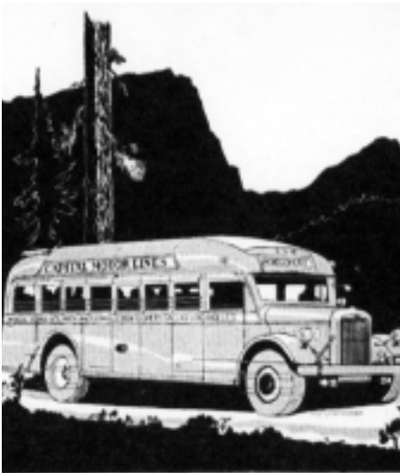
This drawing of a traditional front engine bus lettered for Capital Motor Lines appeared in a 1937 timetable.