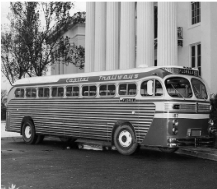
Capital Trailways operated several Aerocoaches in the immediate post-war years. Taken at the State Capital in Montgomery, this shows one of the last Aerocoaches delivered, probably in 1952, before Aerocoach production was discontinued.