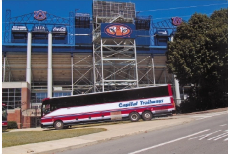
Coach 99367 was recently photographed while on a charter. It is a 45-foot, 57-passenger Van Hool C2045 built in 2005. Today's latest paint scheme is traditional Trailways red and white with the addition of a blue stripe and the company name in blue.

Capital Trailways today operates more than 8,500 charters annually, transporting