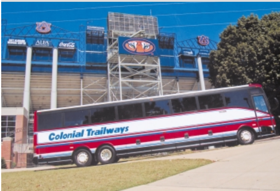
In 2000, Capital leased two Van Hool C2045 coaches. This was followed by additional Van Hool purchases by both Capital Trailways and Colonial Trailways. Shown here is coach 95586, a 2001 Van Hool C2045, one of the early Van Hool coaches to be added to the fleet.

Both Capital Trailways and Colonial Trailways no longer operate any independent scheduled service. They are now in a revenue sharing pool with Greyhound Lines, Inc. and all operations are in conjunction with Greyhound.