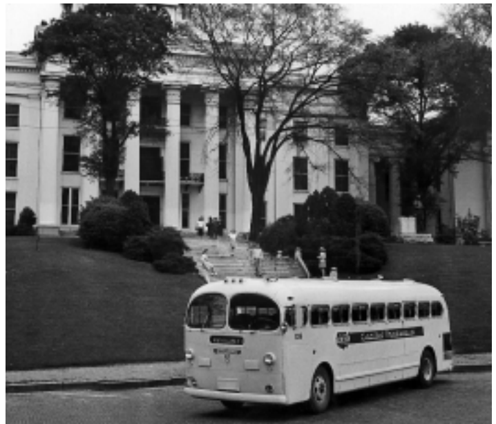
An earlier model Aerocoach operating for Capital Trailways was photographed in the late 1940s. The company also had some ACF Brills at this time. The location is the traditional site of the Alabama State Capital building in Montgomery.

to Selma on April 5, 1950 and extended through bus service into Montgomery.