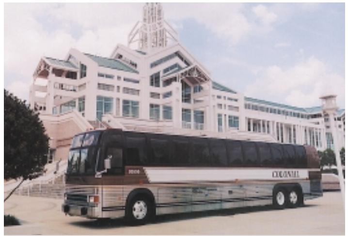
In 1990, the company began to acquire Prevost coaches. Shown here is a 45-foot 195 Prevost XL with 54 seats. These were used exclusively in charter service.

years were no longer carrying passengers in any numbers. Capital Trailways took the logical steps to reduce service and eliminate routes accordingly.