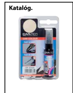
Opravné lakovacie ceruzky