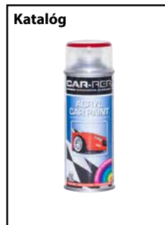
Farby v spreji