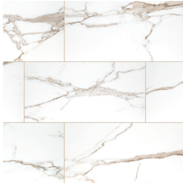
Savoy Crema 12"x24"