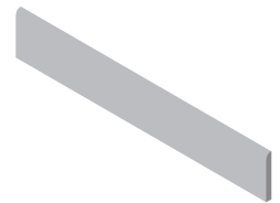
3" x 24" Bullnose