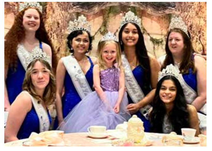
Annual Tea Party Scholarship Fundraiser

royalty court members better and becoming friends with these amazing young ladies! I look forward to giving back to the community as Queen, and hope to inspire the younger generation to take care of our community and to take care of each other! My current college plan is to attend the University of Washington (Go Huskies) and study Psychology.