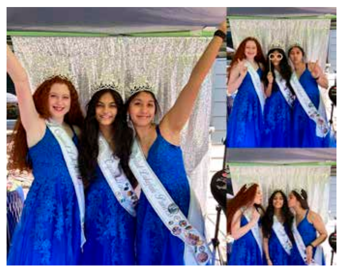
10 · Capital Lakefair Celebration · 2023