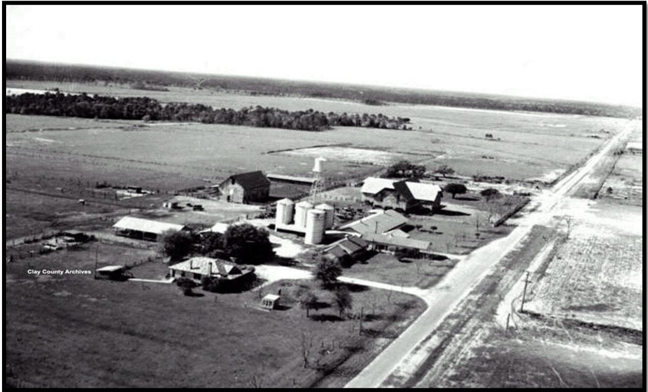
Shadowlawn Dairy at Penney Farms

worth of grants to deserving charitable and non-profit recipients here in Clay. They are our very good neighbor. It all started with the humble dairy cow at Shadowlawn Dairy.