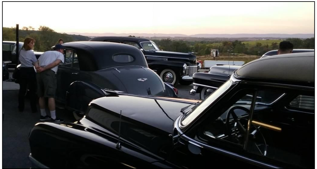
Several of Bill's "Old Cadillacs" were parked outside. With the sun setting behind the mountains in the distance, it was a perfect backdrop for these fine automobiles.

On a beautiful Wednesday October 4 evening, Bill opened the doors of one of his large storage buildings to reveal many of his twenty "old Cadillacs," (Bill's words) and one Packard. Surrounding the building was the rest of his old Cadillac collection. But this was more than just a private showing of automobiles; this was a festive open house with plenty of food, beverages and music.