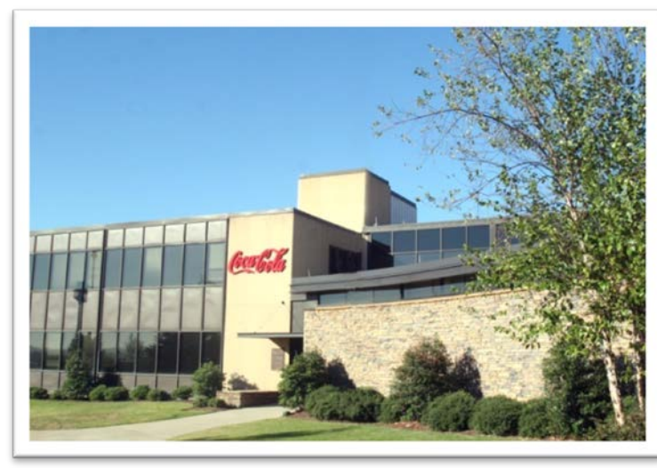
Birmingham Coca-Cola Bottling Company Today