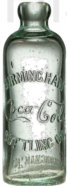
Birmingham Coca-Cola Bottle, Pre-1915