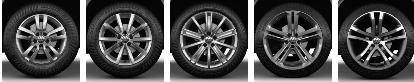
16" Portland alloy wheel TL