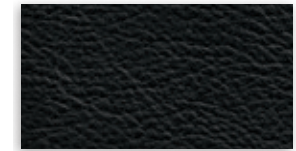
4 Charcoal Black Leather