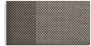
1 Medium Light Stone Cloth with Medium Dark Stone Accents