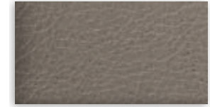
3 Medium Light Stone Leather