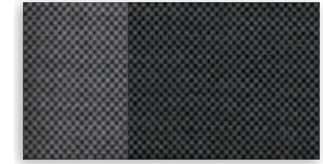
2 Charcoal Black Cloth with Warm Steel Accents