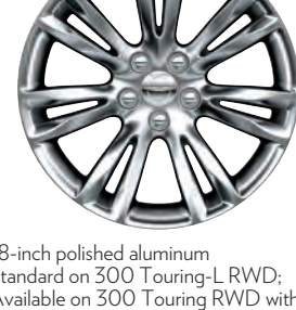
18-inch polished aluminum Standard on 300 Touring-L RWD; Available on 300 Touring RWD with Driver Convenience Group (WPC)