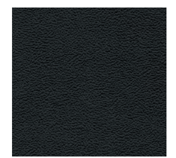
Nappa leather-faced — Black Standard on 300 Touring-L