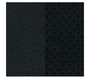
Nappa leather-faced with perforated inserts — Black with Light Diesel accent stitching and embroidered S logo Available on 300S with Comfort Group