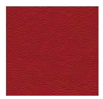
Nappa leather-faced — Radar Red with Light Diesel accent stitching and embroidered S logo Available on 300S