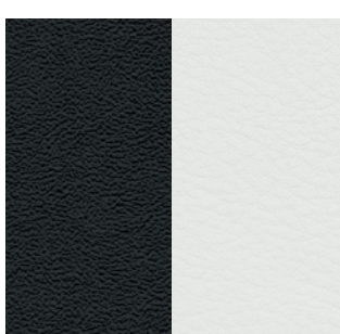
Nappa leather-faced — Black / Smoke with Light Diesel accent stitching and embroidered S logo Standard on 300S