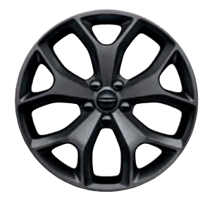
20-inch Black Noise aluminum Standard on 300S RWD; Available on 300 Touring RWD and 300 Touring-L RWD with Sport Appearance Package (WHG)