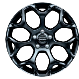
19-inch Black Noise aluminum Standard on 300S AWD; Available on 300 Touring AWD and 300 Touring-L AWD with Sport Appearance Package (WAK)