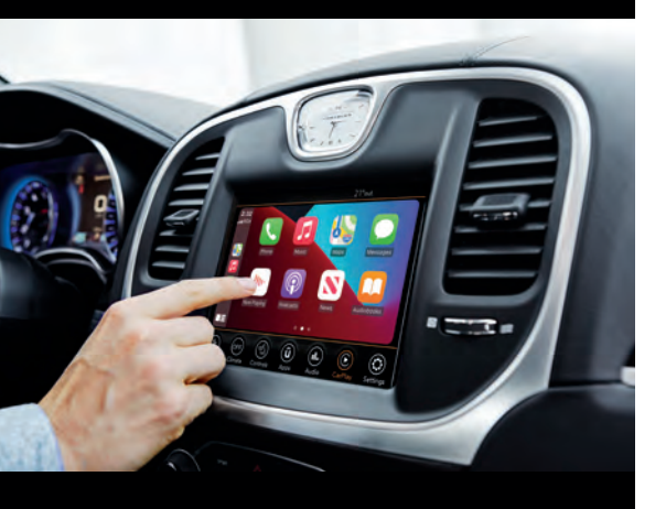
STANDARD 8.4-INCH UCONNECT® TOUCHSCREEN