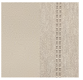
Premium cloth — Linen Standard on 300 Touring