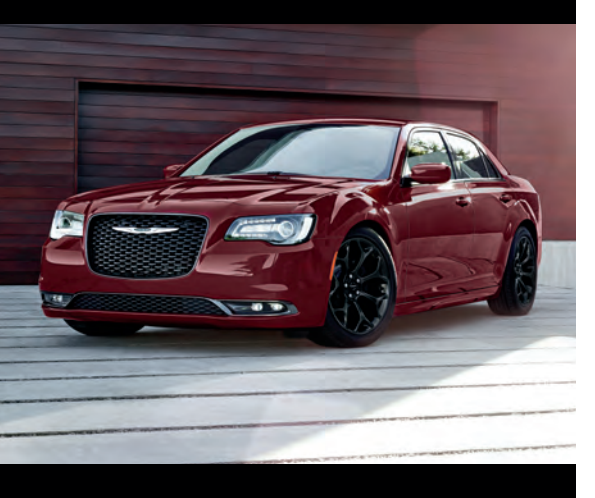
300S IN VELVET RED PEARL