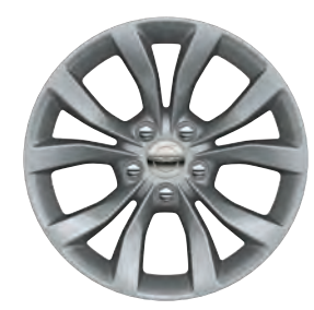
17-inch Fine Silver aluminum Standard on 300 Touring RWD (WF6)