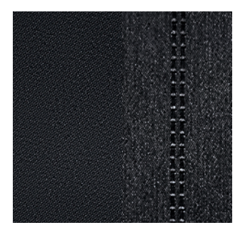
Premium cloth — Black Standard on 300 Touring