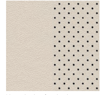
Nappa leather-faced with perforated inserts — Linen Available on 300 Touring-L with Comfort Group