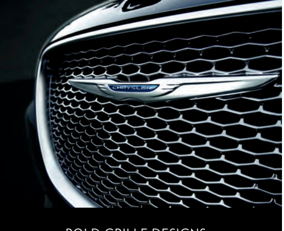
BOLD GRILLE DESIGNS