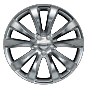
20-inch polished aluminum Available on 300 Touring RWD and 300 Touring-L RWD with Chrome Appearance Package (WFY)