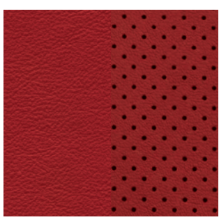
Nappa leather-faced with perforated inserts — Radar Red with Light Diesel accent stitching and embroidered S logo Available on 300S with Comfort Group