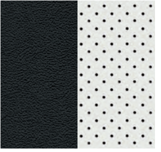
Nappa leather-faced with perforated inserts — Black / Smoke with Light Diesel accent stitching and embroidered S logo Available on 300S with Comfort Group