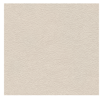
Nappa leather-faced — Linen Standard on 300 Touring-L