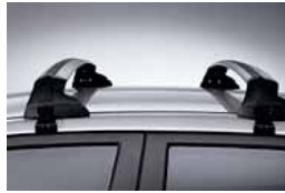
SPORTS AND TRAVEL ENTHUSIASTS WILL APPRECIATE THE VERSATILE ROOF CROSS RAIL.