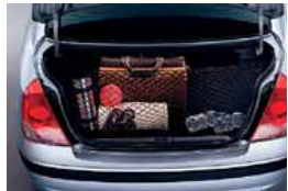
A CUSTOM-FITTED TRUNK CARGO NET HELPS KEEP GROCERIES AND OTHER ITEMS IN PLACE.