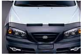
PROTECT YOUR ELANTRA'S FINISH WITH A DURABLE, HIGH-QUALITY FRONT NOSE MASK.

If you'd like to customize your Elantra, please see your Hyundai dealer for the full line of Hyundai accessories. You should always use genuine Hyundai parts and accessories, which meet strict standards for quality and durability.