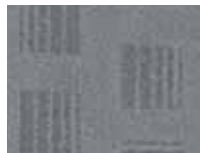
Shale Cloth Standard on SEL