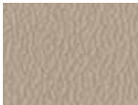
Pebble Leather Standard on Limited, Available on SEL