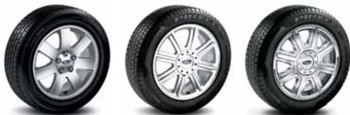
17" 7-Spoke Aluminum Standard on SEL