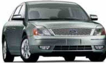
Titanium Green Metallic