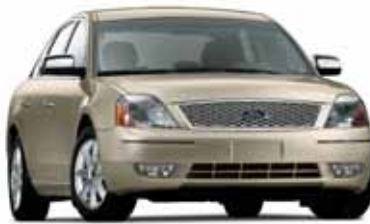
Dune Pearl Metallic