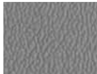
Shale Leather Available on SEL