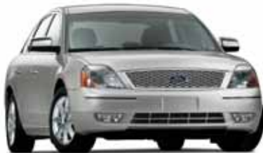
Silver Birch Metallic