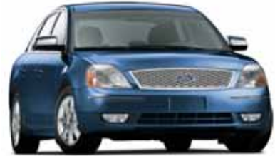
Dark Blue Pearl Metallic