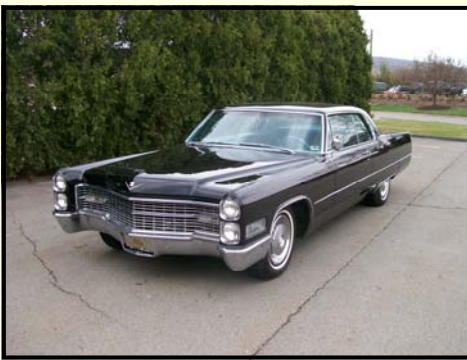
1966 Cadillac Calais Coupe

This very nice Corvette has 93,000 miles and the same owner for the last 12 years. It has the original 454ci 270hp V8 with an automatic. The colors are red with a white top and black leather interior. Has power steering, power brakes, a/c, tilt steering wheel and an AM/FM radio. A nice opportunity in the right color combination.