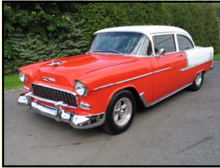
1955 Chevrolet Bel Air 2 Door Sedan

This is a real Cuda 340 with a 360ci 500hp V8 with a D21 factory 4-speed manual transmission. It received a frame-off restoration and has Edelbrock aluminum heads, Weld Racing Wheels, rally mirrors and an added Go-Wing.