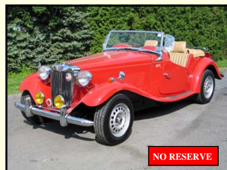
1986 Volkswagen Ascot MG TD Replica

Only 49,903 original miles. Comes with a book of service records and brand new whitewall tires. It has the 5.7 Liter V8 with an automatic transmission. All the power options included.