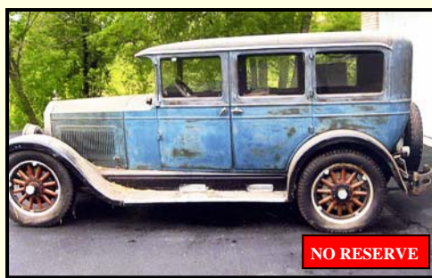
1927 Willys-Knight Sedan

This Camaro had a frame-on restoration and is very nicely done. It is powered by the 350ci V8 with an automatic transmission. It has power steering, power brakes and dual exhaust. These are becoming very collectable.