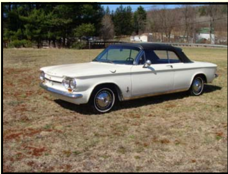
1964 Chevrolet Corvair Convertible

With only 25,000 original miles, this LeMans is new in every respect. It comes with PHS documentation and is in immaculate original condition. It very highly optioned including an automatic, power steering, power brakes, power windows, power top and Pontiac Rally wheels. In every way this extra clean Pontiac is in perfect, like new condition.