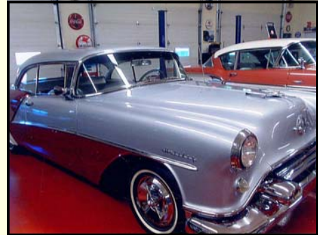
1954 Oldsmobile 98 2 Door Hardtop

A 31,000 actual mile example. Has a 350ci V8 with an automatic. Features a/c, power steering, power brakes, power windows, power door locks, tilt steering wheel, cruise control, AM/FM Cassette, glass T-Tops and aluminum wheels. It has a nice original interior. Comes with owner's manual, protecto-plate and check in sheet. A great driver.