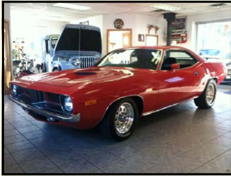
1972 Plymouth Cuda

This is a real Cuda 340 with a 360ci 500hp V8 with a D21 factory 4-speed manual transmission. It received a frame-off restoration and has Edelbrock aluminum heads, Weld Racing Wheels, rally mirrors and an added Go-Wing.