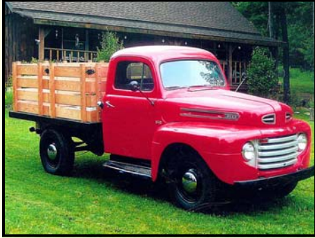
1948 Ford F3 Truck

A very nicely restored example with a beautiful stake bed and new 17 inch tires. It has the 6 cylinder with a 3-speed manual transmission. An unusual truck that is very well done.