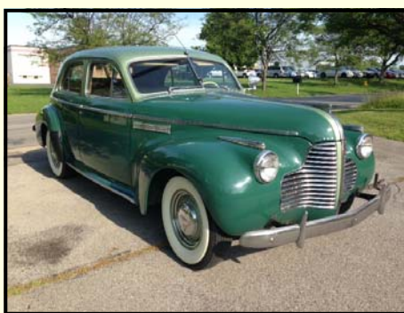
1940 Buick Super Sedan

This is a very rare Cosmopolitan Capri as only 509 were built in 1950. It has a 337ci flathead V8 with a hydramatic automatic. The car shows 27,000 miles, which are believed to be original. The exterior, interior engine, trunk and underside are all in fabulous shape. It has been converted to a 12-volt electrical system.