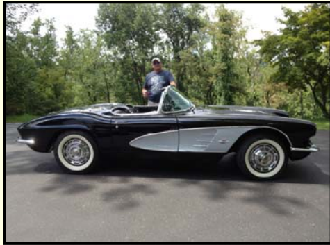
1961 Chevrolet Corvette Roadster

A completely restored example in Tuxedo Black with Satin Silver covers. It was stripped to bare fiberglass and gel coated in black before being repainted. It is powered by a 283ci V8 with a 4-barrel carburetor and a 4-speed manual transmission. Comes with both the hardtop and soft-top. A very nice Corvette with a replacement AM/FM radio. A trunk full of trophy's come with the car.