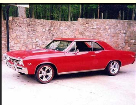
1967 Chevrolet Chevelle SS Coupe

This Limited Edition Challenger has the 6.1 Liter Hemi with a 6-speed manual transmission and a 3.06 rear axle. The exterior is Black Crystal Pearl with a Slate Gray interior that has accented bucket seats. Has an extended warranty until 2016 and just 3,704 miles.