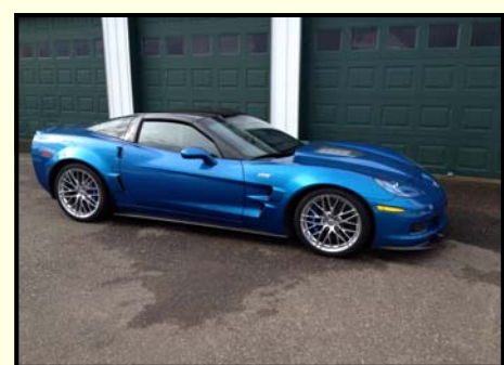
2010 Chevrolet Corvette ZR1

This all-wheel drive example has had only 1 owner from new and just 34,445 miles. It comes with a Certificate of Authenticity from Porsche. The engine is the water-cooled 24-valve 3.6 liter twin turbo with a 6-speed manual. With the modifications, this wicked fast Porsche has 570hp.