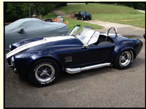
1965 Superformance Cobra Roadster

This Roadster has just 76,444 original miles and has had an engine upgrade to a 454ci V8 built to 468ci with 500hp. It also has a Tremec 5-speed transmission with a Centerforce clutch. Also includes aluminum heads, MSD distributor, front disc brake conversion, late model spindles with larger bearings, new suspension bushings, composite rear springs and an adjustable rear camber bar. This awesome machine has a black Stinger hood and sidepipes.