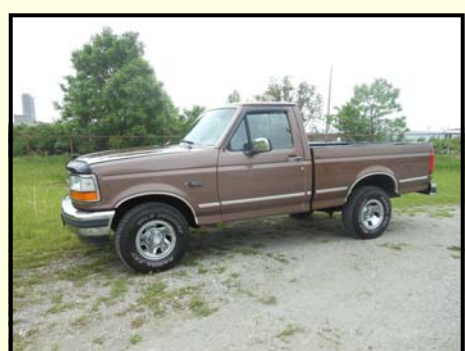
1993 Ford F-150 XLT Pickup

Over $48,000 spent on the build of this incredible car. It has a completely rebuilt 427ci V8, and 2 Edelbrock 650cfm carburetors. The transmission is a 5-speed manual TKO. The rear-end is a 12-bolt posi with new 3.73 gears. A gorgeous car with all the power you'll ever need.