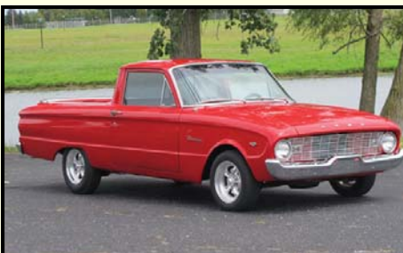
1960 Ford Ranchero Custom

146,000 miles from new. It runs smoothly and shifts perfectly and at highway speeds is very fast. The paint is Champagne Gold and was recently repainted. Car is a looker and a good driver.