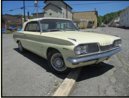
1962 Pontiac LeMans Convertible

A very nicely restored example with a beautiful stake bed and new 17 inch tires. It has the 6 cylinder with a 3-speed manual transmission. An unusual truck that is very well done.