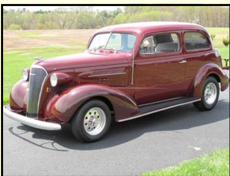
1937 Chevrolet 2 Door Sedan

This Galaxie had a detailed restoration of a southern rust free car. The engine is the 390ci High Performance V8 with a 4-speed manual transmission.