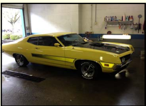
1970 Ford Torino Super Cobra Jet Coupe

Arguably one of the best complete restorations on the planet. It is powered by the 440ci Magnum V8 with a 4-barrel carburetor and a pistol grip 4-speed manual. Factory options include bucket seats, console, Ramcharger hood, radio and a black vinyl top. This R/T was previously in the Rick Hendrick collection.