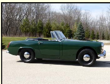
1967 Austin-Healey Sprite Mark IV Convertible

This Corvette is powered by the L48 350ci V8 with an automatic. It has white leather, power steering, power brakes, power windows, tilt wheel, and a/c. Also, has the special order blue glass T- Roofs. It has just 57,000 original miles and comes with the original window sticker and the original sales invoice. List price when new was $17,335 and it was sold on May 2, 1980.