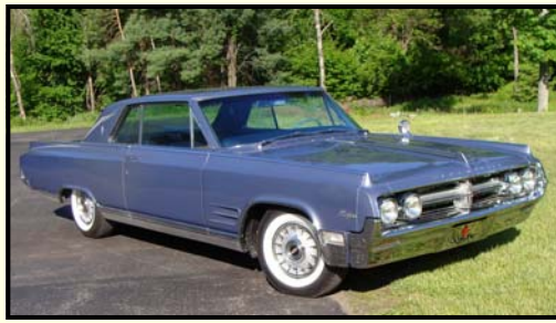
1964 Oldsmobile Starfire Coupe

A 71,000 original miles CA car that was rust free. It was a 350ci 4-speed, now it's an all-aluminum 427ci 425hp with mostly correct date-coded components used. It has lots of original paperwork. Also, the original 350ci engine comes with it.