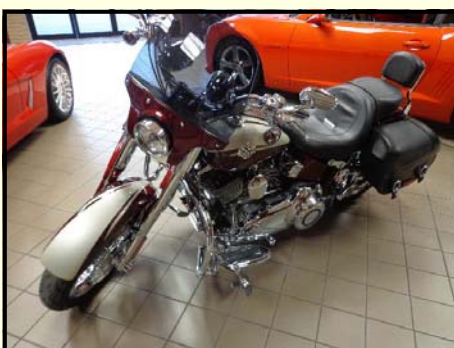
2010 Harley Davidson FLSTSE CVO

This very nice dune buggy has a Manx body. A 4 cylinder with a manual transmission and lots of chrome on the motor. A lot of fun for the summertime.