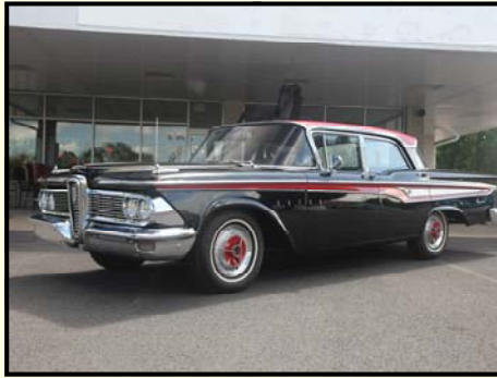
1959 Edsel Corsair Sedan

A V8 powered example with an automatic transmission. It is black and red and shows just 49,000 miles. These are getting harder to find in this nice of condition.