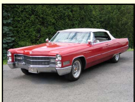
1966 Cadillac DeVille Convertible

A CVO Screamin' Eagle Softail with only 4,196 original miles. Has a Vance and Hinds exhaust, HD factory speakers with Ipod hookup, matching steel shift lever, HD Sundowner seat, stainless steel bold kit, HD matching highway foot pegs, quick detach saddle bags and windshield. The color is Crimson Red Sunglo and Autumn Hazel. A very nice bike.