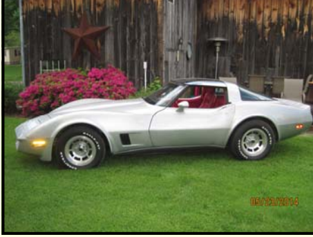
1980 Chevrolet Corvette Coupe

An original 43,000 mile example that is exceptionally clean, with only 1 owner from new. A 5.7 Liter fuel injected V8 with an automatic transmission. All power accessories and alloy wheels.