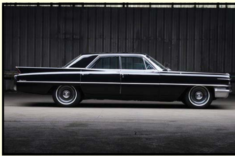
1963 Cadillac Park Avenue Sedan DeVille

This Corvette was delivered to Sunderland Chevrolet in Harrisburg, PA and kept by the owner of the dealership. This amazing car has only 220 original miles and comes with every piece of paperwork. It features the L-48 350ci V8 with an automatic. It still smells new inside. Don't miss this one of kind 220 mile car.