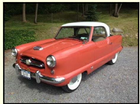
1955 Metropolitan Coupe

This F150 is loaded and very well maintained. It was a 1 owner that was traded in on a new truck. It has the 5.0 Liter V8 with an automatic transmission and 73,818 actual miles from new.