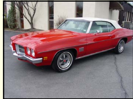
1971 Pontiac LeMans Convertible

Powered by the legendary 348ci V8 with tri-power and a 3-speed manual, this Impala is ready to go. It has 4 new wide whitewalls. The options include power steering, continental kit, fender skirts, rear bumper guards, spinner hubcaps, factory working radio, dual antennas, windshield washer, seat belts and dual exhaust. An impressive example.