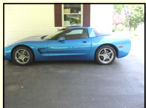
2000 Chevrolet Corvette Coupe

Powered by a 289-cid Ford V-8 engine and Ford C4 automatic transmission with a Lokar shifter, this frame-off restored Ranchero presents nicely in exceptional Ford Vermillion Red with chrome American Racing five-spoke wheels and the exterior chrome trim pieces tie the sleek look together. The Ranchero is reported to be a consistent show winner.