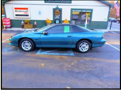
1994 Chevrolet Camaro Z28

An original 43,000 mile example that is exceptionally clean, with only 1 owner from new. A 5.7 Liter fuel injected V8 with an automatic transmission. All power accessories and alloy wheels.