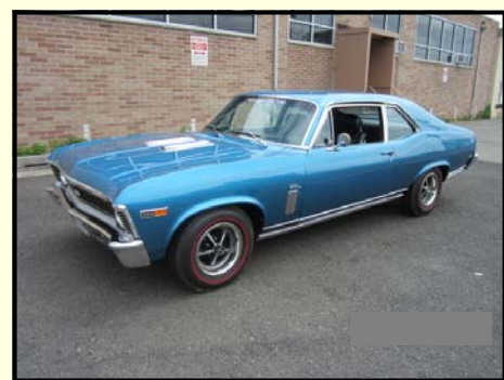
1969 Chevrolet Nova SS Coupe

Beautiful triple-black true 138 SS, with a date/code correct upgraded L78 396ci 375hp engine with a Muncie 4-speed and a 12-bolt rear end. It received a complete frame-off restoration with only 100 miles on the engine. Laser straight body and one of the nicest you will ever see. It runs and drives perfectly and is drop-dead gorgeous