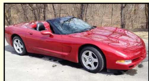
1999 Chevrolet Corvette Convertible

A very nice pulling triple axle trailer with the capacity to pull 3 cars. It has a 10-ton winch with a 25' remote cable, key lock storage compartment, goose-neck coupler, electrical connection extension and 9' aluminum ramps. Sold with a title.