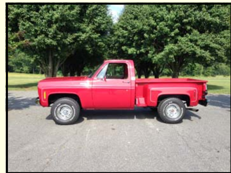
1976 Chevrolet Scottsdale K10 4X4

This custom Bel Air has a 350ci V8 with a 4-speed manual transmission. It has power steering, power brakes, Vintage air, American Racing Mags, custom cloth interior, aluminum radiator, Hooker headers, Flowmaster exhaust and an AM/FM cassette player. Great performing example with all the right modifications.