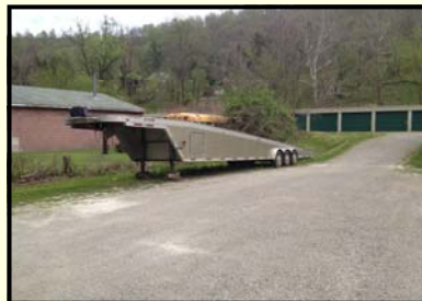
1989 Featherlite Aluminum 3-Car Trailer

With only 57,160 original miles, this GM Performance Parts SS Camaro would make an excellent every day car. It has lots of suspension tweaks and mechanically it is in fantastic condition. Finished in black with Buckskin interior.