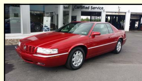
1997 Cadillac Eldorado Touring Coupe

This remarkable car sis from the private collection of an avid Cadillac owner. It has under 19,000 original miles and is finished in Cameo White with a white leather interior with red accents.