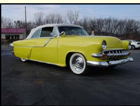
1953 Ford Custom

Nut & bolt rotisserie restoration on solid California original car. 289ci V8, Cruise-O-Matic automatic, factory a/c, power steering, power disc brakes, red/red with a black power convertible top. Since this photo was taken, correct factory styled steel wheels added. Fully documented with a Marti Report. Ready for fun, cruising or serious show competition.