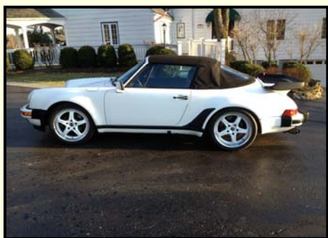
1988 Porsche 930 Turbo Cabriolet

With only 56,147 original miles this box stock Corvette is a very nice and clean example. Powered by the 5.7 Liter 350ci V8 that produces 345hp and has a 6-speed manual transmission. Everything works and it needs nothing. Finished in Firethorn Red with a black leather interior and a black convertible top. The current owner used this for his daily driver.