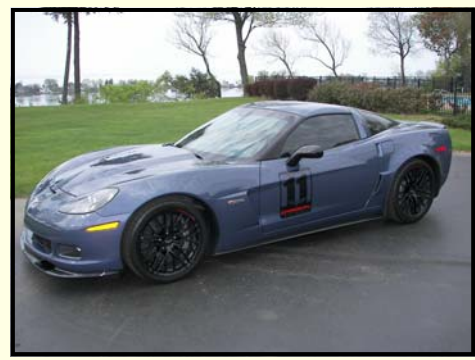
2011 Chevrolet Corvette Z06 Coupe

This LeMans was featured in High Performance Pontiac Magazine in October 1993 and is 1 of only 3,865 built in 1971. It has a power top, Honeycomb wheels, ice cold factory a/c, power steering, power brakes, bucket seats, console and a factory AM/FM radio. It is powered by the 400ci V8 with an automatic. It has a laser straight body and excellent paint.