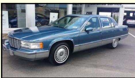
1993 Cadillac Fleetwood Brougham

This Buick received a recent frame-up restoration. It drives as nice as it looks and is very comfortable with the air conditioning.