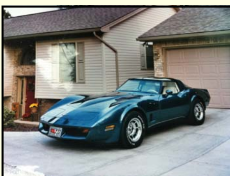
1980 Chevrolet Corvette Coupe

This Jaguar is black with tan leather interior with wire wheels and only 24,000 miles on the odometer. Engine is a 6-cylinder with an automatic transmission. It has been in a heated garage its entire life and has a good Carfax.