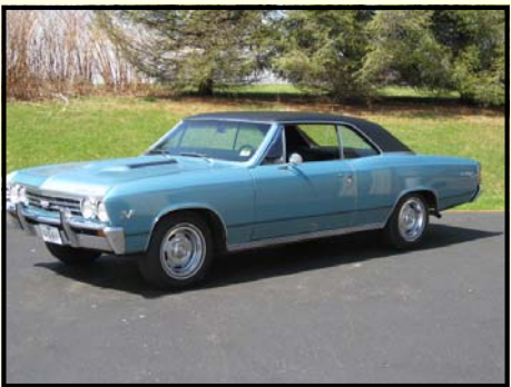
1967 Chevrolet Chevelle SS 396 Coupe

A 324ci V8 with an automatic transmission. The red and silver exterior matches nicely with the red and silver interior. Has power steering, power brakes, radial tires, fender skirts, new windshield and new chrome.