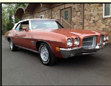
1971 Pontiac LeMans Sport Convertible

This was a West Coast car with a no rust. It has been upgraded with a Ford FI 5.0 Liter engine, automatic with overdrive, 9" Ford rear, power rack and pinion steering, front discs, Vintage Air and a 6-way power drivers seat. It has an extremely straight body tastefully modified with period correct "old school" trim. This American icon is ready to tour with confidence.