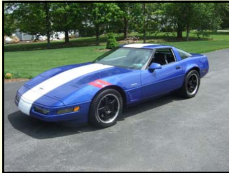
1996 Chevrolet Corvette GS Coupe

Highly sought after and very collectable are these Grand Sports. The total production was limited to 1,000 units and this is #521. It has the 5.7 Liter 350ci V8 with a 6-speed manual transmission. The options include the Z-51 suspension package, freshly reconditioned wheels, new tires with less than 1,000 miles and new clutch with less than 500 miles on it. Always been garaged and covered.