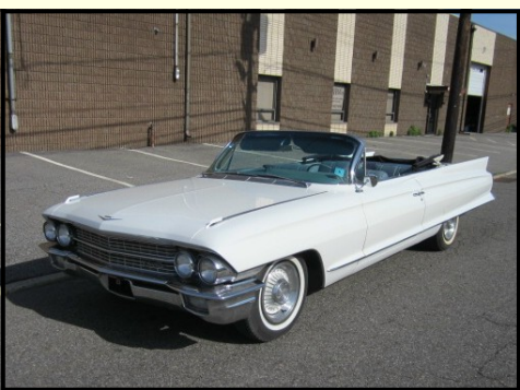
1962 Cadillac Series 62 Convertible

One of the very first Sport Roadsters built, with a gate release and build sheet. It is a code M-10, which means it was a Ford company car and believed to have been on display at the Ford Rotunda building. It received a $150,000 rotisserie restoration. It has the 390ci V8 with added tri-power and an automatic. It is simply one of the best that money can buy.