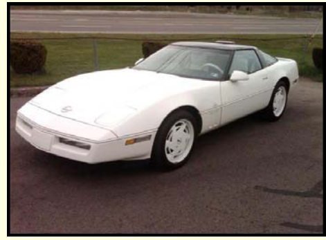
1988 Chevrolet Corvette 35 th Anniversary Coupe

This is a very clean and stock appearing Corvette that has been mechanically modified. The engine is a new rebuilt 350ci V8 with a cam, aluminum heads, intake and carburetor. The automatic was also rebuilt with a high stall convertor and a shift kit. It has front and rear sway bars and adjustable camber bars. White exterior with Oxblood interior and T-Tops. A fine example that runs better than new.