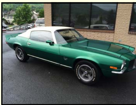
1973 Chevrolet Camaro LT RS Coupe

1 owner Pennsylvania Bronco has only 44,000 original miles, still on its original PA title. Just completed a full restoration and is fully sorted. All of the sheet metal is original. The paint is the correct factory Jade Poly. It has the original 302ci V8, automatic and 4WD. Last year for this body style and these Broncos are climbing in value daily.