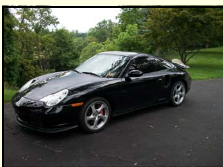
2001 Porsche 911 Twin Turbo

One of the best colors for the Turbo Cabriolet, this car is finished in its Grand Prix White. The original miles are just 60,893. It comes with a Certificate of Authenticity. The 6-cylinder 282hp engine was completely rebuilt less than 10,000 miles ago. These cars are steadily increasing in value.