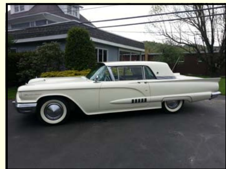
1958 Ford Thunderbird

This triple black example is 1 of 799 produced in this color combination in 1999. It has only 6,000 original miles. Powered by the 3.5 Liter high-output SOHC aluminum V-6 with an automatic transmission with auto stick. All the power options on this Prowler including chrome wheels and cold A/C. Comes with the original books and keys.