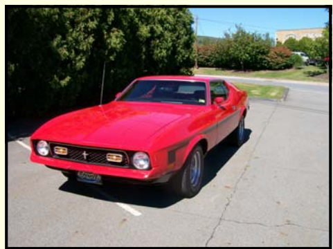
1972 Ford Mustang Mach 1 Fastback

An all original beautiful classy black Cadillac in a fantastic color combination, black exterior with a turquoise interior. V8 powered with an automatic transmission. Runs and drives perfect! A Calais Coupe is a rare find, especially one this exceptional.