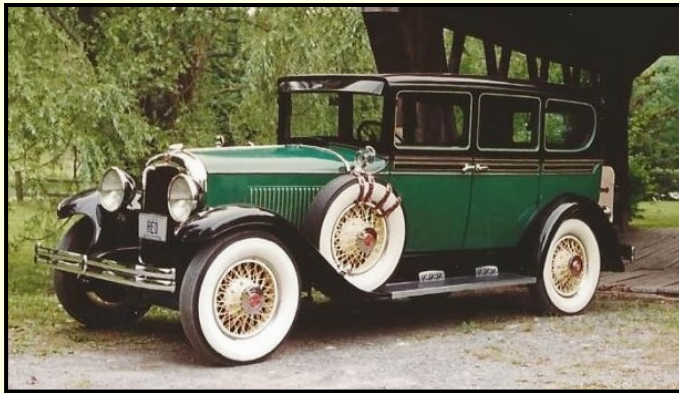
1929 REO Flying Cloud Sport Sedan

This Excalibur was originally used as a wedding car and would make a great promotional vehicle. It has a Lincoln V8 engine. They are climbing in value and would make an excellent addition to anyone looking for something unique.