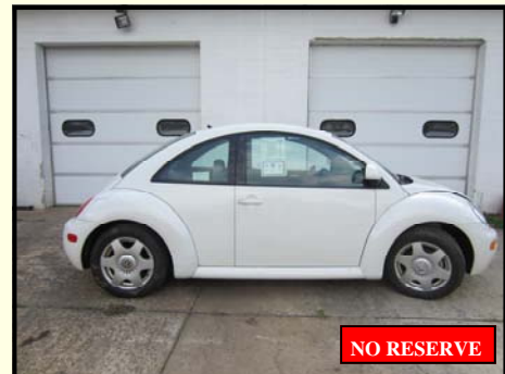
1998 Volkswagen Beetle

This is a fresh restoration to factory specifications with NOS parts. It is ready to go and needs nothing.