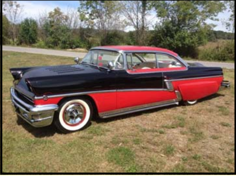
1956 Mercury Montclair Hardtop Custom

This mild Custom Montclair has dummy spots, bubble skirts, lakes pipes and a continental kit. The engine is the 312ci V8 with an automatic transmission. An old school hot rod ready to go cruising.