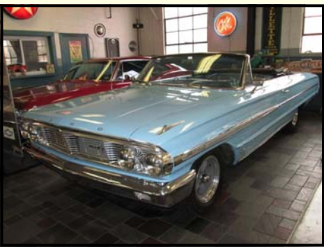
1964 Ford Galaxie 500 XL

This is a very rare, all original, 75th Anniversary Edition with 2,400 original miles. It is #20 of 29 produced in 2000. Only 104 Berger Camaros were produced in 3 years they were built. Always stored in a climate controlled