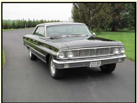
1964 Ford Galaxie 500 XL

This Bel Air Convertible has been in the same family since new. It has the original 265ci V8 engine with a Powerglide automatic transmission. The exterior is original and it is the rare Onyx Black and Crocus Yellow combination. It has a working factory radio and fender skirts. This original car can be driven anywhere.