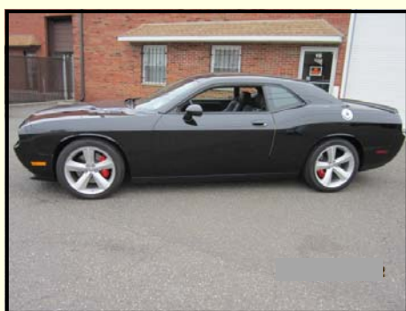
2009 Dodge Challenger SRT8

A 3 owner vehicle from new with 28,675 miles that are believed to be original. A frame-off rotisserie restoration and the engine and transmission were freshened in 2010. The 396ci 375hp engine was dyno tested at 415hp. It has a 4-speed manual transmission with a 12-bolt rear-end. It has blue exterior paint and black interior. Runs and drives perfectly.