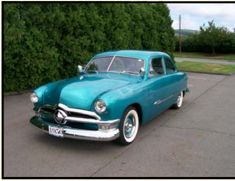
1950 Ford Custom Streetrod

This 4.9 Liter WS4 Trans Am has a factory M-21 4-speed manual. Also, features the WS7 Performance Handling/Wheel package. Equipment includes AM/FM radio, posi-traction, Flowmaster exhaust, new black seat covers, new carpet, new headliner and a new console. It has laser straight black paint with the Y82 Bandit stripe package added.