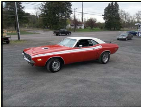
1971 Dodge Challenger R/T

Highly sought after and very collectable are these Grand Sports. The total production was limited to 1,000 units and this is #521. It has the 5.7 Liter 350ci V8 with a 6-speed manual transmission. The options include the Z-51 suspension package, freshly reconditioned wheels, new tires with less than 1,000 miles and new clutch with less than 500 miles on it. Always been garaged and covered.