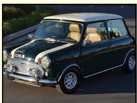
1972 Austin Morris Mini

This is a stunning black Cadillac Limousine. Very nice newly customized interior. Arrive in style! Cadillac, the standard of the world!