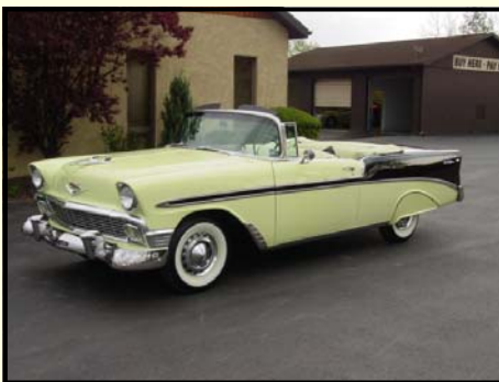
1956 Chevrolet Bel Air Convertible

The motor and transmission were completely redone on this Corvair Convertible. It has a new top and new seat covers. A 6-cylinder engine with an automatic transmission. The owner has had this car for 13 years and has done lots of work on it to keep it up.