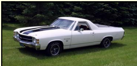
1971 Chevrolet El Camino SS

This is a 2 owner car with 89,000 original miles and a good Carfax. The engine is the 6-cylinder with an automatic transmission. It is Pearl White with Navy Blue leather interior.