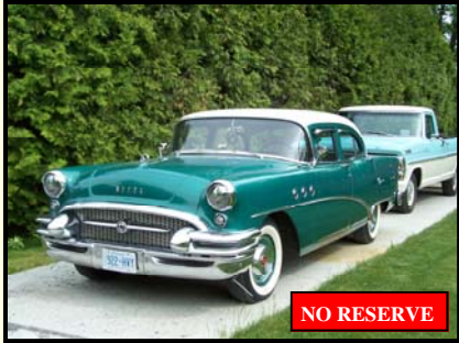
1955 Buick Special 4 Door

With only 19,000 original miles, this might be one of the lowest mileage examples. It was stored for 35 years in climate controlled garage and has won many awards. It has an 8 cylinder with an automatic transmission. It starts runs and drives like new