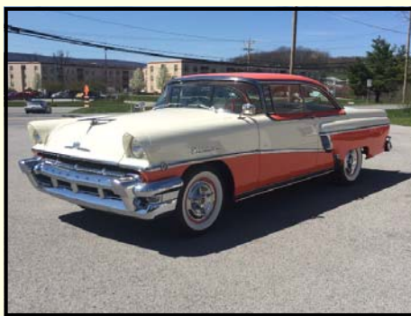
1956 Mercury Montclair 2 Door Hardtop

This Impala is a correct SS and 4-speed and is very original. The interior is mostly original as is all the bright work. It had a recent new Midnight Blue paint job on a very solid body. The 327ci V8 was professionally rebuilt to 300hp specs. This car runs, drives, shifts, handles and stops flawlessly and can be driven anywhere. The power top operates like new.