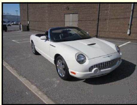
2002 Ford Thunderbird Roadster

The first year of the "square birds" with a freshly built 352ci V8 engine and a 3 speed Cruise-O-Matic automatic gear box. Only 66,000 miles on this great car. Features power steering and power windows. Has a new black/white interior and a beautiful white exterior. A great running car