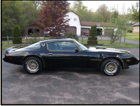
1979 Pontiac Trans Am

This 4.9 Liter WS4 Trans Am has a factory M-21 4-speed manual. Also, features the WS7 Performance Handling/Wheel package. Equipment includes AM/FM radio, posi-traction, Flowmaster exhaust, new black seat covers, new carpet, new headliner and a new console. It has laser straight black paint with the Y82 Bandit stripe package added.