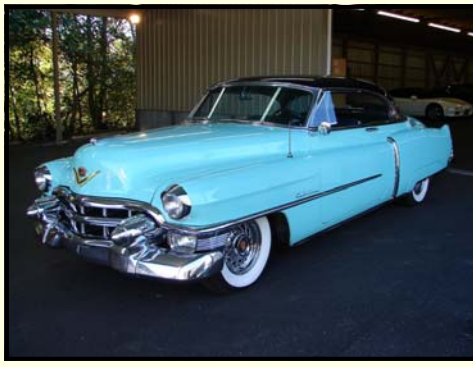
1953 Cadillac Coupe deVille

This is an original, un-restored and all numbers matching example with 1 re-paint in 1984. It has just 72,050 original miles and has had the same owner since 1970. This fine example is still on its 1970 title. It is PHS documented and a rare find. Powered by the 400ci V8 with 330hp and a 4-speed manual. The Firebird market is hot right now and this is one not to miss.