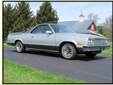
1987 Chevrolet El Camino

This 1950 Custom Street Rod is freshly done and done right. It wears a beautiful custom paint job and an all new interior. It has a Chevrolet V8 engine with a Chevrolet automatic transmission. Features all modern conveniences including power steering, power brakes and air conditioning. Drive it anywhere!