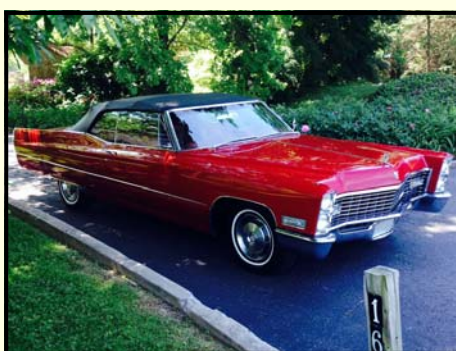
1967 Cadillac DeVille Convertible

A fully restored pickup with a beautiful black metallic paint job. It has a 350ci V8 with a 4-speed manual transmission and dual exhaust. The new interior is exceptional and finished in red vinyl with red carpet.