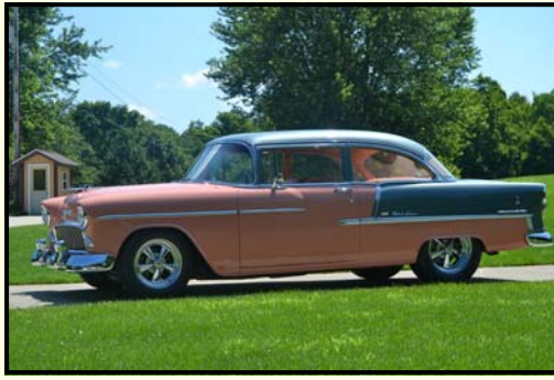
1955 Chevrolet 2 Door Sedan

This Arizona truck is rust free and received a flawless restoration. It has been upgraded to a Chevrolet small block 350ci V8 engine and has a manual transmission. It features a roof rack, winch, brush guard, fog lamps, black vinyl interior and BF Goodrich All Terrain T/A tires. A spectacular truck that's ready for the outback!