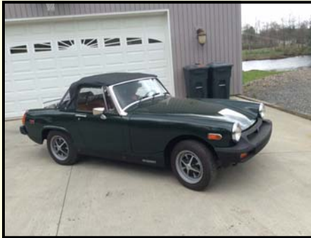
1979 MG Midget

This mild 1950's style custom Ford has been frenched, shaved and lowered. It is powered by a small block Chevrolet engine and an automatic transmission.