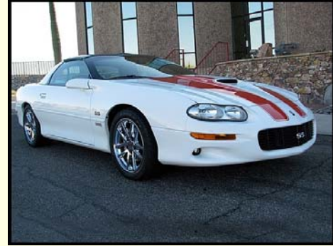
2000 Chevrolet Berger Camaro

This is a fully frame-off restored, numbers matching example believed to be 1 of 3 in this color combo. The exterior is India Ivory/ Harvest Gold. It is powered by the 265ci V8 power pack with a 3-speed manual. It has lots of extra chrome pieces. All of the chrome is triple plated. During the restoration, even hash marks were restored. A terrific example.