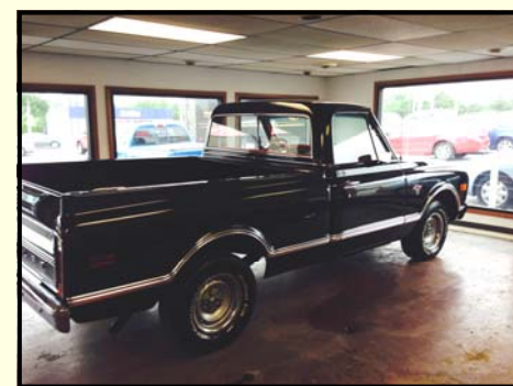
1968 Chevrolet C10 Pickup

A barn find example that is very solid. The body is straight and the interior is all there. It will be running by the time it gets to the auction. It has a straight 6 cylinder engine with a 3-speed manual transmission and wood spoke wheels. A great and solid project.