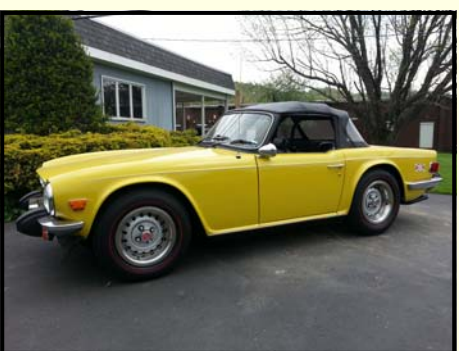
1976 Triumph TR6 Roadster

All original, one owner with only 5,500 miles. A 5.7 Liter 350ci V8 engine with an automatic transmission. It has all power options, cold A/C, beautiful silver exterior and black leather interior. 1 of 2,402 built in 1995.