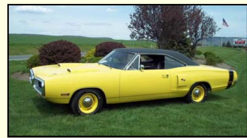
1970 Dodge Coronet R/T Hardtop

A very rare and desirable motorcycle, this Café Racer was only produced for 1 year, split between 1977 and 1978. It was purchased from Texas 4 years ago and has been properly stored since. Has just 53,313 original miles. Only occasionally shown at "bike nights", this unusual bike always draws a crowd at Harley and any other bike gatherings.