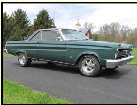
1965 Mercury Cyclone

Finished in Polar White with Medium Blue interior, this Cadillac is powered by a 390ci V8 with a Hydramatic automatic transmission. It features factory air conditioning, power windows, power seat, power convertible top and a factory AM radio. It is excellent throughout and is a fun car that can be shown or used for cruising.