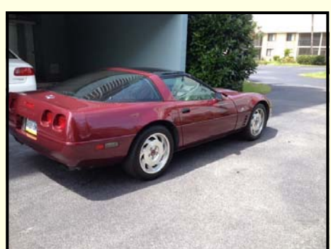
1993 Chevrolet Corvette 40 th Anniv. Coupe

Frame-off restored to a very high standard, this Bel Air Hardtop has a 383ci V8 with a Richmond 5-speed manual transmission. Has a Ford 9 inch rear-end and Dutchman coil-overs on the rear. A beautiful black leather interior with silver inserts. It has a stereo CD player, air conditioning and power steering.