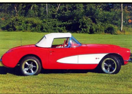
1957 Chevrolet Corvette Roadster

A classic British roadster with an inline 2.5 liter 6 cylinder engine, twin Stromberg carburetors and a 4-speed manual transmission. Beautiful Mimosa Yellow paint with a black soft top, black interior and 59,000 miles.