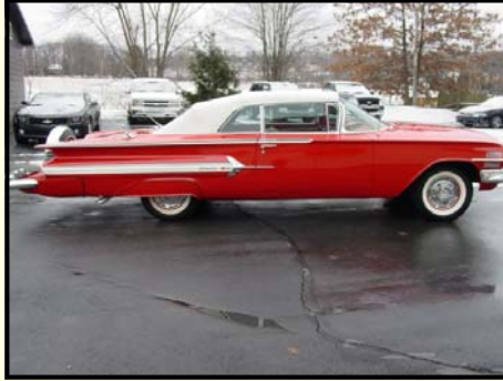
1960 Chevrolet Impala Convertible

Only 29,000 original miles on this Impala. It is 100% original with the plastic seat covers on it since new. Optional equipment includes automatic transmission, luxury wheel covers, fender skirts and factory AM radio. Mechanically this beautiful Impala is as great as it is cosmetically and it drives like the day it was bought new, 54 years ago.