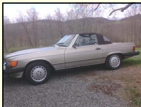
1986 Mercedes-Benz 560SL Roadster

Shows 95,000 miles and has always been in Florida. The body is in good condition with 1-repaint in Fire Engine Red. The underneath shows no rust. The engine has been detailed. Top mechanism has been gone over and works fine. A new top for it is in trunk. Good solid car.