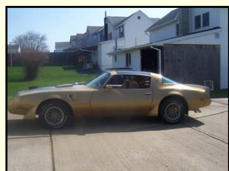
1979 Pontiac Firebird Trans Am

This convertible Austin-Healey has the 1,275cc engine with a 4-speed manual transmission. The restoration was recently completed on this California car. It is British Racing Green with a black convertible top and interior. A rare and unusual car.