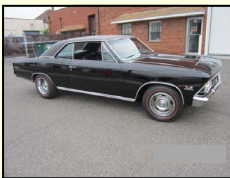
1966 Chevrolet Chevelle SS Coupe

A low mileage example has a clean Carfax and is V8 powered. It is Colonial White with a black leather interior. 2 tops with the hardtop dolly. Options include climate control a/c, tilt/telescopic wheel, AM/FM CD, power windows, power seats, power mirrors and power locks. Lots of extras with this excellent driving cruiser. Old world looks with modern technology.