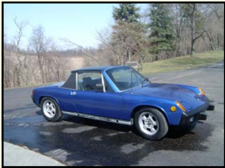
1974 Porsche 914 2.0 Targa

This was a dry California car that has had a complete engine and transmission rebuild from 914 LTD in July 2012 with receipts totaling over $7,000. The engine is the 2.0 Liter 4-cylinder with Bosch fuel injection and the transmission is a Porsche 5-speed manual. It runs and shifts like new and is as close to stock as they come.