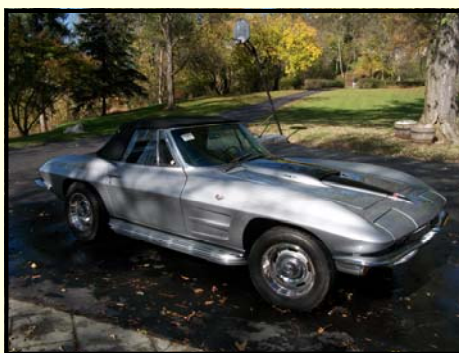
1964 Chevrolet Corvette Roadster

A completely restored example in Tuxedo Black with Satin Silver covers. It was stripped to bare fiberglass and gel coated in black before being repainted. It is powered by a 283ci V8 with a 4-barrel carburetor and a 4-speed manual transmission. Comes with both the hardtop and soft-top. A very nice Corvette with a replacement AM/FM radio. A trunk full of trophy's come with the car.