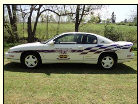
1995 Chevrolet Monte Carlo Pace Car

New for 1940 was the Super Series. It features a 107hp Dynaflex straight 8 engine. Stunningly styled, the Super was a whole new look for Buick. It is sleek and stream lined. This Buick is out of a long time collection and has always been a loved and well cared for car. The car is ready to enjoy – drive it, show it, tour it!