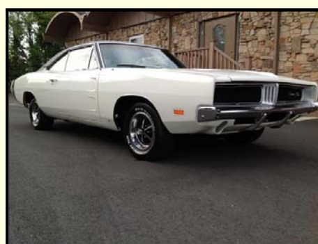
1969 Dodge Charger R/T

The removable Hardtop Coupe has the 350ci V8 with an automatic transmission. It is finished in blue with gray interior. It has power steering, power brakes, air conditioning, power windows and the Direct Information Center. A desirable example.