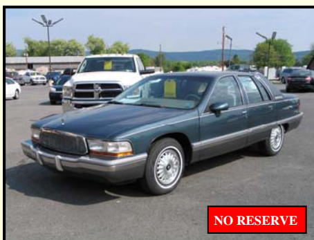
1993 Buick Roadmaster Limited Sedan

One of Carlin Worldwides original 1985 HMMWV, released from the Marine Corps in the 1990's. Less than 5,000 original miles. It is a 6.2 Liter naturally aspirated diesel with a Turbo 400 automatic. Comes with the deep fording kit in military box, 2 tops, hi-back bucket seats, HD rear bumper, front winch, brush guard and MT radials. A true piece of military history.