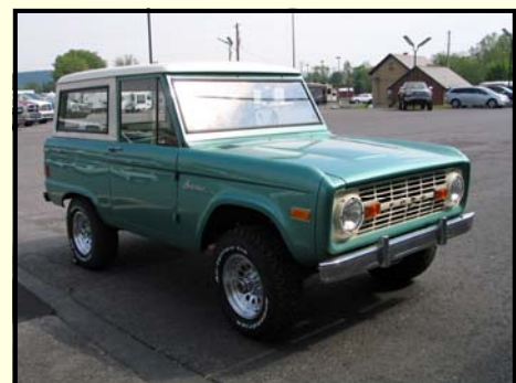
1977 Ford Bronco

This is an official Indianapolis 500 Pace Car that is new and never had a title issued. The original window sticker is still on the window and the carpet protectors from the factory are still in place. It has only 1,223 original miles. A very collectable example.