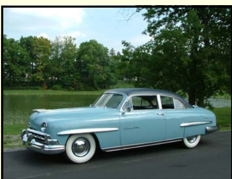
1950 Lincoln Cosmopolitan Capri

This SS El Camino is powered by a 454ci LS-5 V8 with Turbo 400 automatic. A 12-bolt posi-traction with 4.10 gears rear-end completes the driveline. It was frame-off restored and everything on the car is new. It features power steering and power brakes. This red on red with a black vinyl top El Camino is a well done restoration that runs and drives great.