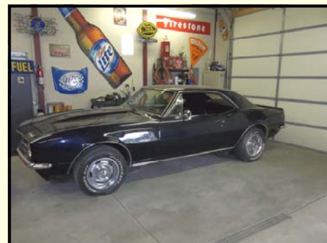
1968 Chevrolet Camaro Coupe

This R/T is not a clone. It is powered by the 440ci V8 with a six-pack. It has a white vinyl top and white stripes. Runs and drives great.