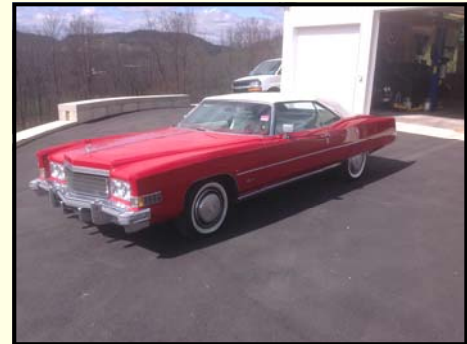
1974 Cadillac Eldorado Convertible

Believed to be 14,900 actual miles with mileage statements from the previous owner. It is the original Buick 350ci V8 engine with an automatic. A very original car with one professional repaint in the original Champagne Mist over rust free sheet metal. Lowered with front/rear springs, nothing has been cut up or altered. It can easily be put back to stock height.