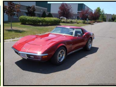
1970 Chevrolet Corvette Coupe

A custom 1955 Chevrolet with a GM crate motor that has aluminum heads. The tranny is a 700R with overdrive and the rear end is a 12 bolt Chevrolet with posi-traction. It has Vintage air, new Dakota digital gauges, cruise control, power steering, power brakes, 1-piece California bumpers and many other extras.