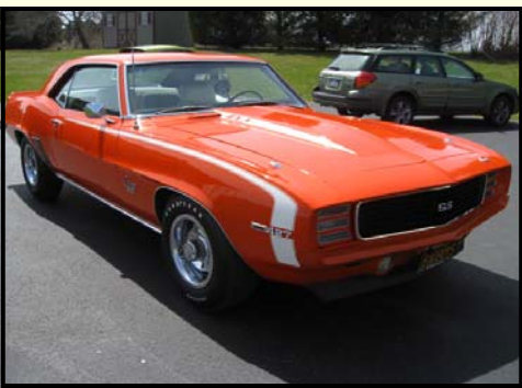
1969 Camaro RS SS ZL1 Tribute

This is an LS5 454ci V8 390hp numbers matching example with a 4-speed manual and just 33,000 original miles. It has factory a/c, AM/FM radio, tilt wheel and a saddle custom interior. It received an NCRS Top Flight award, has the NCRS shipping report and NCRS confirmation of judging. Documentation includes a window sticker, tank sticker and a protecto-plate.