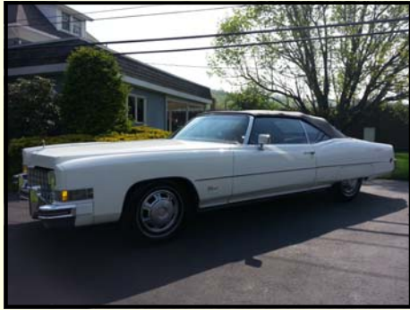
1973 Cadillac Eldorado Convertible

This is an original Eldorado that is un-restored and single family owned since new with only 32,000 miles. It has a beautiful Aztec White exterior paint with red leather interior. It is front wheel drive with all the options including power steering and brakes. It has a 500ci V8 that produces 365hp with a Turbo Hydramatic 3-speed transmission.