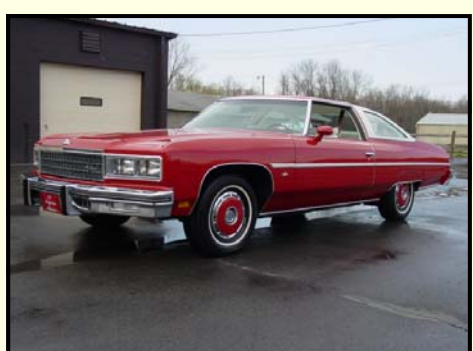
1976 Chevrolet Caprice Classic

This mild 1950's style custom Ford has been frenched, shaved and lowered. It is powered by a small block Chevrolet engine and an automatic transmission.