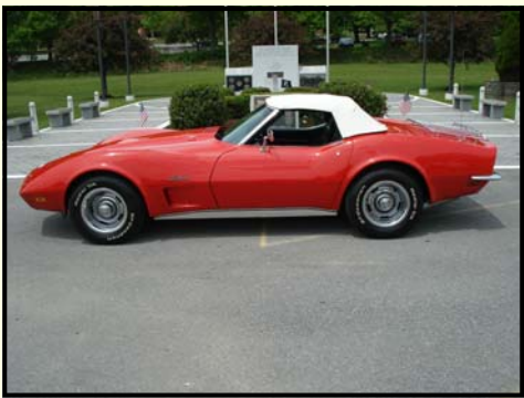
1973 Chevrolet Corvette Convertible

This last year model for the El Camino was owned and lightly driven by an 80 year old man until he recently passed away. He babied the car while he owned it. It has the 305ci V8 with a 3-speed automatic transmission. It is original and in flawless condition with 50,000 original miles.