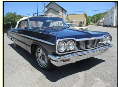
1964 Chevrolet Impala SS Convertible

A very solid southern car with a recent restoration. New paint in the original Springtime Yellow. A newer convertible top with new top pump. Very straight body with good gaps and panel fit. Starts and runs great. The 3-speed automatic shifts smoothly. The engine compartment is nicely detailed. Gets good gas mileage and is a great driver.