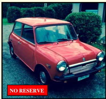
1975 Austin Mini

This REO has had the same owner for 44 years and has less than 500 miles since a professional frame-off restoration was completed. It was purchased by the current owner in 1971 and he paid $700 for it; $100 down and $100 per month until it was paid for. It was awarded the People's Choice Award by its peers at the 2004 100th anniversary of REO's homecoming in Lansing Michigan. It has a 6 Cylinder engine with a 3-speed manual transmission. Included with the car will be a 1929 REO sales brochure and an original copy of the Ladies Home Journal ad for the car. A wonderful example that is rarely seen.