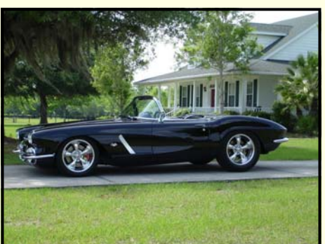
1962 Chevrolet Corvette Resto Mod

A matching numbers example with 68,000 miles. It has a 350ci V8 with an automatic transmission, leather interior, power windows, removable rear window and cold air conditioning. It is a rare red on red combination.