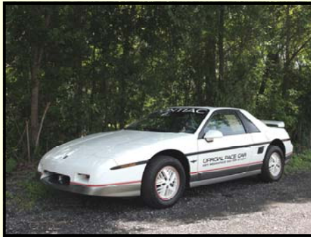
1984 Pontiac Fiero Indy Pace Car

A V8 powered example with an automatic transmission. It is black and red and shows just 49,000 miles. These are getting harder to find in this nice of condition.