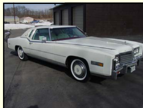
1978 Cadillac Eldorado Biarritz

This Cyclone is powered by a 289ci V8 with a 4-speed manual transmission. This car has air conditioning. It is an older restoration of a rock solid car.