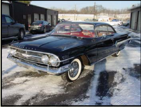
1960 Chevrolet Impala Coupe

Only 29,000 original miles on this Impala. It is 100% original with the plastic seat covers on it since new. Optional equipment includes automatic transmission, luxury wheel covers, fender skirts and factory AM radio. Mechanically this beautiful Impala is as great as it is cosmetically and it drives like the day it was bought new, 54 years ago.