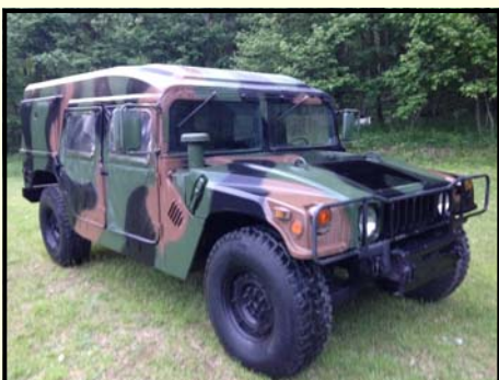
1985 AM General Hummer

This Camaro is powered by a 350ci V8 with a 4-speed manual transmission. This is a nice driver that runs and drives great.