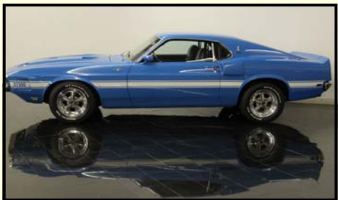
1969 Shelby GT500 Coupe

This Cobra was completed in 2013. It is like new with only 416 miles. Powered by a 1969 Ford 460ci SJC block that is balanced and blue-printed. It is built to 557ci and produces 600hp and 687 ft/lbs of torque. It comes with the engine build sheets, receipts and dyno printouts. It has a Tremec TKO 5-speed with a Centerforce clutch and a Lakewood bellhousing. This Cobra was built to perform.