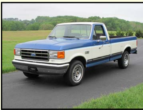
1989 Ford F150 XLT Lariat

This Galaxie is powder blue with a dark blue top. The engine is the 390ci V8 with a 4-barrel carburetor and an automatic. It has power steering, power brakes and a new aluminum radiator. It is a straight body with an older repaint that is holding up very well. It has very nice chrome and a recent new interior installed.