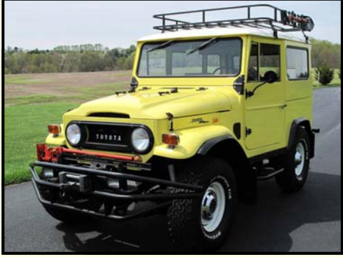
1968 Toyota FJ40

This Arizona truck is rust free and received a flawless restoration. It has been upgraded to a Chevrolet small block 350ci V8 engine and has a manual transmission. It features a roof rack, winch, brush guard, fog lamps, black vinyl interior and BF Goodrich All Terrain T/A tires. A spectacular truck that's ready for the outback!