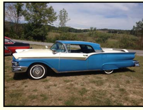
1957 Ford Skyliner Retractable

This beautifully restored Cadillac is finished in Gloss Green. It has the original 331ci 4-barrel V8 engine that has been rebuilt as was the original Hydramatic transmission. A very nice driving example that has 75,287 miles which we believe are original, but the Pennsylvania title reads exempt due to age.