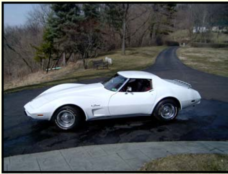
1975 Chevrolet Corvette Coupe

This was a dry California car that has had a complete engine and transmission rebuild from 914 LTD in July 2012 with receipts totaling over $7,000. The engine is the 2.0 Liter 4-cylinder with Bosch fuel injection and the transmission is a Porsche 5-speed manual. It runs and shifts like new and is as close to stock as they come.