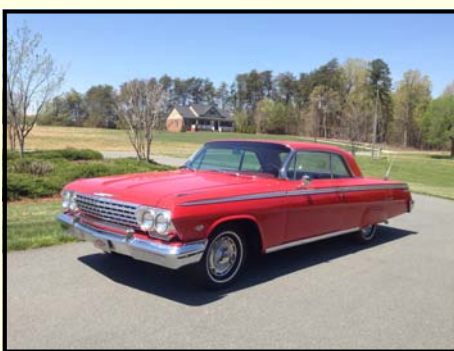
1962 Chevrolet Impala SS

Frame-off restoration of an Oklahoma car, finished in 2013 with only 3,500 miles since. Frame/suspension were completely sandblasted and powder coated. All sheet metal was soda blasted and powder coated with a base coat/clear coat. The engine is a 350ci V8 crate motor with 300hp and a rebuilt 400 automatic transmission. Over $60,000 spent on the restoration.