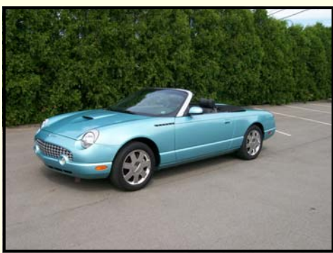
2002 Ford Thunderbird Roadster

This Fastback has Fords famous 302ci V8 engine. It has an automatic transmission and air conditioning. This car has been owned by the same family for over 37 years. It has been garage kept during that time and is in marvelous shape.