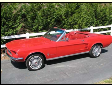
1967 Ford Mustang Convertible

Featured in Canyon Red with 30,290 miles. The car is in its original condition and received the "Historic Preservation of Original Features" from the AACA. The car is rare as only 900 out of 95,000 were sold under the Hudson badge. The rest were sold as a Nash. Same owner since 1989 and prior to that it had been stored in a barn in Idaho since 1963.