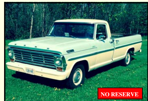
1967 Ford Pickup

A fun and reliable Mini with only 47,338 original miles. It has a 4 cylinder engine with a 3-speed manual. These Minis are gaining popularity in the collector car world.