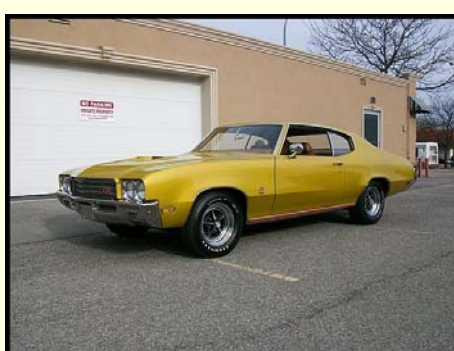
1971 Buick GS455

A correct coded 440ci V8 engine with a fresh rotisserie restoration in the correct colors. A real R/T and very desirable.