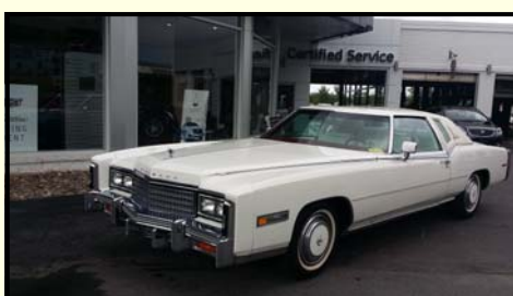
1978 Cadillac Eldorado Biarritz

Gorgeous in Medium Sapphire Blue, this terrific example has under 8,000 original miles. It is from an avid Cadillac owners private collection and has blue leather interior.