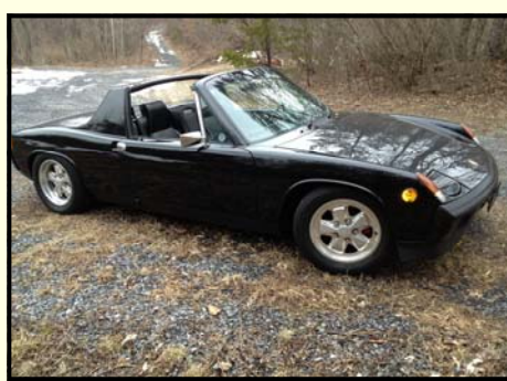
1972 Porsche 914-6 Conversion

A West Virginia car, this Torino was sold by the previous owner who later regretted selling the car so he tracked it down and bought it back. Upon his passing, the current owner purchased the vehicle from his estate. It has just 58,151 original miles. The 429ci V8 engine is mated a 4-speed manual. A very clean example.