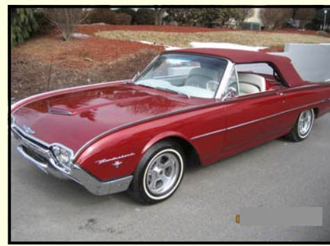
1962 Ford Thunderbird Sport Roadster

This is an original and unmolested Oldsmobile Starfire Coupe with only 17,900 miles. It is powered by the 393ci V8 with an automatic transmission. Looks like it just came out of the showroom. It has always been in heated storage.