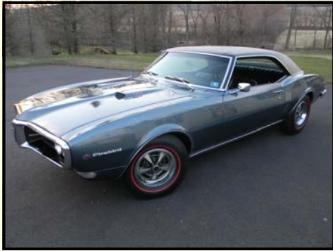
1968 Pontiac Firebird Coupe

This is an original, un-restored and all numbers matching example with 1 re-paint in 1984. It has just 72,050 original miles and has had the same owner since 1970. This fine example is still on its 1970 title. It is PHS documented and a rare find. Powered by the 400ci V8 with 330hp and a 4-speed manual. The Firebird market is hot right now and this is one not to miss.