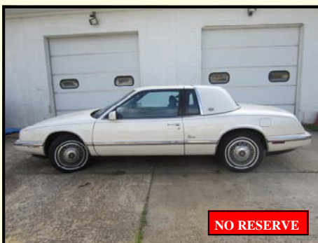
1990 Buick Riviera

This was the first new Beetle off the ship in this country. It was delivered to David Michael Volkswagen in Freehold, New Jersey. Unfortunately the paperwork from Volkswagen was lost during the 16 years it was in storage. It is white with gray cloth interior. This car is as new and was never sold.