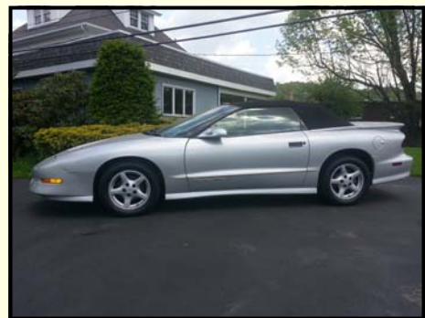
1995 Pontiac Trans Am Convertible

A 5.3 V12 engine with an automatic transmission and 77,000 miles. It has all power options and a beautiful sporty red exterior with a new black fabric top and new black leather interior. It runs perfectly.