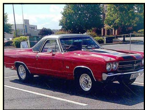
1970 Chevrolet El Camino SS

The engine is the 327ci with a Power Glide automatic and power steering and power brakes. Also, has dual antennas, front/rear bumper guards, stainless rocker molding's and dual exhaust. This beautiful Roman Red example also has dual exhaust, AM/FM radio and the original owner's manual. This terrific example drives as good as it looks.