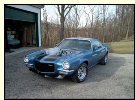
1973 Chevrolet Camaro Z/28

This 914 was converted to a 2.2 liter from a 1971 911. It has a 5-speed trans with a Rennshift short-throw shifter. This was a CA car. It has a carbon fiber hood, carbon fiber trunk, carbon fiber interior accents, 911 front suspension and a 5-bolt rear suspension. The wheels are nicely polished Fuch's. Fast and fun.