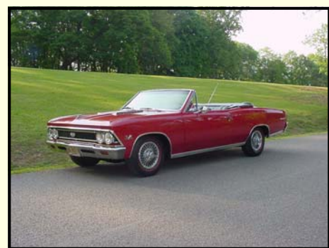
1966 Chevrolet Chevelle SS Convertible

This Roadster has a 327ci V8 with a 4-speed manual transmission. It is an older restoration that runs and drives excellent. Comes with both the hardtop and soft top. A very desirable Corvette.