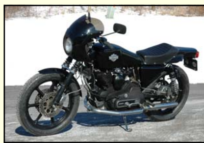
1977 Harley-Davidson XLCR Café Racer

This gorgeous car has been cosmetically restored and options include the 428ci Cobra Jet engine and a 4-speed manual. This car was ordered in Milwaukee, WI and was a very late production vehicle. All original identification tags and date-coded components remain on the vehicle. It is easy to appreciate this wonderful kept example, now showing 79,946 original miles.