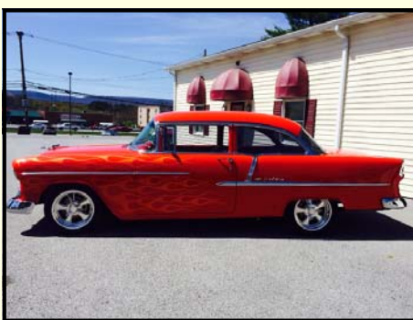
1955 Chevrolet Bel Air 2 Door Sedan

A low mileage and very nicely done original car. It is extremely sharp in its beautiful color combination. It is hard to find these 2 Door hardtops in this condition.