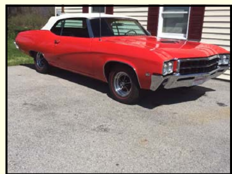
1969 Buick Skylark GS 400 Convertible

This nicely restored example is as sharp as they come with well over $100,000 spent on it. It has air conditioning and lots of custom features. It is a fine running and driving custom.