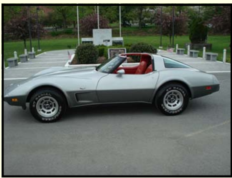
1978 Corvette Silver Anniversary Edition

This Retractable has the 312ci V8 with an automatic transmission. It features power steering, power brakes, power windows, power seat, dual spotlights, hockey sticks and a continental kit. It runs and drives like new.