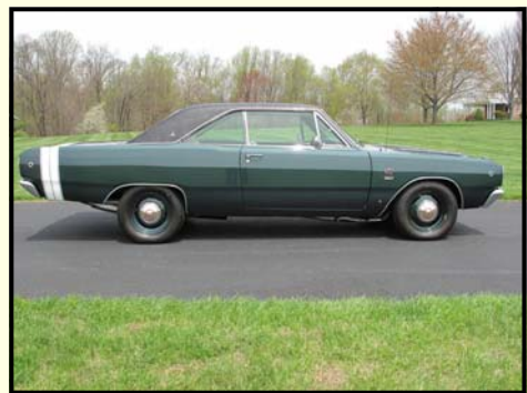
1968 Dodge Dart GTS

As expected, this lovely Park Avenue Sedan DeVille is fully equipped from the factory with such amenities as power windows, Autronic-Eye, power brakes and steering. The silver-green upholstery is in great shape and stands out against the Ebony exterior. The overall fit and finish is that of a low mileage, well-preserved automobile.