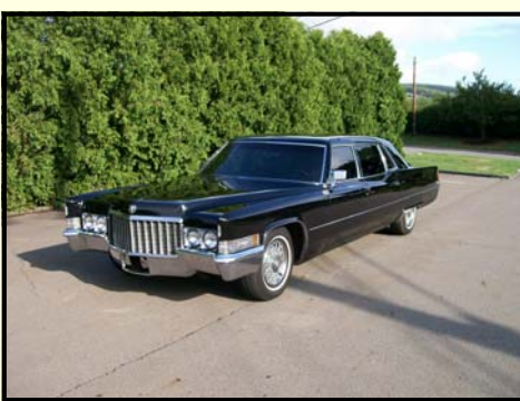
1970 Cadillac Fleetwood 75 Factory Limo

This T-Bird is in stunning Thunderbird Blue. It has the hardtop and soft convertible top. It is exceptionally clean. It has only 16k miles from new. Runs and drives like the day it was new! A must have for any collector.