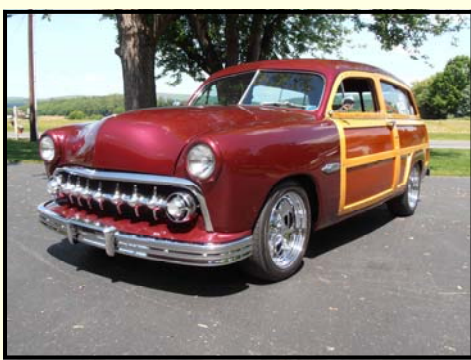
1949 Ford Woody Station Wagon

This GTS was born with a 383ci V8 and was upgraded to a 440ci with a six-pack carburetor set-up, automatic transmission and gear vendors overdrive. Plenty of power for this Dart and a blast to drive.