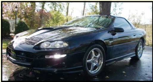
1999 Chevrolet Camaro SS

A gorgeous C-4 Corvette built to commemorate the 35 th anniversary of the Corvette. It has been in storage since 2011 and is a very nice example. It has lots of engine chrome pieces and a super clean suspension. The white leather interior is in very good original condition.