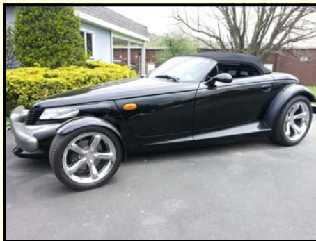
1999 Plymouth Prowler

This is an original Eldorado that is un-restored and single family owned since new with only 32,000 miles. It has a beautiful Aztec White exterior paint with red leather interior. It is front wheel drive with all the options including power steering and brakes. It has a 500ci V8 that produces 365hp with a Turbo Hydramatic 3-speed transmission.