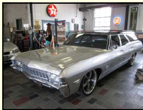
1968 Chevrolet Impala Station Wagon

An original truck that is 95% rust free and has less than 20k miles. It has a rebuilt 350ci engine and automatic transmission. A new interior, new tires, all new chrome, cold air conditioning, power steering, power brakes and a wood bed.