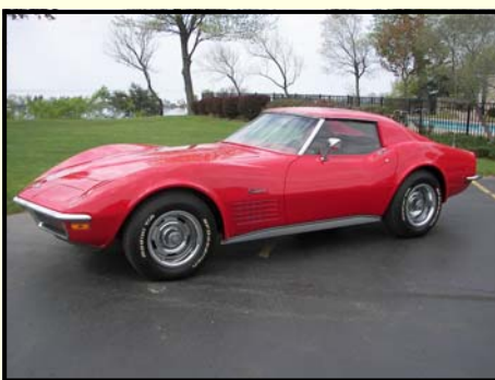
1972 Chevrolet Corvette Coupe

This is a very nicely done street rod. Well sorted out and ready to drive cross country. Powered by a 327ci V8 with an automatic transmission.