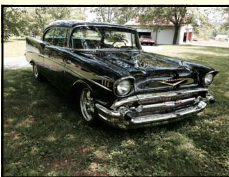
1957 Chevrolet Bel Air Resto Mod

A 1 owner Cadillac with 41,000 original miles. It has the original paint, top, interior and engine. Powered by the legendary 429ci 340hp V8 with an automatic transmission, this DeVille will cruise all day long. It has factory air conditioning, power seats, power steering and power brakes. Comes with the original buyers order.