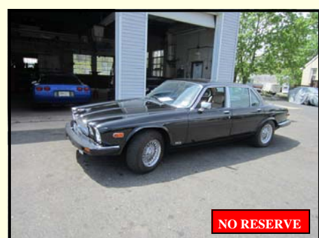
1987 Jaguar XJ6 Vanden Plas Sedan

This is a fast and fun driver that was an original Arizona car. It has the 454ci 365hp V8 with a 4-speed Muncie manual transmission. Options include 12-bolt posi-traction rear-end, power steering, power brakes, tilt steering wheel and factory air conditioning. A good looking and desirable El Camino.