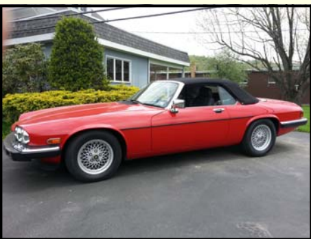
1989 Jaguar XJS Convertible

49,000 original miles on this original Emerald Turquoise paint. It has a matching numbers engine, transmission and rear; 396ci 325hp with a 4-speed manual, 3.31 12-bolt posi. Has a bench seat and the original shifter with lots of paper work from the owner who bought it new. Nice tight driver.