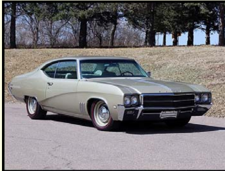
1969 Buick Skylark Coupe

A very nice Jeep from North Carolina. It is 100% rust free and the original steel body. The original engine is the 304ci V8 with a 3-speed manual transmission and is a 4x4. Factory red color and a hardtop.