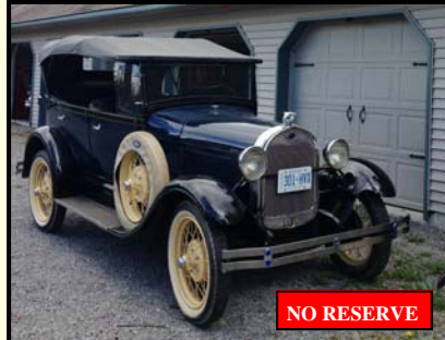
1929 Model A Ford Phaeton

With only 19,000 original miles, this might be one of the lowest mileage examples. It was stored for 35 years in climate controlled garage and has won many awards. It has an 8 cylinder with an automatic transmission. It starts runs and drives like new