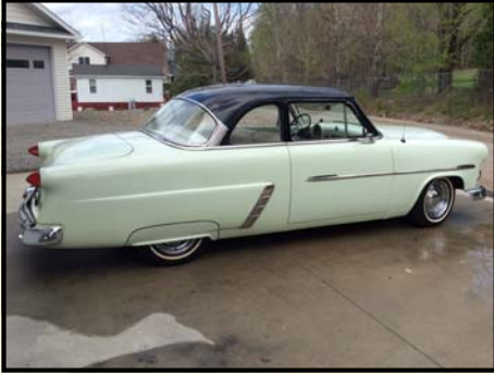
1953 Ford Custom

This mild 1950's style custom Ford has been frenched, shaved and lowered. It is powered by a small block Chevrolet engine and an automatic transmission.