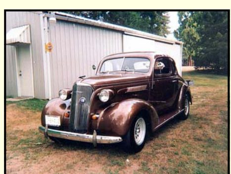
1937 Chevrolet Business Coupe Deluxe

1 of 1,381 GS455 hardtops produced in 1971. It has a factory installed, matching numbers TR code 455ci 315hp V8 with a Turbo 400 automatic. Received a concours quality professional restoration in 2013 with only 140 miles since. Comes with original protecto-plate, original owner's manual, and extensive photos of the restoration by a lifelong Buick collector.