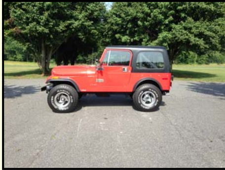
1979 Jeep CJ7

A very nice Jeep from North Carolina. It is 100% rust free and the original steel body. The original engine is the 304ci V8 with a 3-speed manual transmission and is a 4x4. Factory red color and a hardtop.