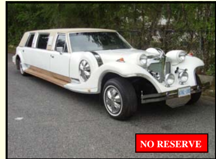
1988 Excalibur Limo

This Model A has less than 200 miles on it since its complete frame-off restoration. The engine is a 4 cylinder with a 3-speed manual transmission. The engine was specially re-machined and balanced. It was originally a Texas car.