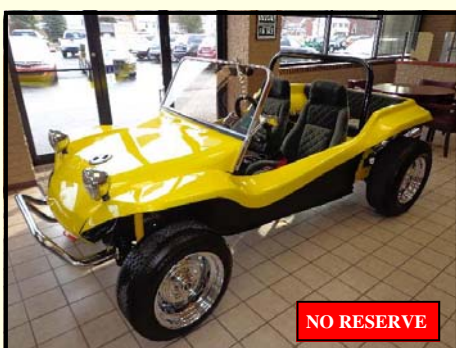
1972 Volkswagen Dune Buggy

This fun little roadster has 8,327 original miles. It has a Volkswagen 4 cylinder engine and a 4-speed manual transmission. Comes with Michelin tires, AM/FM cassette, side curtains, heater, rear spare, luggage rack, fender mounted mirrors and fog light. These were built by British Coachworks Limited and are delightful to drive.