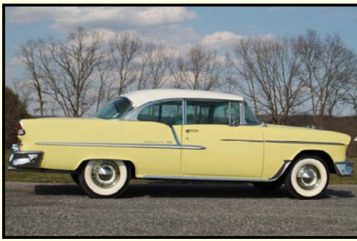
1955 Chevrolet Bel Air 2 Door Hardtop

This mild Custom Montclair has dummy spots, bubble skirts, lakes pipes and a continental kit. The engine is the 312ci V8 with an automatic transmission. An old school hot rod ready to go cruising.