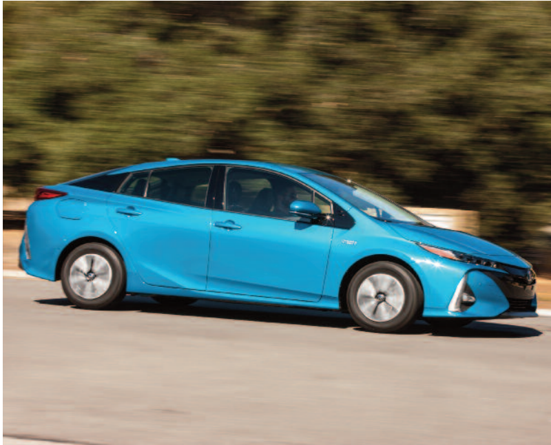
2017 Toyota Prius Prime

I recently had the perfect test model for a road trip to Austin with the 2017 Toyota Prius Prime. It's always great to have a vehicle that doesn't require multiple stops at the gas pump, and the Prius Prime more than fit the bill.