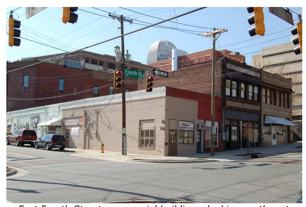
East Fourth Street commercial buildings, looking southwest