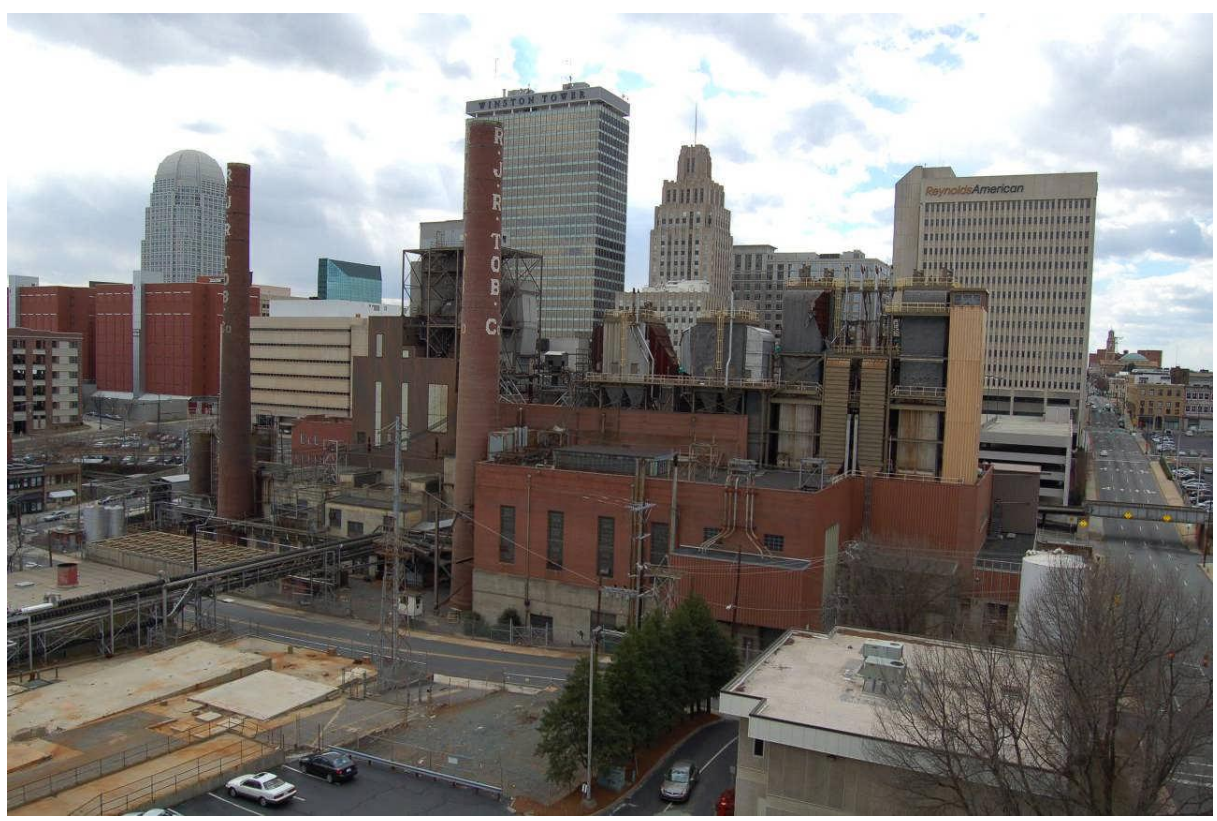
Bailey Power Station, east elevation