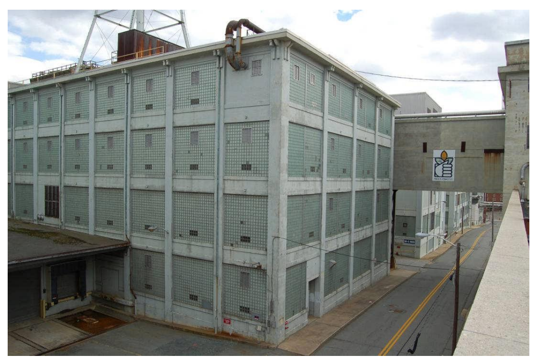
Factory 90 and pedestrian bridge to Factory 91, looking southeast

Winston-Salem, Forsyth County, FY3151, Listed 8/05/2009 Nomination by Jen Hembree Photographs by Jen Hembree, February 2008