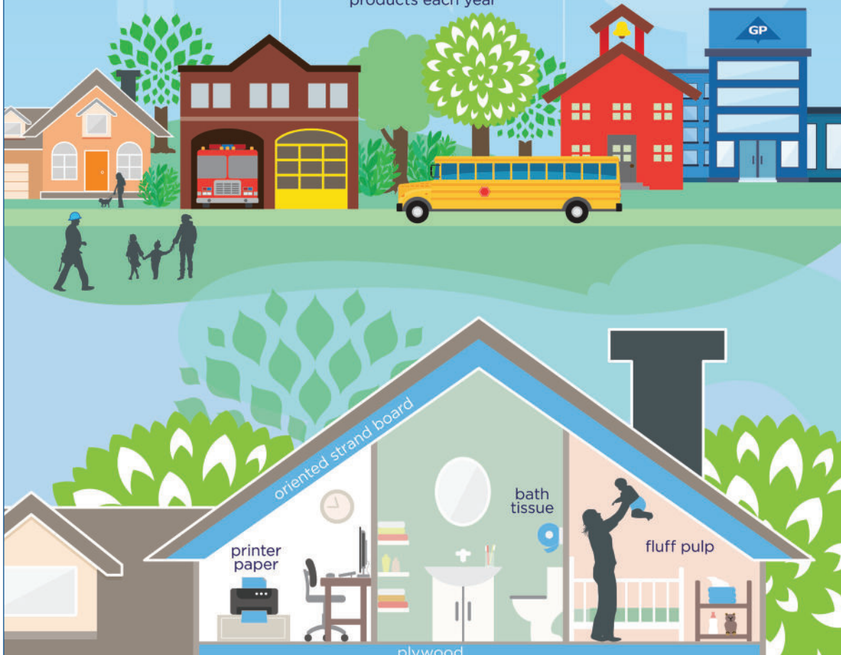
An illustration showing the use of Georgia-Pacific's products throughout the home. Courtesy of Georgia-Pacific.

earnings reinvested back into the business for growth