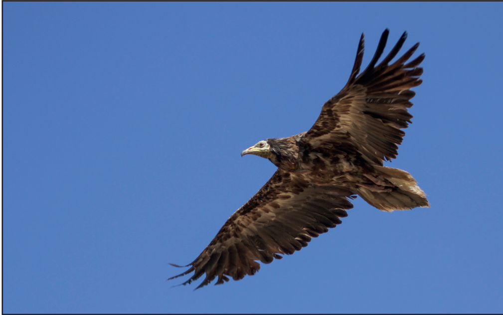
Plate 2. Immature Egyptian Vulture Neophron percnopterus , Ethiopia.

Unfortunately, the amount of time that we spent at the two point-count locations that were either known to be or predetermined to likely be bottlenecks for migrant Palearctic raptors, Ras Siyan Peninsula in Djibouti and Abomsa in Ethiopia, was very limited. We could only visit the Ras Siyan Peninsula once on 2 September 2017, from 09:09 to 11:39 hours, during which time period we logged only four raptors (two Peregrine Falcons Falco peregrinus , one Montagu's Harrier Circus pygarrus , and one Osprey Pandion haliaetus ). Meanwhile, over two partial days (25–26 September 2017) of observation at Abomsa, no Palearctic migrant raptors were recorded.