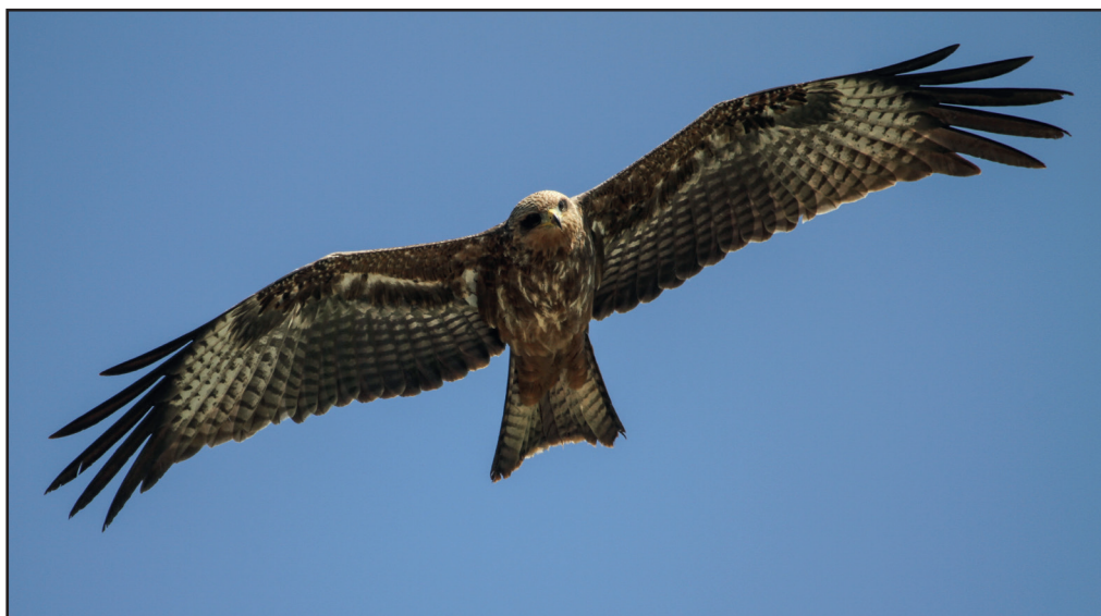
Plate 1. Black Kite Milvus migrans of the subspecies lineatus , Ethiopia.