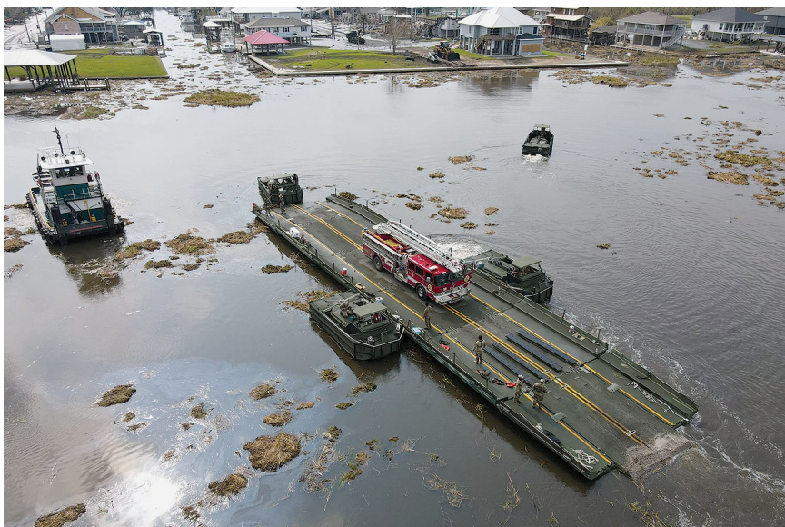
Louisiana Army National Guard soldiers from the 2225th Multi-Role Bridge Company ferry a fire truck following Hurricane Ida, September 2021.

Significant snow and ice accumulations, combined with low temperatures, led to power outages and disrupted transportation. In response to this winter weather, on 26 February 2021, 2,369 ARNG personnel provided assistance in Texas, Louisiana, Arkansas, Kentucky, and Ohio.