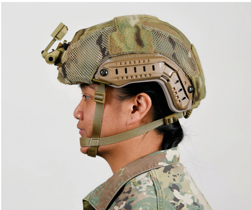
A long-haired soldier wearing tactical headgear poses for an example photo to illustrate one change in Army grooming and appearance standards.

personnel. The agency then produced an outreach and engagement plan to provide senior leaders with a framework for targeting strategic engagement opportunities in support of The Army People Strategy .