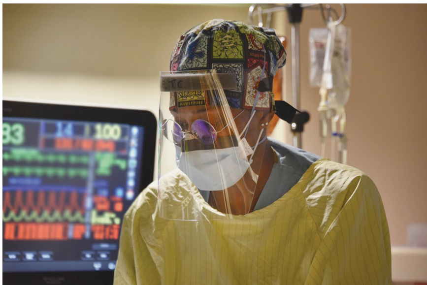
A nurse with Army Reserve Urban Augmentation Medical Task Force 328-1 at the Yuma Regional Medical Center in Yuma, Arizona, January 2021

deployed in Utah, California, Kentucky, New York, Wisconsin, Arizona, and New Mexico. Two UAMTFs remained active until June 2021, providing assistance to the Yuma and Navajo nations in New Mexico and Arizona. In March 2021, the USAR began planning for vaccination augmentation medical task forces, but no task forces were established because either most communities had adequate numbers of healthcare workers to deliver the amount of vaccines available or governors mobilized elements of their ARNG for this mission.