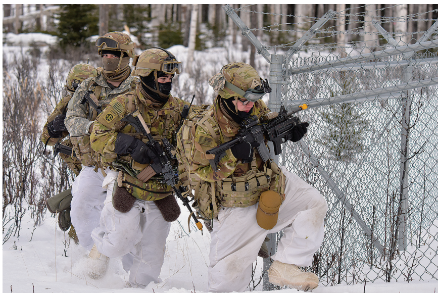
Soldiers from the 3d Battalion, 509th Infantry Regiment, during Exercise ARCTIC WARRIOR 21, February 2021

to engage with America's allies and partners who operate in extreme cold weather and in mountainous and high-altitude environments. In accordance with the objectives set out in the paper, units participated in several exercises in Alaska during FY 2021, including ARCTIC WARRIOR 21 and NORTHERN EDGE 21, in order to test the Army's new Arctic concepts and identify capability gaps.