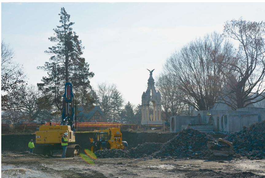
Land reclamation work at the West Point cemetery

and maintains gravesite accountability; provides technical guidance, training, staff assistance, and inspections; adjudicates burial exceptions, disinterments, and expansion requests; and handles other issues of concern at Army cemeteries.