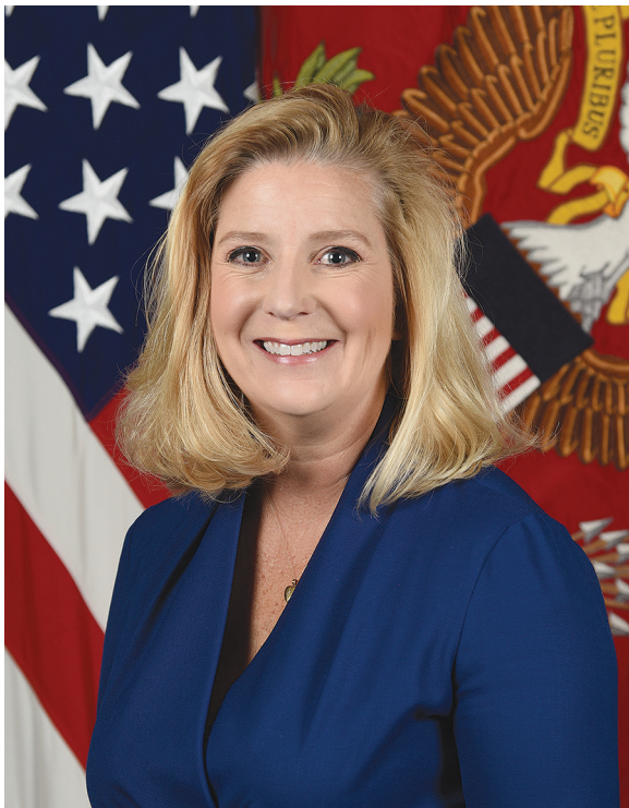
Secretary of the Army Christine E. Wormuth