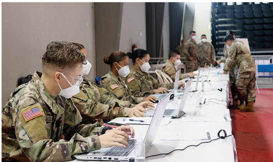
Puerto Rico Army National Guard soldiers enter data into the Immunization Information System at the Salvador Dijols Coliseum in Ponce, Puerto Rico, February 2021.

Military support to civilian authorities continued during FY 2021, and, as during FY 2020, the ARNG provided most of the soldiers deployed for this mission. The service continued to send urban augmentation medical task forces (UAMTFs) to assist hard-pressed civilian hospitals. Between February and June, Regular Army (RA) personnel operated vaccination centers, a mission many governors also assigned to their ARNG units.