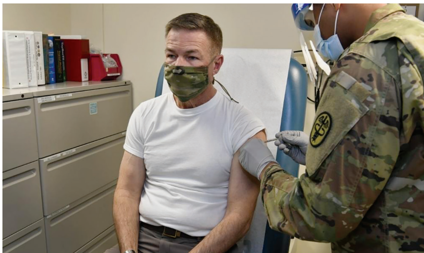
U.S. Army Chief of Staff General James C. McConville receives his first dose of the COVID-19 vaccine.

unable or unwilling to do that would be required to wear a mask, physically distance, comply with a regular testing requirement, and be subject to official travel restrictions. By that same month, approximately 68 percent of the Army's active duty personnel had received at least one dose of a COVID-19 vaccine. Vaccination rates in the reserve components were significantly lower.