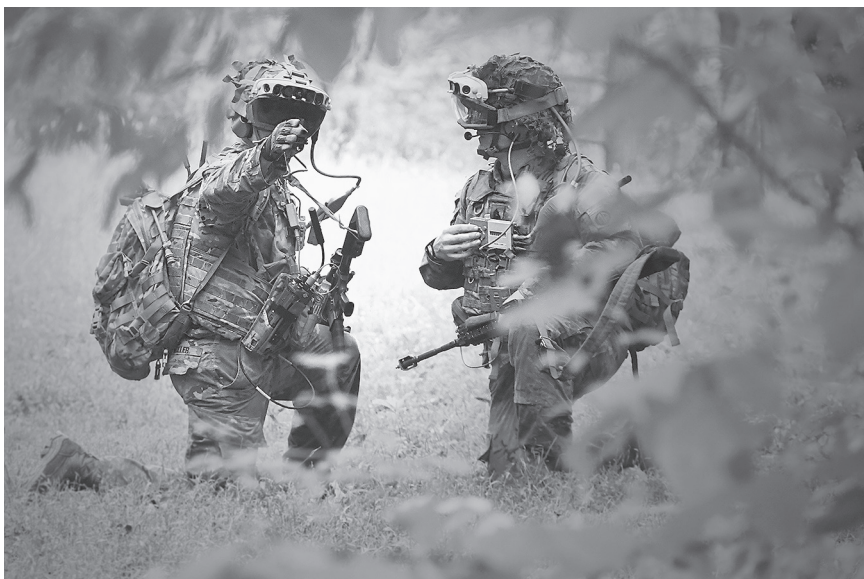
Soldiers from the 82d Airborne Division use a prototype Integrated Visual Augmentation System at Fort Pickett, Virginia, October 2020.

low-collateral effects, that is, they explored methods to limit damage to friendly forces near the intercept area.