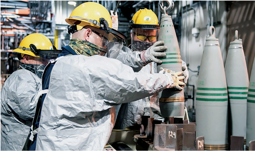
Operators place a 155-mm. projectile containing VX nerve agent in a tray to begin the destruction process at the Blue Grass Army Depot.

Destruction of blister-agent-filled 105-mm. howitzer projectiles began at Pueblo Chemical Depot in December 2020. Blue Grass Army Depot completed destruction of blister-agent-filled 155-mm. howitzer projectiles using the static detonation chamber in September 2021. Blue Grass Army Depot destroyed all its VX-nerve-agent-filled 155-mm. howitzer projectiles between January and May 2021. The depot then started destroying VX-nerve-agent-filled M-55 rockets in July. By the end of FY 2021, the program had destroyed 70.9 percent of the chemical agents at the two depots. The National Defense Authorization Act for Fiscal Year 2016 set 31 December 2023 as the deadline for destruction of all U.S. chemical weapons.