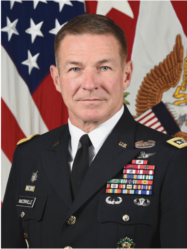
General James C. McConville Chief of Staff of the Army