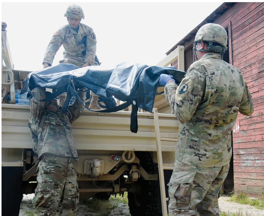
Soldiers from the Army Reserve's 246th Quartermaster Company train at Joint Base McGuire-Dix-Lakehurst, New Jersey, August 2021.

North Dakota. By 10 August, twelve states had 1,270 ARNG personnel engaged in fighting wildfires. Cooler weather the next month led to a decrease in fires, and on 29 September, only 384 ARNG personnel were engaged in wildfire missions.