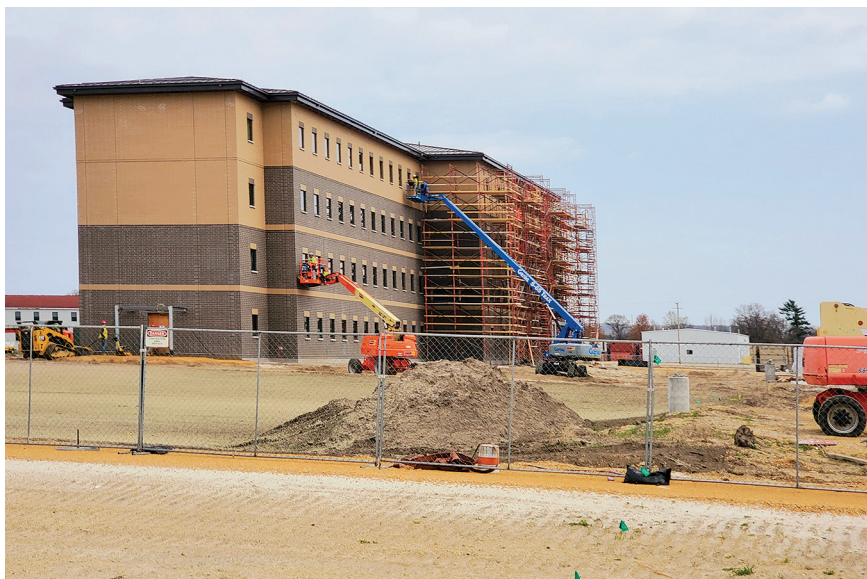
Construction of a new transient troop training barracks at Fort McCoy, Wisconsin, April 2021

performance thresholds required to remove the constraints imposed by the lender on development expenditures. A two-building hotel opened at Fort Jackson, South Carolina; construction resumed on a new hotel at Aberdeen Proving Ground; and renovations of existing hotels restarted Army-wide. Hotel services remained subject to restrictions and staffing shortages, however, and inflation became a concern. A Government Accountability Office study released in February 2021 reported that since beginning to privatize its domestic on-post hotels in 1996, the Army had made many improvements, including replacing lodging facilities with newly constructed hotels. However, improvements took longer than anticipated, development plans changed, and the service did not include key information about delays and alterations in its reports to Congress. Beginning in July 2021, Operation ALLIES WELCOME used a hotel at Fort Lee to house Afghan refugees.