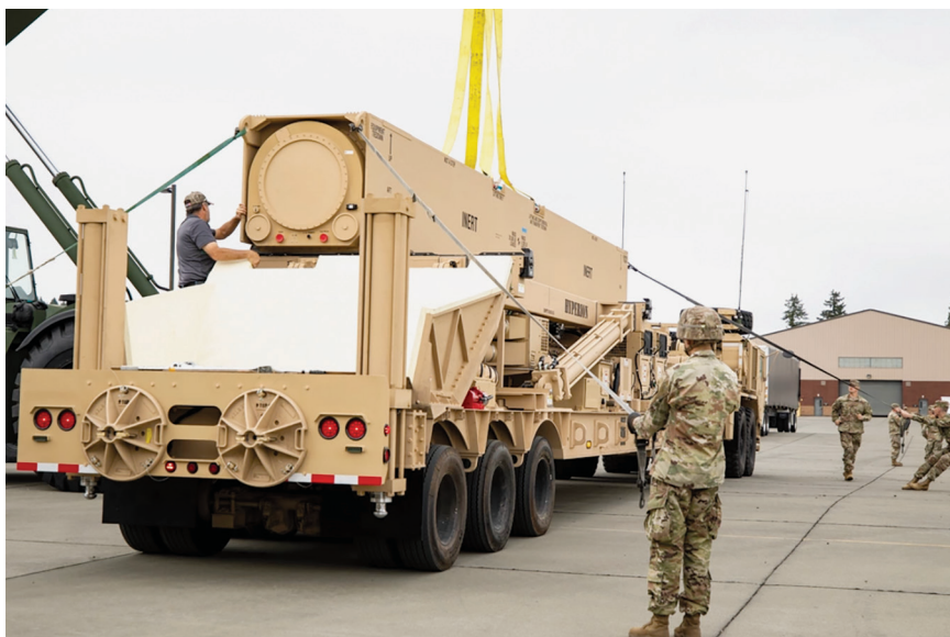
Delivery of the prototype Dark Eagle firing battery ground equipment to the 5th Battalion, 3d Field Artillery Regiment, at Joint Base Lewis-McChord, Washington

Texas, mounted on U.S. Army heavy expanded-mobility tactical trucks. To operate Iron Dome, the Army converted a Terminal High Altitude Area Defense battery and activated a new battery using resources from the Air Defense Artillery School. Members of the Israeli Missile Defense Organization led the batteries' training on the system. In August 2021, one battery successfully engaged eight cruise missile surrogate targets at the White Sands Missile Range in New Mexico.