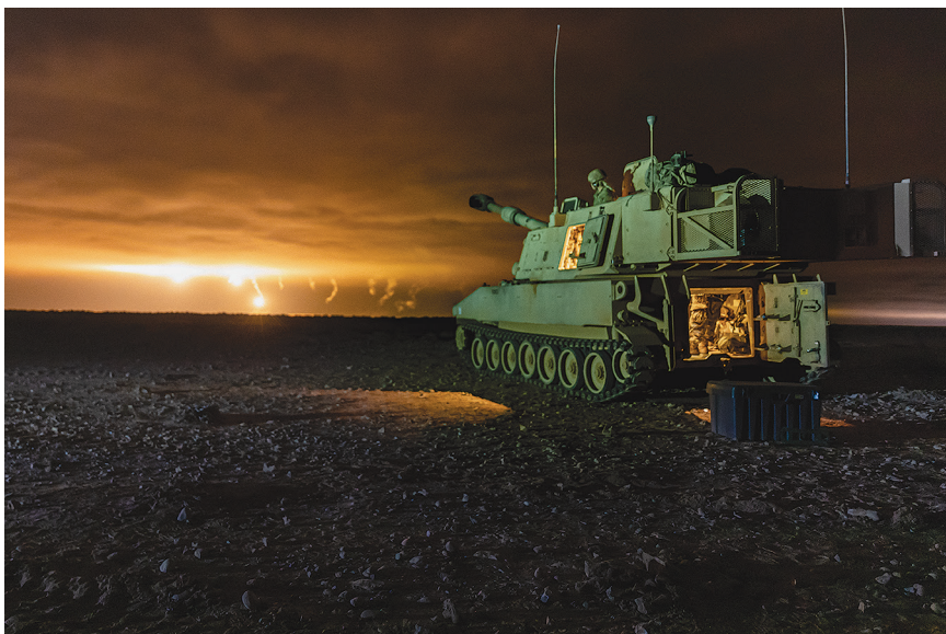
An M109A6 Paladin howitzer from the 1st Battalion, 214th Field Artillery Regiment (Georgia Army National Guard), during AFRICAN LION 2021, June 2021

Support Brigade; the 66th Military Intelligence Brigade; the 30th Medical Brigade; the 44th Signal Battalion; and the Joint Multinational Readiness Center, 7th Army Training Command. U.S.-based units that participated included elements of the 3d BCT, 82d Airborne Division, and ARNG soldiers from Florida, Utah, Georgia, and Wyoming. In June, the V Corps conducted a command post exercise as part of DEFENDER-EUROPE 2021.