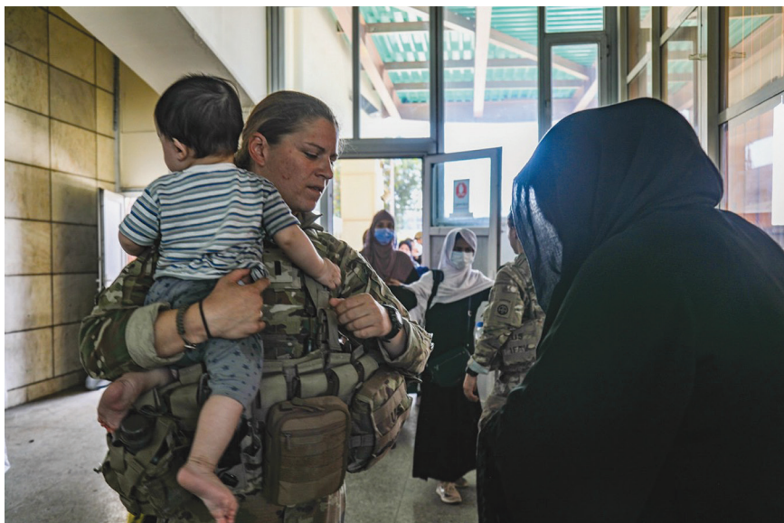
A medical officer from the 82d Airborne Division during evacuation operations at Hamid Karzai International Airport in Kabul, Afghanistan, August 2021