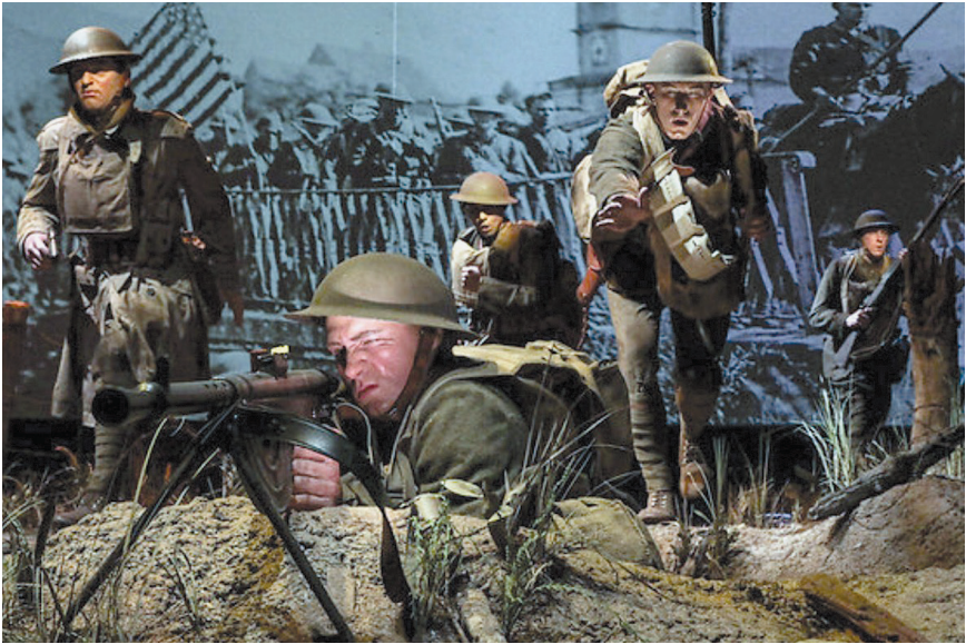
The Nation Overseas Gallery at the National Museum of the United States Army

carry out its presidential-support mission and had only a limited capability for quality assurance reviews and shipping and receiving of industrial tools needed for the manufacturing of insignia. The flood submerged approximately 30 percent of the steel dies needed to make military insignia and heraldic products. By the end of FY 2021, remediation processes had stabilized the corrosive effects of the water permeation, but much work remained to restore the tools to their preflood condition.