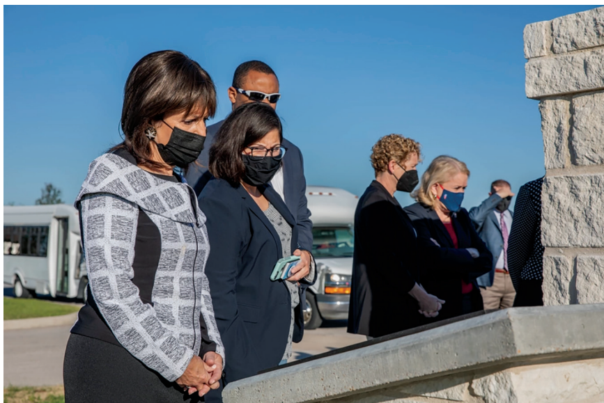
Members of a congressional delegation view a commemorative plaque at the Vanessa Guillén Gate at Fort Hood, Texas, May 2021.

for their congressional testimony. The insurrection at the Capitol in January 2021 triggered hearings by the Senate Committee on Homeland Security and Governmental Affairs, the Senate Committee on Rules and Administration, and the House Committee on Oversight and Reform about the DoD and the HQDA responses to requests for activating the D.C. National Guard on that day. The independent review of conditions at Fort Hood released in December 2020 resulted in additional hearings by the House Armed Services Committee's Military Personnel Subcommittee and a congressional delegation escorted by legislative liaisons in May 2021 to assess the situation at the installation. The office continued to seek congressional support for Army initiatives including updated sexual harassment and sexual assault policies, the Army Combat Fitness Test, and military health system reforms. During Operation ALLIES WELCOME, the office provided liaison staff at six installations to support the Department of Homeland Security, facilitating more than a dozen congressional and congressional staff delegation visits.