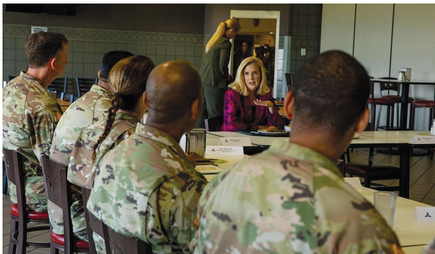
Secretary of the Army Christine E. Wormuth speaks with soldiers at Fort Hood, Texas, June 2021.

operating agency of the Office of the Assistant Secretary of the Army (Manpower and Reserve Affairs). The office will continue to coordinate the Army's national marketing and advertising strategy, maintain relationships with the marketing and advertising industry, and develop marketing expertise and talent within the Army. This reassignment was not a physical move, as the office remained in Chicago, Illinois.