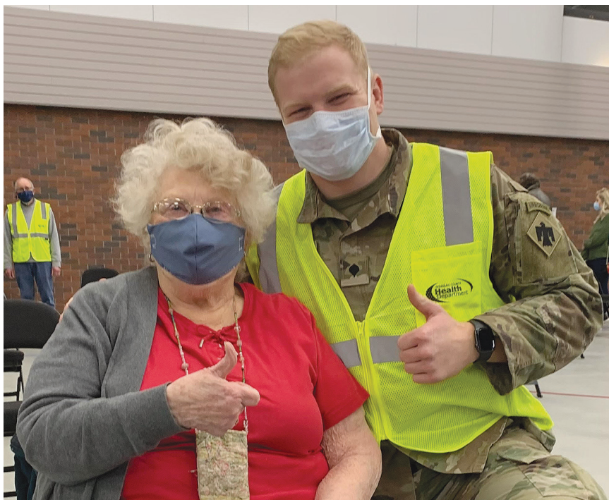
A soldier from the Nebraska Army National Guard and his grandmother, to whom he had administered a COVID-19 vaccine

15,438 ARNG personnel were serving on pandemic related missions. Rising infection rates led to further activations; by 1 March, 24,439 ARNG soldiers supported COVID-19 missions. The remainder of the fiscal year saw a decline in ARNG use; at the end of FY 2021, there were 10,880 ARNG personnel on duty for COVID-19 missions.