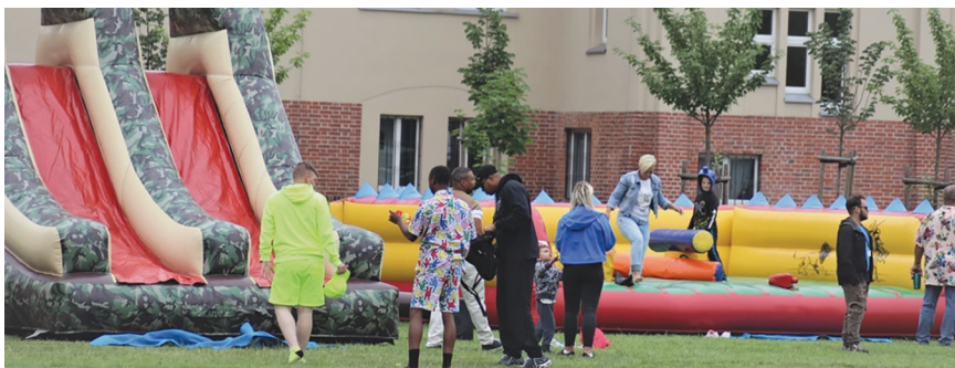
Area Support Group Poland MWR hosts the 4th of July family fun day in Poznań, Poland.

child development centers remained open, but operated at reduced capacity, typically at 50 to 75 percent of pre-COVID-19 capacity, to reduce spread of the virus. In addition to other measures to improve quality, availability, and affordability of childcare, direct care staff received a pay increase as part of a DoD-wide effort to retain such valuable employees.