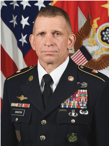
Sgt. Maj. Army Michael A. Grinston Sergeant Major of the Army