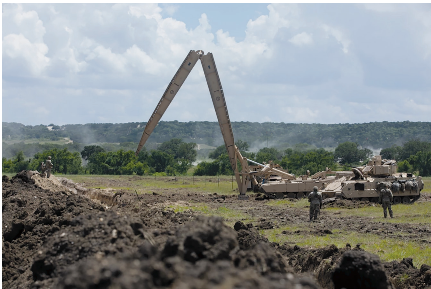
A Joint Assault Bridge during a combined arms breach exercise, Fort Hood, Texas, June 2021

troops from the 82d Airborne Division conducted a soldier vehicle assessment of the prototypes, and the Army completed its live-fire test and evaluation of them. The limited-user test of the vehicles began in September 2021 and will continue into FY 2022. The Army expects to make its low-rate production decision for the program in the third quarter of FY 2022 and field the system to units beginning in FY 2025.