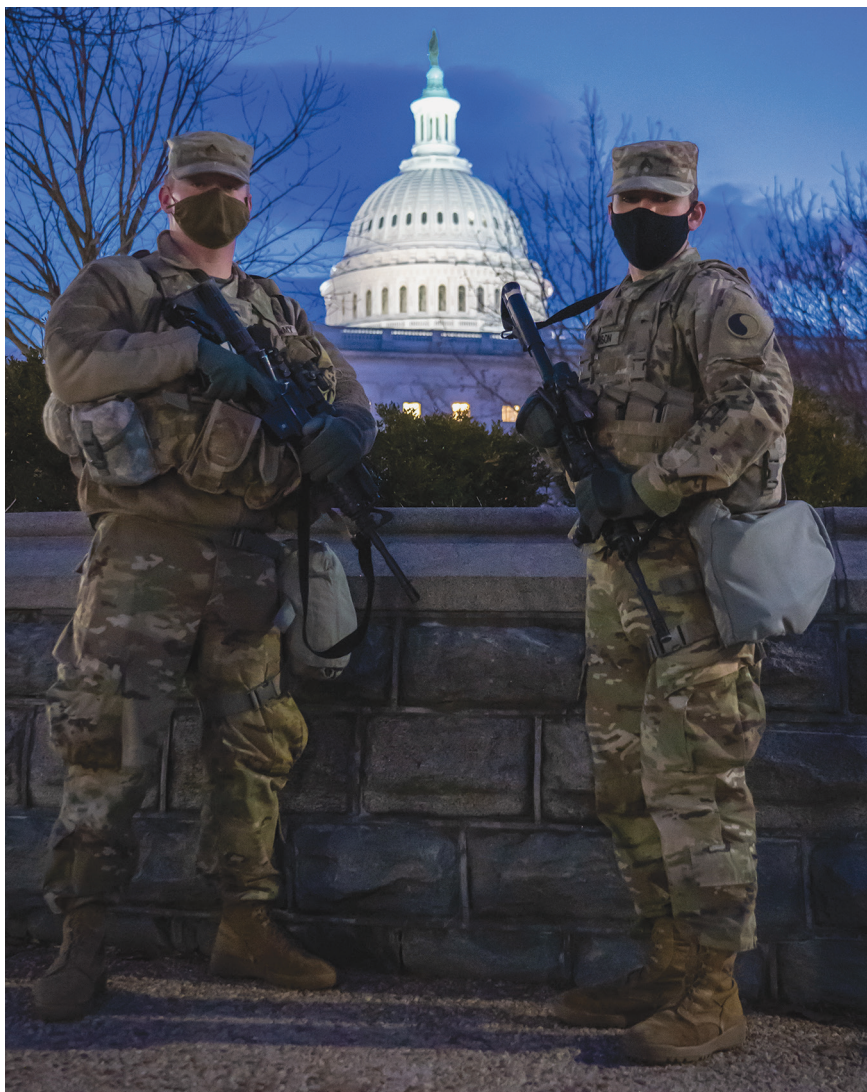
Kentucky Army National Guard soldiers deployed to defend the 59th Presidential Inauguration in Washington, D.C., January 2021.

On 6 January 2021, a mob of the president's supporters attacked the Capitol Building in an insurrection that sought to prevent the Congress from certifying the election of Joseph R. Biden Jr. as the next president of the United States. In the early afternoon of 6 January, in response to urgent requests for assistance from D.C. civil authorities, the secretary of