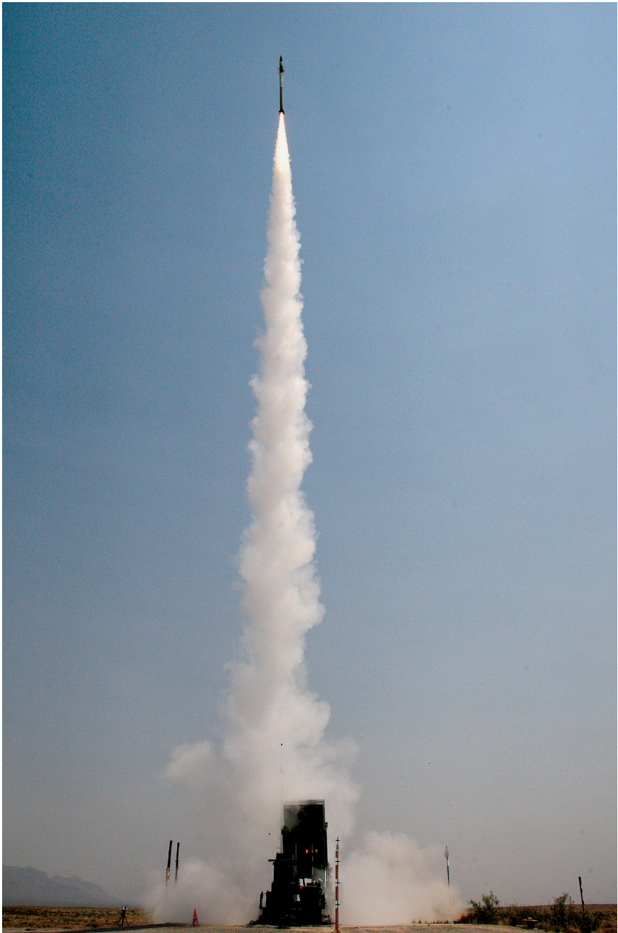
Iron Dome firing at White Sands Missile Range, New Mexico, June 2021