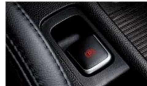
EPB (electronic parking brake) Engage the parking brake simply by pressing a button and take all of the guesswork out of knowing whether it's properly engaged or not.