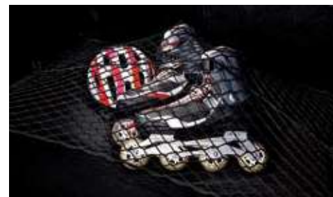
Cargo net A handy cargo net can be fastened using convenient hooks to prevent items such as sporting equipment from rolling around.