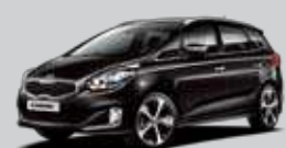
Black Cherry (9H)