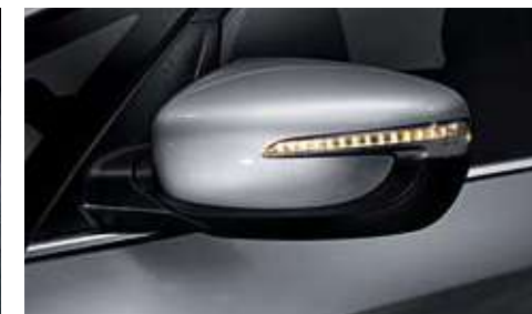
Side mirror Wing-type electric folding two-tone side mirrors feature LED turn signal lamps and puddle lamps for added safety and convenience.