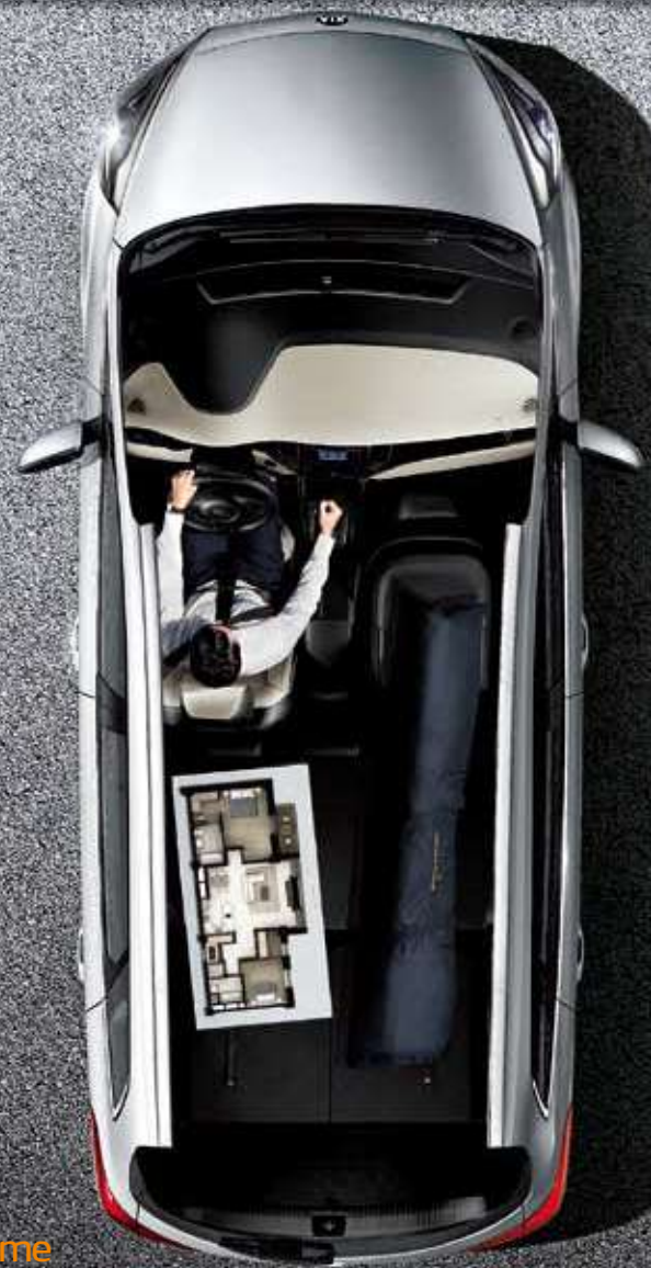
For me 1st row partial and 2nd & 3rd row full folding