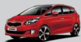
Inferno Red (AJR)