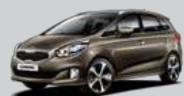
Galaxy Brown (K7N)