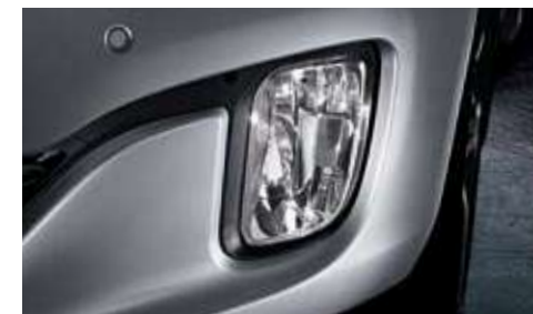
Fog lamps The fog lamps are stylishly integrated with the air intake holes of the front bumper using black housing to accentuate the car's athletic stance.