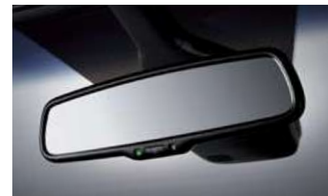
ECM mirror Distracting headlamps behind you are a thing of the past thanks to the auto-dimming, wide-angle electric chromatic mirror.