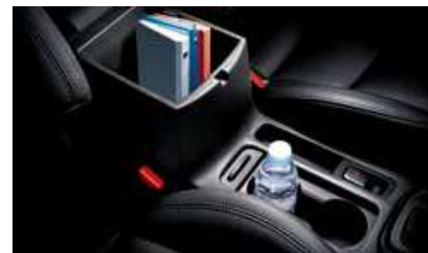
Center console Two drinks can be securely stored within easy reach while a center fascia undertray and large storage compartment under the center armrest provide plenty of space for storing personal items.