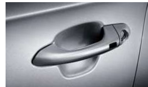
Outside door handle Body color grip-type handles come as standard, but for a more classic look you can also choose chrome-finished handles as an option.