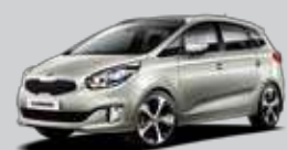
Camden Beige (K3Y)