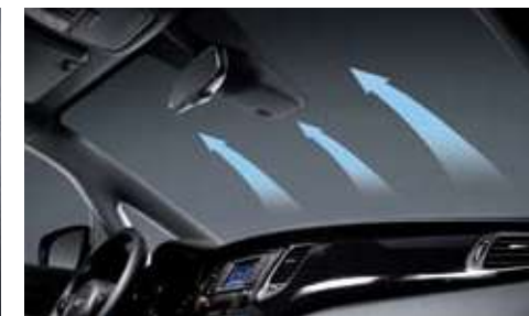
Auto defogging system A sensor automatically initiates a defogging process when condensation is detected on the windows to ensuring optimal visibility in humid climates.