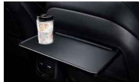
Fold-up tray The backs of both driver and front passenger seats are fitted with convenient trays that feature an additional cup holder for extra convenience of the 2 nd row seat occupants.