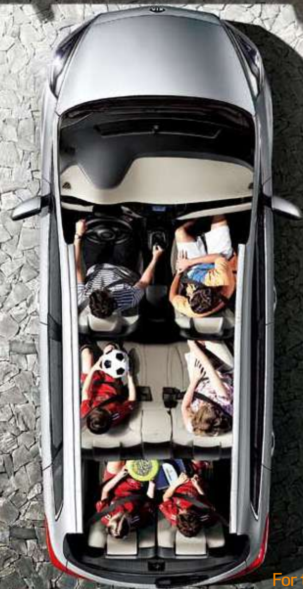
For the kids Seating for 7 people