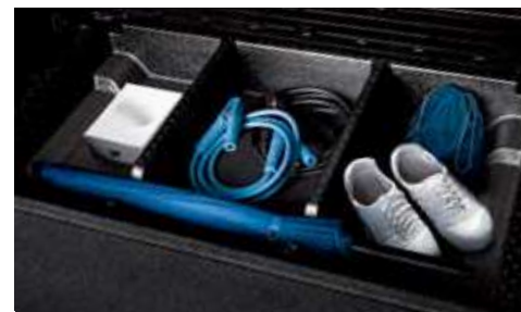
Cargo under storage compartment A spacious compartment located under the floor at the rear of the vehicle is the perfect place to store away emergency safety and cleaning supplies.