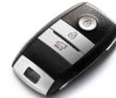
Remote keyless entry system The smart key unlocks the doors as soon as you touch the door handle so that you never have to worry about fumbling around for keys.