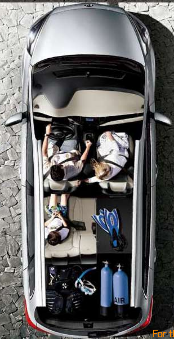
For the family 2nd row partial and 3rd row full folding

Live life to the fullest thanks to a level of cargo and passenger seating versatility that will push the limits of your imagination.