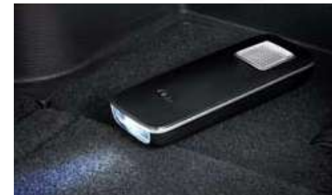
Portable flashlight When mounted on the wall socket, this handy detachable flashlight automatically recharges while also serving as an interior lamp for the cargo area.