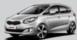
Bright Silver (3D)