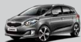
Titanium Silver (1M)