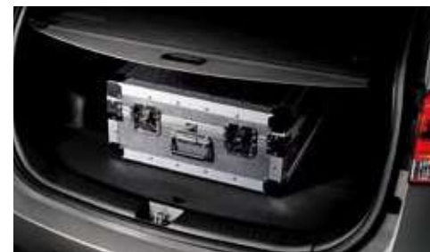
Cargo security screen Create a separate partitioned-off space at the rear of the vehicle to stow away any personally belongings that you want to hide from prying eyes.