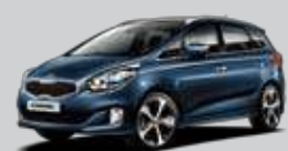
Newport Blue (KU9)