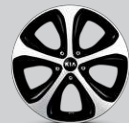
225/45R 18" Alloy Wheel