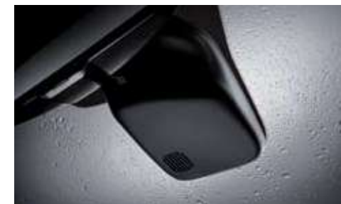
Rain sensor The windshield wipers are automatically activated as soon as moisture is detected for greater convenience and visibility.