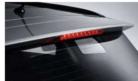
Rear spoiler / High-mounted stop lamp Standard on all models, the rear spoiler adds a sporty touch to the exterior design while a high-positioned stop lamp ensures that you are clearly visible to drivers behind.