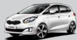
Clear White (1D)

Choose from eight stylish yet timeless exterior colors that truly show off new Carens' striking design cues.