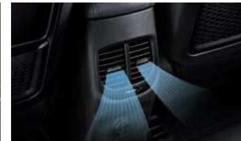
Rear air ventilation Back seat passengers can also enjoy warm or cool air circulation thanks to rear air vents positioned at the back of the center console.