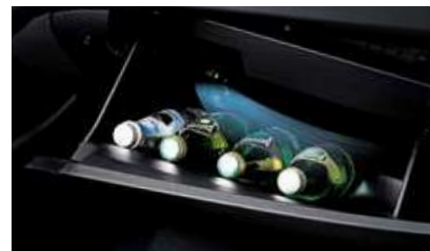
Cooled glove box The large 8L glove box has a cooling function that comes in handy when storing perishable items or cold drinks, especially on long journeys.