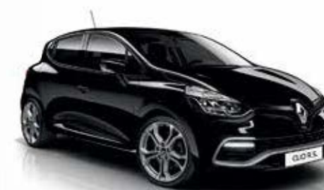
Deep Black (SEC) Available on Clio R.S. and Clio R.S. Trophy

SEC: metallic paint CO:= clearcoat opaque Photos not contractually binding. * Metallic paint with special clearcoat.