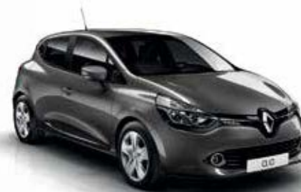
Oyster Grey (SEC) Not available on Clio R.S., Clio R.S. Trophy, Clio GT and Clio Pack GT-Line