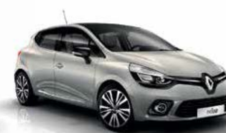
Frosted grey (SEC)