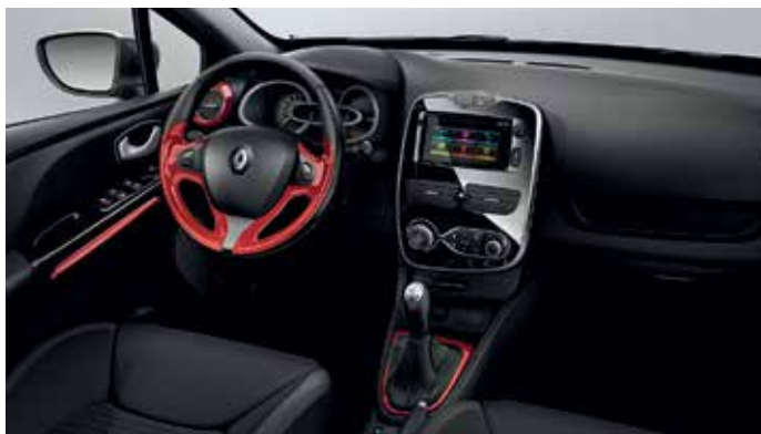
Red interior with Trendy trim