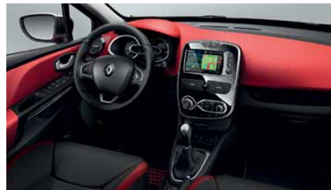
Red interior with Trendy trim