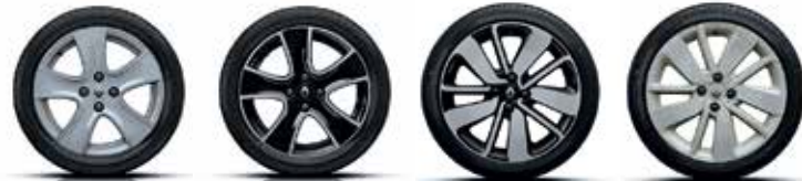
16" Passion standard 16" Passion black 17" Drenalic black 17" Drenalic ivory