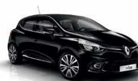
Starry Black (SEC)