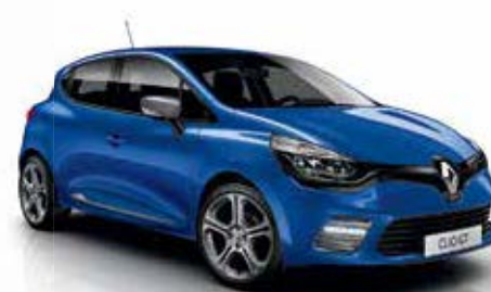
Maltese Blue (SEC) Available on Clio Pack GT-Line and Clio Estate GT 120 EDC only