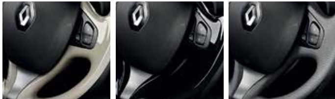
Ivory Black Elegant