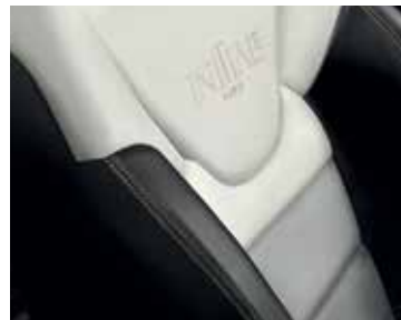
Nappa grey-ivory camaïeu leather* upholstery