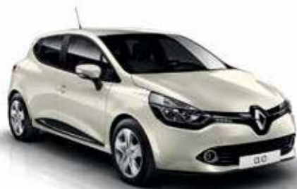
Ivory (CO) Not available on Clio R.S., Clio R.S. Trophy, Clio GT and Clio Pack GT-Line