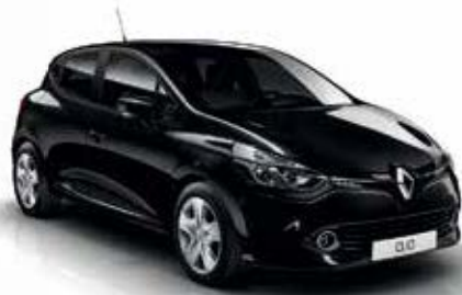
Starry Black (SEC) Not available on Clio R.S. and Clio R.S. Trophy