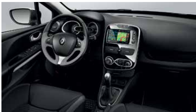
Black interior with Elegant trim