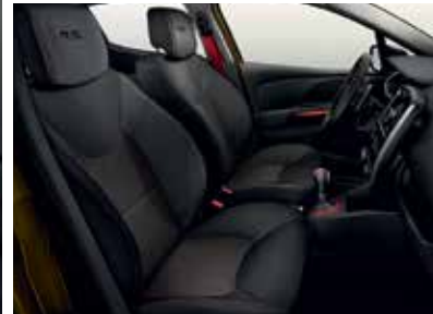
Fabric interior decor