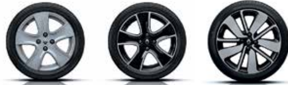
16" Passion standard