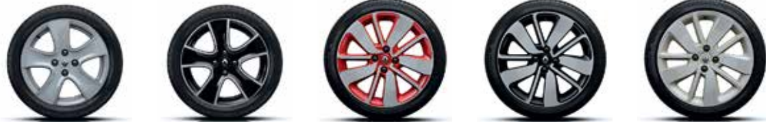
16" Passion standard