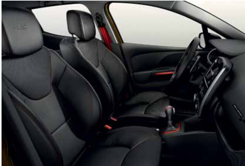
Leather interior decor