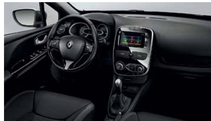
Black interior with Sport trim