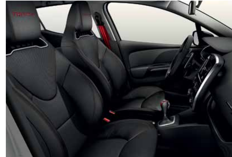
Leather interior decor