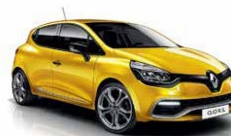
Sirius Yellow (SEC) Available on Clio R.S. and Clio R.S. Trophy