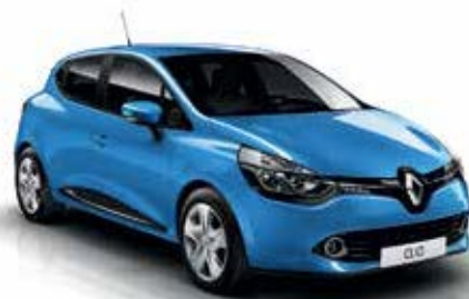
French Blue (CO) Not available on Clio R.S., Clio R.S. Trophy, Clio GT and Clio Pack GT-Line

SEC: metallic paint CO:= clearcoat opaque Photos not contractually binding. * Metallic paint with special clearcoat.