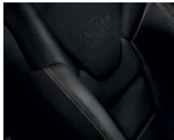
Nappa black titan leather upholstery