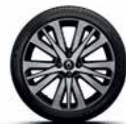
17" black diamond-cut wheel rims Initiale Paris