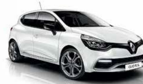
Matte Pearl White (SEC) Available on Clio R.S. only Trophy