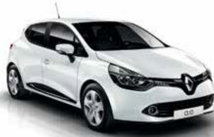
Glacier White (CO)