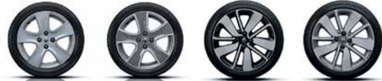
16" Passion standard