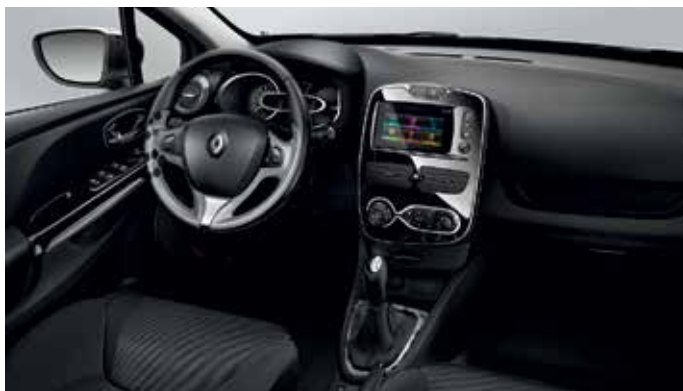
Black interior with Techno interior trim