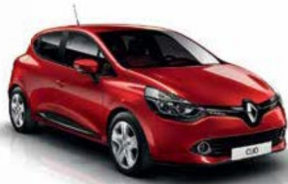
Flame Red (SEC)