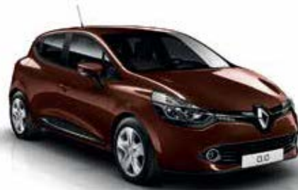
Fiery Brown (SEC) Not available on Clio R.S. and Clio R.S. Trophy