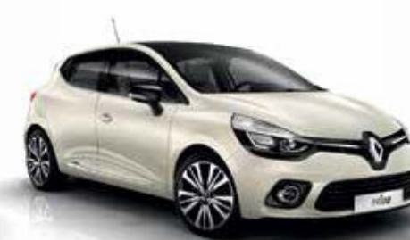
Solid Ivory (CO)