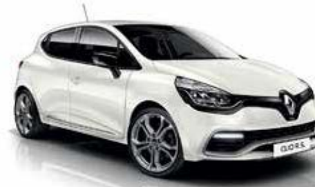
Gloss Pearl White (SEC) Available on Clio R.S. only