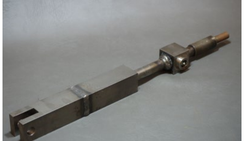
Steering Knuckle Ass'y Knuckle Mounting Kit Only 01BT6200 646007