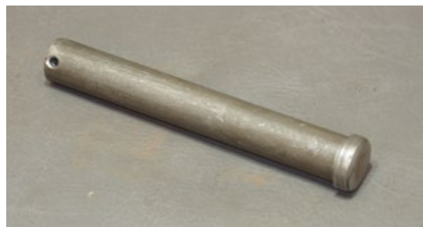
Auger Shank Pins