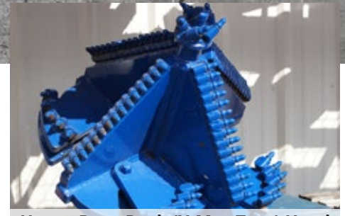
Heavy Duty Rock (X-Mas Tree) Head

The Heavy Duty Rock Head by American Augers is the durable cutting head ideal for bores through soft rock formations, harp pan, shale, gravel, small boulders, and other like intrusive ground conditions up to 6,000 psi. (413.68 bar). The “vee” shape of the head provides self-centering action to help maintain line and grade. The head also features Tungsten carbide bullet bits that can be used at aggressive drill angles.