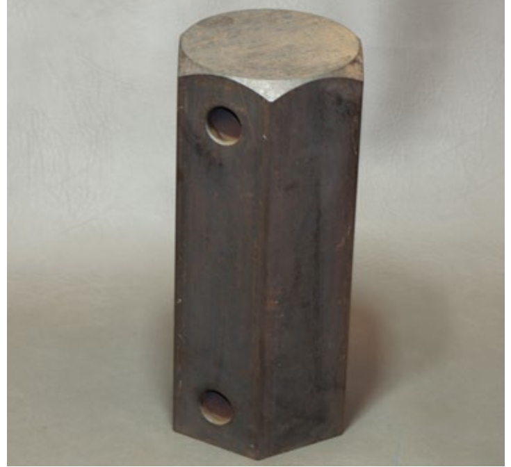
Hex Drive Shank