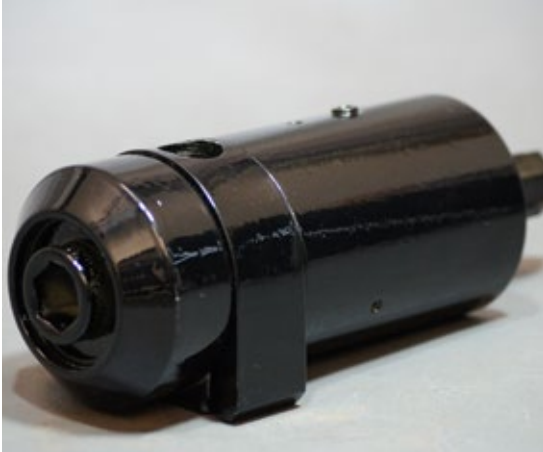
Torque Multiplier One Size Fits All 01BT2434