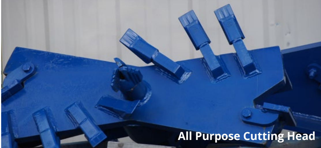
All Purpose Cutting Head