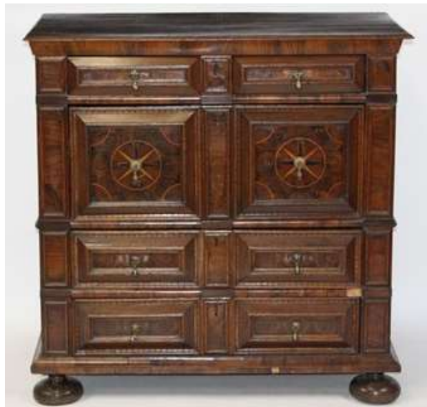
A William & Mary period oak, walnut and amboyna veneered chest £1,800