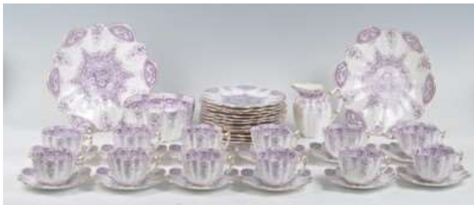
A circa 1895 Charles Wileman porcelain tea service £1,150