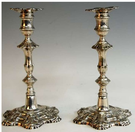
A pair of George II cast silver candlesticks £1,400