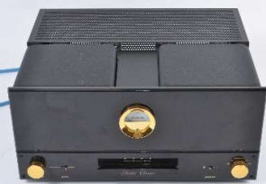
An Audio Classics Classic 9B Mono Tube Amplifier £1,050