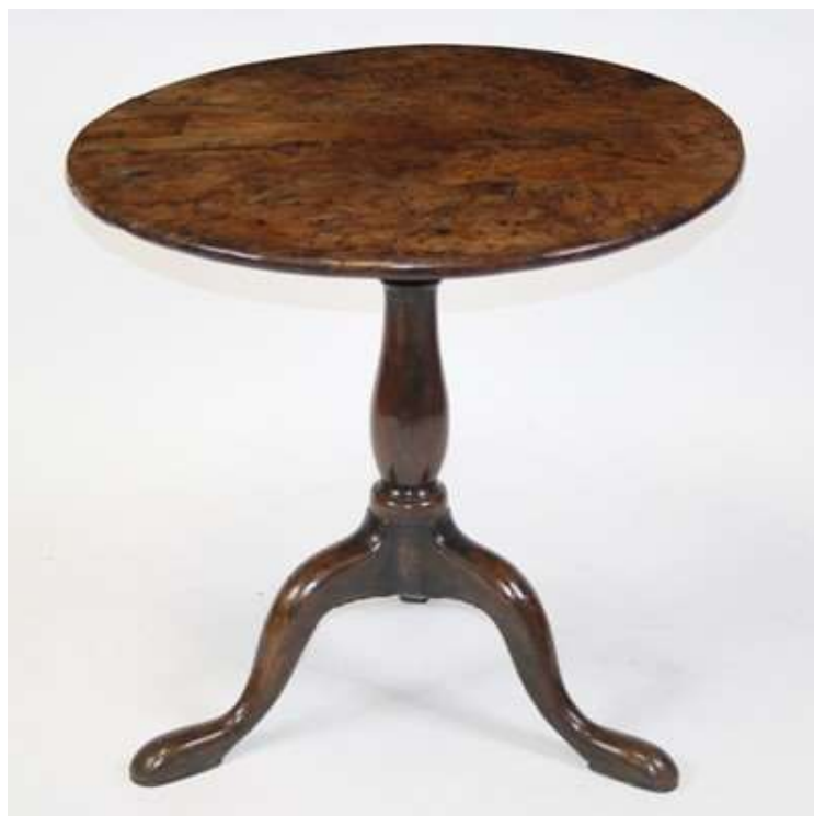
A George III yew wood pedestal tripod table £1,800