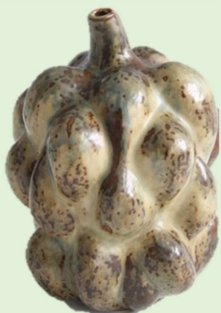
Axel Salto (1889-1961) for Royal Copenhagen - a 'Budding' vase £7,400