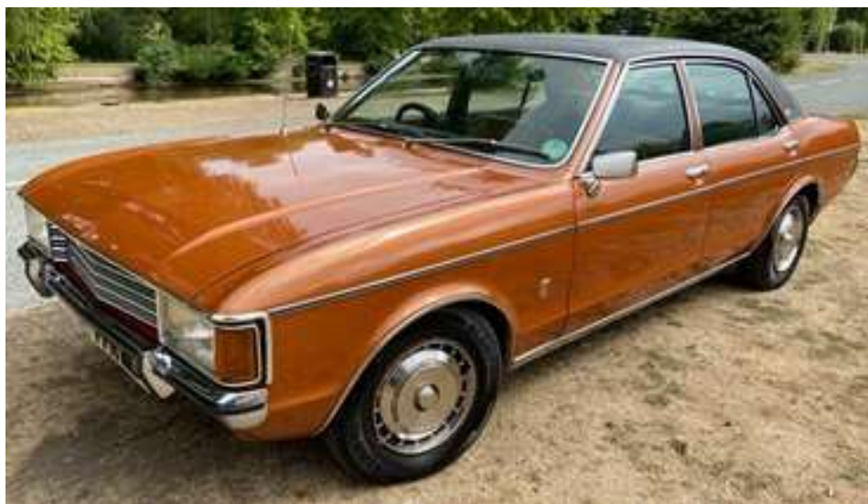
A 1973 Ford Granada GXL Automatic 3 litre saloon £12,200