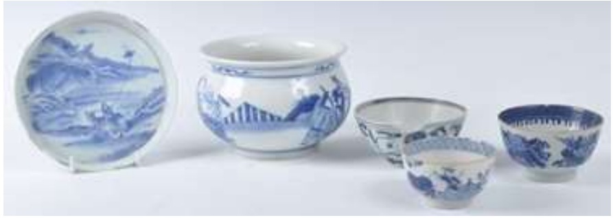
A collection of Chinese export porcelain blue and white wares £7,000