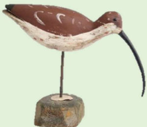
Guy Taplin (b.1939) - Curlew, painted wood £2,400