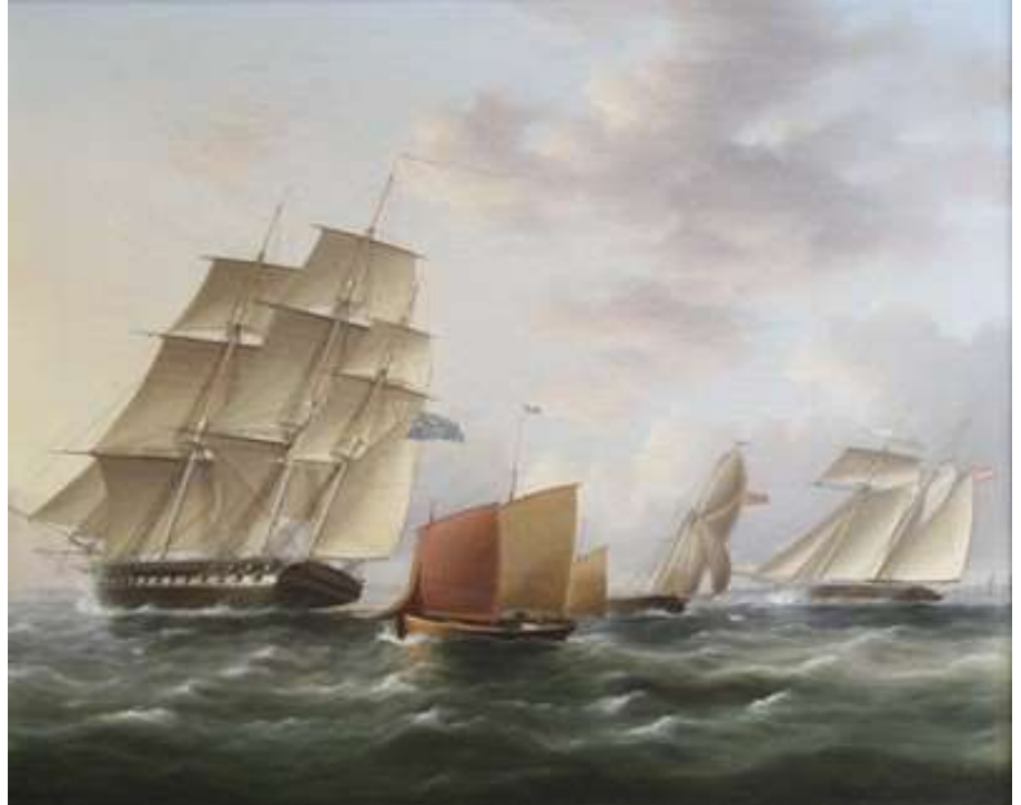
19th century English school - Naval frigate and sailing vessels leaving harbour, oil on canvas £1,600