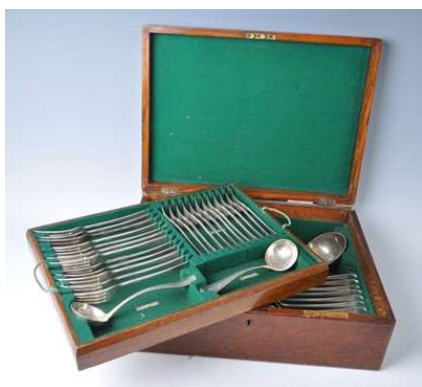
A cased Edwardian silver cutlery suite £2,000