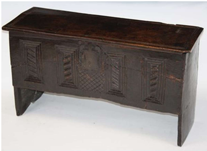
A Commonwealth period joined oak coffer £5,000