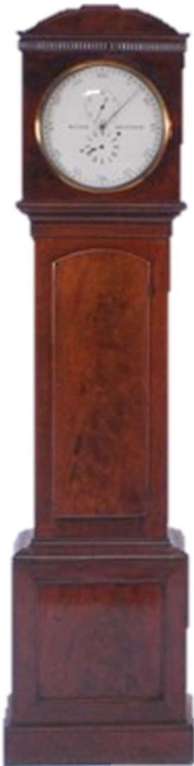
Michie - Brixton Road (London) - a circa 1830 mahogany longcase regulator £2,900