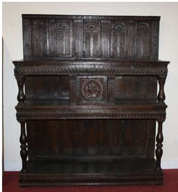
An early 17th century and later joined oak court cupboard £2,600