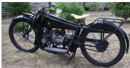
A 1921 ABC 398cc motorcycle £9,200