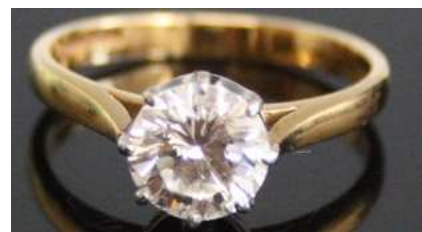
An 18ct yellow gold and platinum diamond single stone ring £1,700