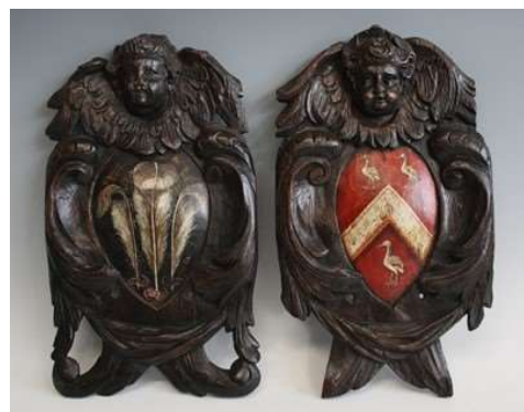
A pair of 18th century carved oak armorial plaques £2,100