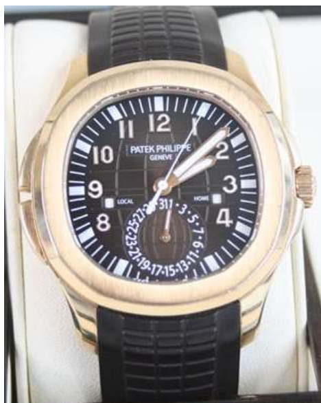
Patek Philippe - an 18ct rose gold Aquanaut Travel Time wristwatch £58,000