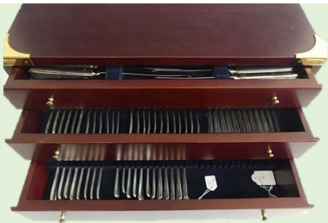
A contemporary silver canteen of cutlery by United Cutlers of Sheffield £1,250