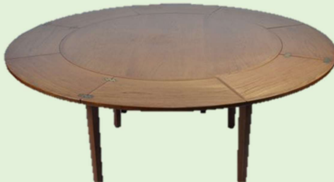
A Danish 1960s teak circular 'flip-flap' dining table by Dyrlund £780