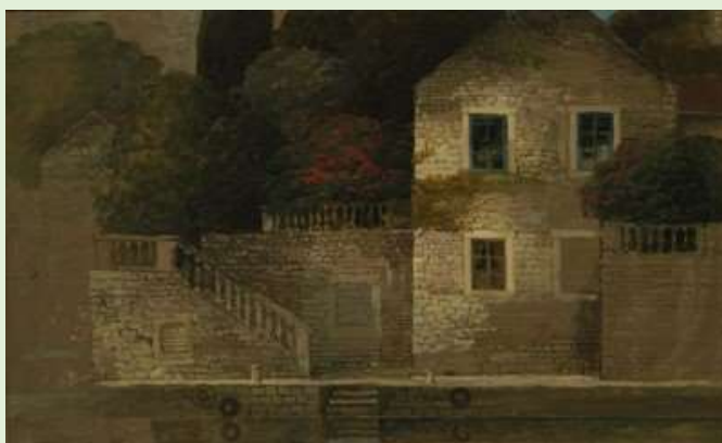
Safet Zec (b.1943) - Sipan, oil on canvas £3,100