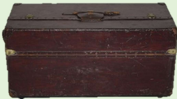
A Louis Vuitton circa 1905 natural tan leather Idéale travelling trunk £3,600