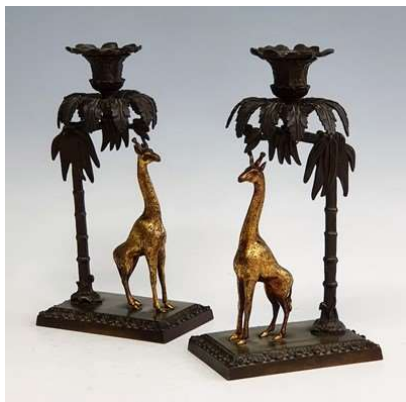
A pair of 19th century bronze and gilt bronze candlesticks, each in the form of a giraffe £1,250