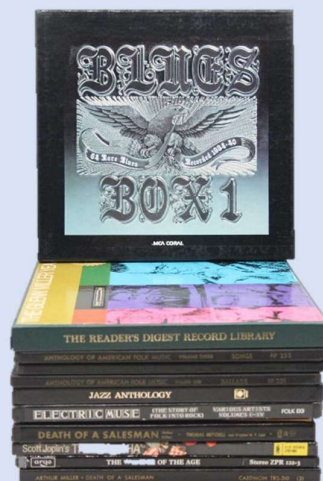
Rag-Time/Jazz/Folk/Country, a collection of LP's £1,900