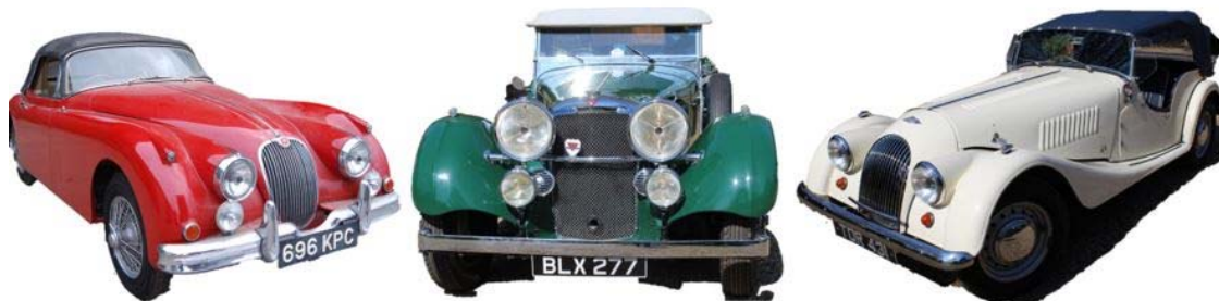
Sold left to right £77,000, £61,000, and £21,000

Free verbal appraisal for items considered for sale (without obligation) at our offices or by appointment in your own home for large/numerous items. Or using our online valuation service. Formal market valuations for the administration of an estate, Probate, Family Division and Insurance.