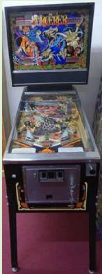
A 1980s Williams Flipper 'Sorcerer' pinball arcade machine £1,200