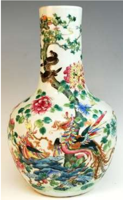
A 19th century Chinese famille rose tianqiuping vase £3,000