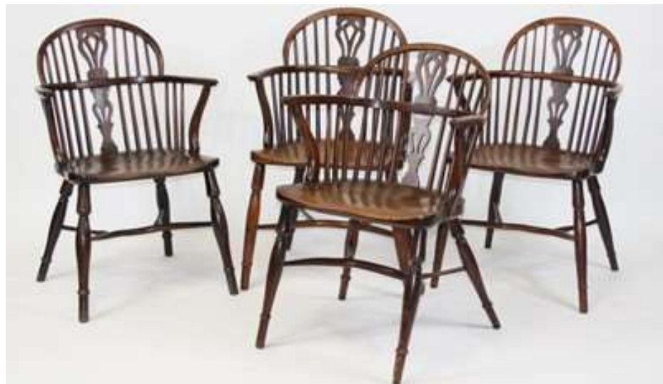
A set of four Victorian elm seat and yew wood Windsor chairs £2,500