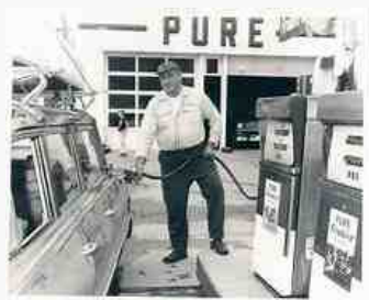
The Nagurski gas station in International Falls.