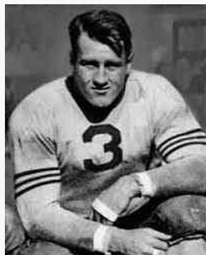
Bronko Nagurski One fine football player 1908 - 1990

Bronislaw "Bronko" Nagurski (November 3, 1908 - January 7, 1990) was a Canadian-born American football player in the National Football League (NFL), renowned for his strength and size. Nagurski was also a successful professional wrestler, recognized as a multiple-time World Heavyweight Champion.