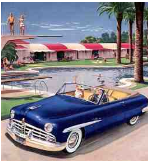
From one of the advertising brochures to show the 1949 Cosmopolitan convertible in the "best light."

truck engine after 1951. This was a 90-degree, 900-pound engine developing 152 horsepower @ 3,600 rpm. It was a vast improvement over the HV-12; which, as late as 1946 was planned for use in the 1949 Lincoln. The V-12's successor, the 336.7 V-8, had a 3.5 inch bore, 4.38 inch stroke, 7:1 compression ratio, and a maximum torque of 265 ft./lb @ 2000 rpm. In contrast, Cadillac's revolutionary ohv V-8, introduced on the 1949 models, weighed 200 pounds less. Lincoln did not have an ohv V-8 engine until 1952.