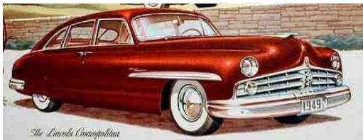
Above; 1949 Cosmopolitan front Below; 1950 Cosmopolitan front

The 1949 Lincoln and Lincoln Cosmopolitan production at 73,460 was a Lincoln record until 1972. But you must remember that the 1949 Lincoln was introduced in April 1948. For the 1949 model year Lincoln produced 38,384 Lincolns and 35,123 Lincoln Cosmopolitans. In Cosmopolitans, there were 18,906 Sports Sedans, 7,302 Town Sedans, 7,685 coupes, and 1,230 convertibles. There is no break-down of Lincolns by body type.