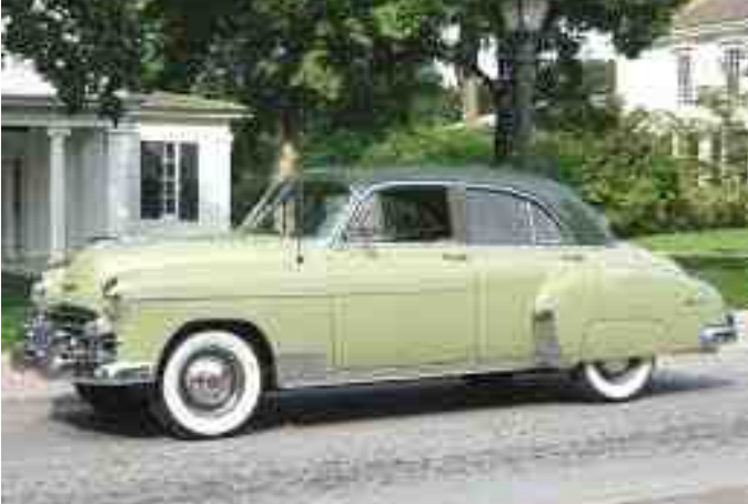
File photo of a 1949 Chevrolet DeLuxe four door sedan. Similar to the model owned by the Freiberg family and used for their daily transportation. Not a bad looking car.

The following is a story based upon childhood memories by member Bruce Freiberg. The family car provided to be a great source of both enjoyment and aggravation for all family members. We thank Bruce for sending this story to us.