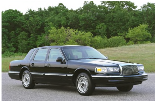
1995 Town Car

Road test article from "New Car Test Drive," an internet publication.