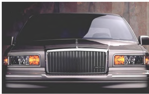
1995 Lincoln front end. Pure elegance.

(continued from page 6) ly new design for the Town Car. Many traditional Lincoln styling cues were heavily reworked or abandoned completely. Although the Town Car would keep its formal notch-back sedan roofline, the flat-sided fenders and angular lines seen since the Continentals and Mark IIIs of the late 1960s disappeared. Stylists made the body more aerodynamic reducing drag coefficient from 0.46 to 0.36 (matching the 1988 Continental and besting the Mark VII). The 1990 Town Car still retained several styling influences, including its vertical taillights, radiator-style grille, hood ornament, alloy wheels, and vertical C-pillar window. In a move to market the Town Car towards buyers of contemporary vehicles, several other changes were made. Although two-tone paint remained available (featuring a lower body accent color in gray metallic), monotone paint schemes would become increasingly standard. In a major change, a vinyl roof was no longer offered, since vinyl roofs declined in popularity among many buyers. Spoked aluminum wheels were dropped from the options list for 1990, while locking wire wheel discs remained through 1992.