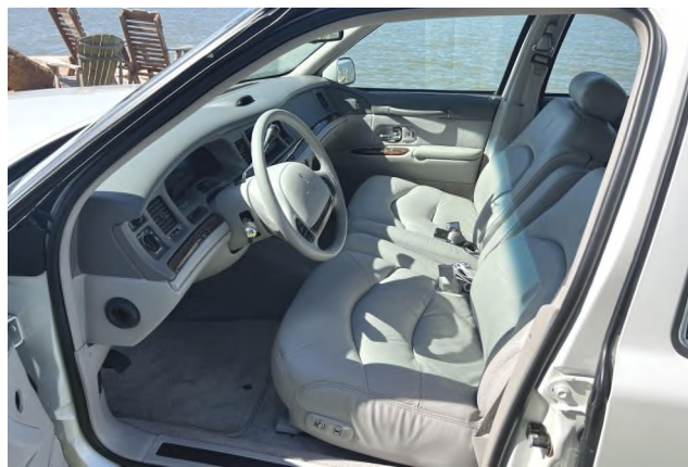
As usual, these Lincolns featured simple, but elegant interiors, with lots of room and comfortable seats.

Development - The second-generation Town Car was developed from 1985 to 1989 under the codename FN36, at a cost of $650 million USD, led by project manager John Jay. Following its downsizing to the Panther platform in 1980, the Lincoln Town Car was originally slated to be discontinued by the middle of the decade and replaced by a smaller front-wheel drive sedan; after the 1979 fuel crisis, gasoline prices were predicted to reach $2.50 per gallon and Ford Motor Company had lost $1.5 billion for 1980. However, by 1984, full-size Lincoln sales had rapidly increased, with 1984 sales up 300% over 1980.