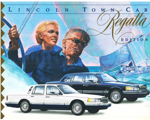
Town Car - Regatta edition

Most Jack Nicklaus editions have ornaments and wording on the exterior trimmed in gold including green and gold "Golden Bear" badges on the front fenders. Options included on the 1992 to 1997 Jack Nicklaus Signature Series included: Memory Seats with Power Lumbar/Recliner, Leather Seats and Monotone Paint.