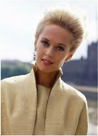
Tippi Hedren American Actress

Nathalie Kay "Tippi" Hedren (born January 19, 1930) is an American actress, animal rights activist, and former fashion model.