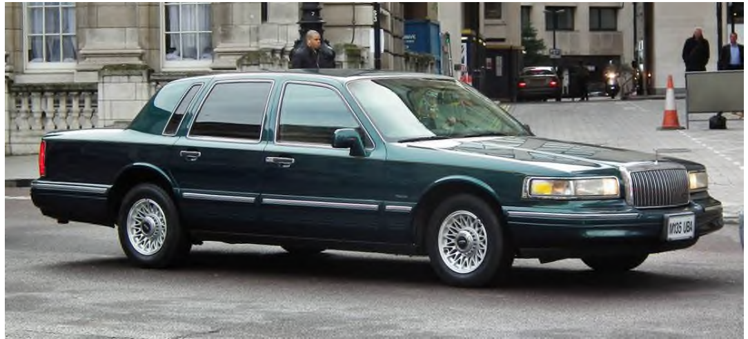
One fine automobile, this 1995 Town Car represents the Second Generation

In our June issue, we began a feature about one of the most widely recognized and appreciated Lincoln models, the Town Car. First introduced as a 1980 model, it continued through 1989 without any drastic changes. In the fall of 1989, an all-new Town Car was introduced to the public; another hit was made. This second generation model continued through 1997 when the third and final generation Town Car made its public appearance that fall.