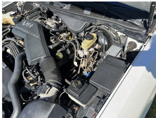
Above, the modular SOHC 4.6 Liter replaced the 302 cubic inch Ford small block engine beginning in 1991.

platform for the Lincoln Town Car, continuing its use of rear-wheel drive. In a major change, rear air suspension (introduced as an option for all three Panther vehicles in 1988) became standard equipment on all Town Cars. For 1990, the Town Car was produced with 11-inch rear drum brakes (identical to its 1989 predecessor); for 1991, they were replaced by 10-inch solid rotor disc brakes.