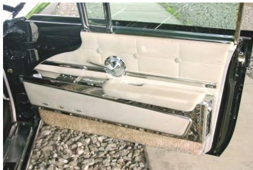
Shown... Right front door panel, massive in size. It contains two window motors and other hardware.

the left rear and right front floors. The complex, fully automatic top, which incorporates a power-retracting reverse-slant rear window like the Sedan, Landau, and Coupe, can weaken and become loose with age, with damaging results. According to Herb, "The scissor mechanism located above the driver's head, which supports the center top bow in the side rail, can fold inward instead of up and away, bending the frame and worse. You can avoid this by pushing up against the top crossbow directly above you after the windshield clamps unlock and keeping a steady pressure on the bow until it has hinged upward, away from the frame." Replacement bushings, hinges, and top cylinders are available, as is new top material.