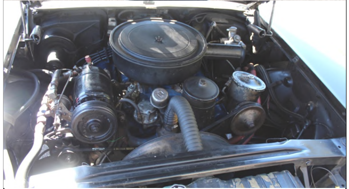
'58 Cadillac Fleetwood 60S engine bay

Feiertag enjoys the attention that the car gets. It's pretty much a one-car motorcade wherever it goes, even on a show field full of other fine machines.