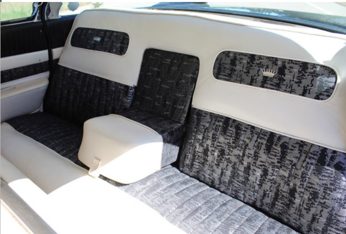
The Cadillac features a spacious and well padded rear seat.

"The one thing that we've had the most problems with is the brake booster. They've been a problem and I guess it's kind of a vertical system. It's been crazy, I just got done replacing that and those things are expensive as heck! And it's been about the fourth one I've replaced. I dunno, I just can't seem to get one to last. Otherwise, it's just the regular stuff — brakes, tires, that sort of thing. I do have to get the air conditioning fixed. It worked up until last fall. I've got a problem in there now and I need to get that worked on. It's factory air, so that's kind of cool."