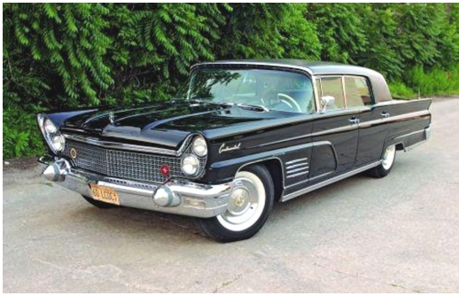
Pictured... 1958 Lincoln Continental

(Continued from page 4) design, massive stretch-out room, and distinctive styling. With prices on their forebears and followers rising by the day, now is the time to aim for middle ground and pick up a 1958-'60 Continental.