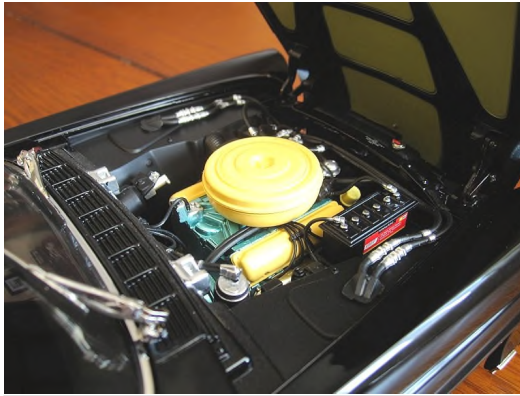
1958 Lincoln Continental Engine Bay

Despite the general availability of parts, there are a few mechanical parts that will prove challenging or expensive to source, like the vacuum pump at the bottom of the oil pump, but Herb has been recreating some discontinued parts in small batches. When it comes to upgrades, he recommends installing a PerTronix ignition system ("They're very forgiving on older cars").