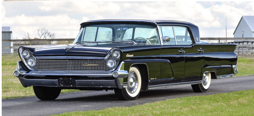
Top 1958 Cadillac Fleetwood 60S, below 1958 Lincoln Continental

Welcome to the Northstar News, the monthly publication of the Northstar Region of the Lincoln and Continental Owners Club. We value your opinions and appreciate your input concerning this newsletter and the operation of the club. This is your club.