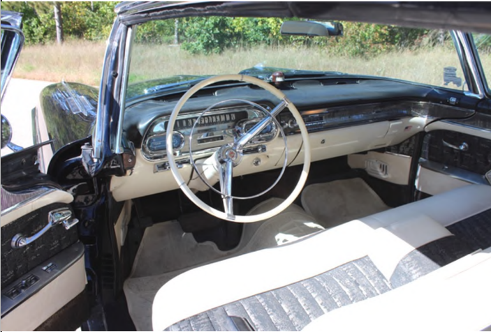
Front seat and dash of the Fleetwood 60 Special