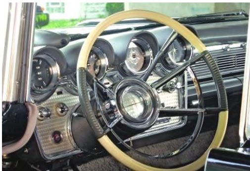
The 1958 Continental Dashboard, a bit busy looking, but it is all there.

Their unusual size meant that the Lincoln brakes were unique in the Ford family of products, and while this may cause confusion for some Ford parts suppliers, those in the know say that new shoes and hoses can be sourced, along with used but serviceable drums.