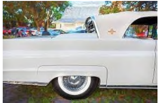
Right rear side detail, 1958 Lincoln Continental

I was a car-crazy 10-year-old when the 1958 Lincoln Continental came out. Growing up in Homewood, Ill., I was known as the kid in school who doodled cars everywhere. My dad sold insurance, and the local Lincoln-Mercury dealer was one of his customers. One day I begged him to take me with him on a sales call because I wanted to see the new Lincoln. Even then, I liked the way it looked. Dad never bought a Lincoln; he couldn't afford one. This was back when the notion was that you'd work your way up a car company over the years; you'd start out at Ford, segue to Mercury and end up at Lincoln. Dad never made it past Ford.