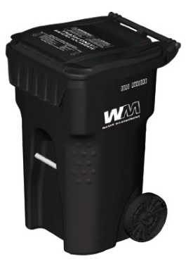
Trash-Black Cart No household hazardous waste.