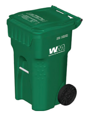
Green Waste- Green Cart Please see reverse for list of Yard waste such as leaves and grass clippings.

As part of your automated pick up service, Waste Management provides 96 gallon trash, recycling and green waste carts.