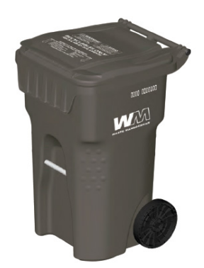
Recycle- Gray Cart acceptable recyclables.