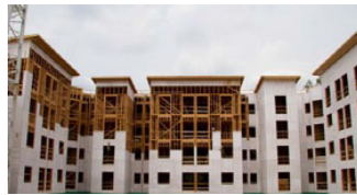
LP FLAME BLOCK FIRE-RATED OSB SHEATHING