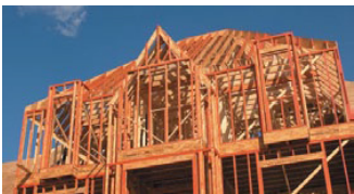
LP SOLIDSTART ENGINEERED WOOD PRODUCTS