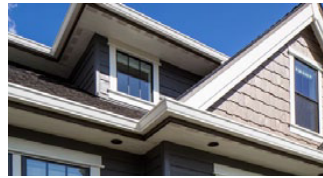
LP SMARTSIDE TRIM & SIDING