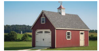
LP OUTDOOR BUILDING SOLUTIONS